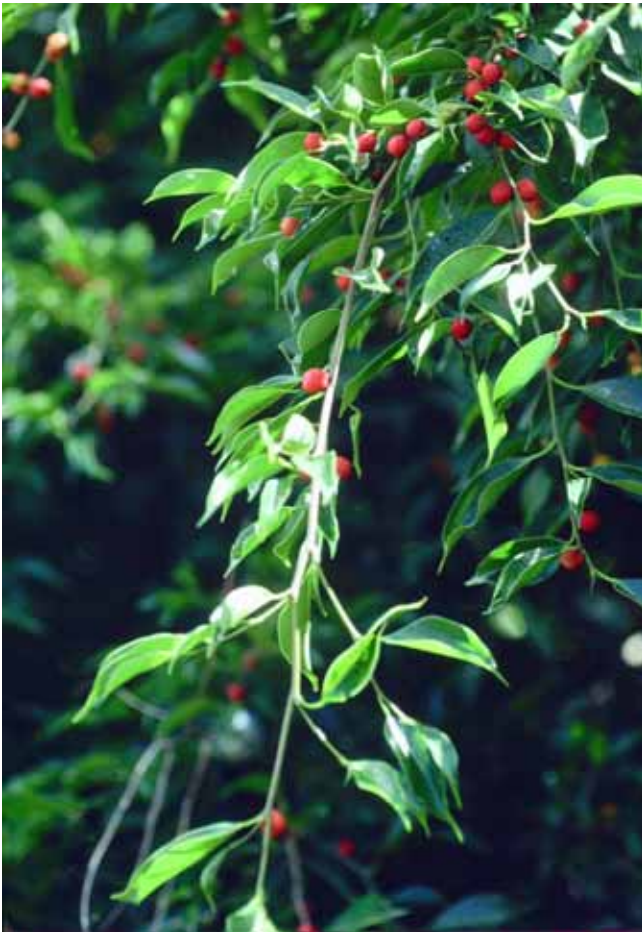
31. Ficus benjamina 'Exotica'