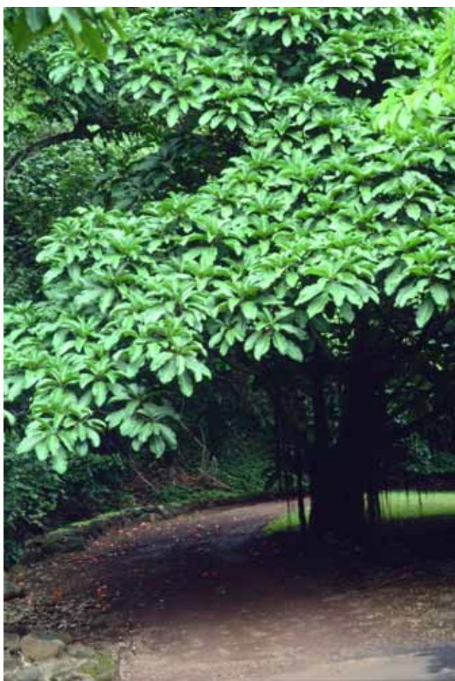
24. Ficus saussureana