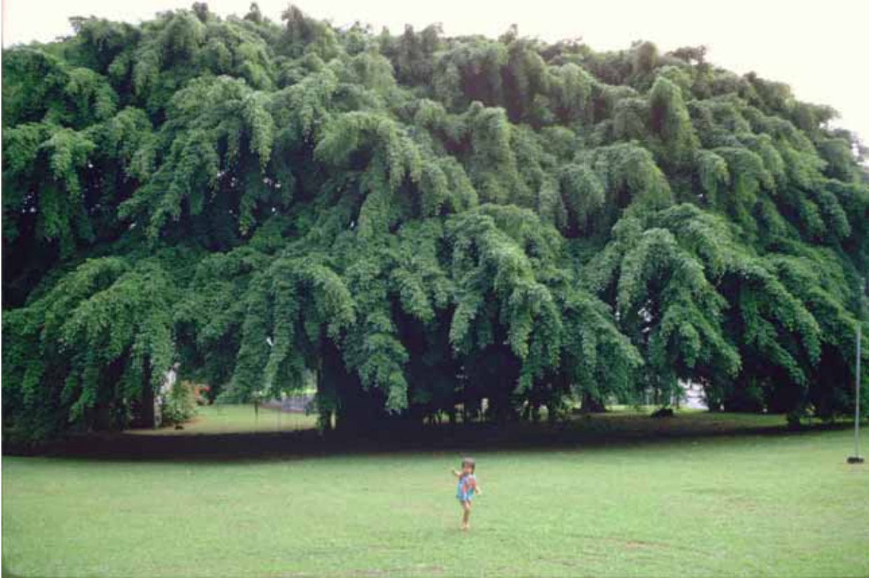
4. Ficus benjamina (weeping fig)