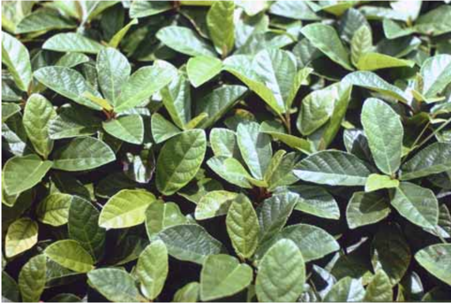
30. Ficus tikoua (Waipahu fig)