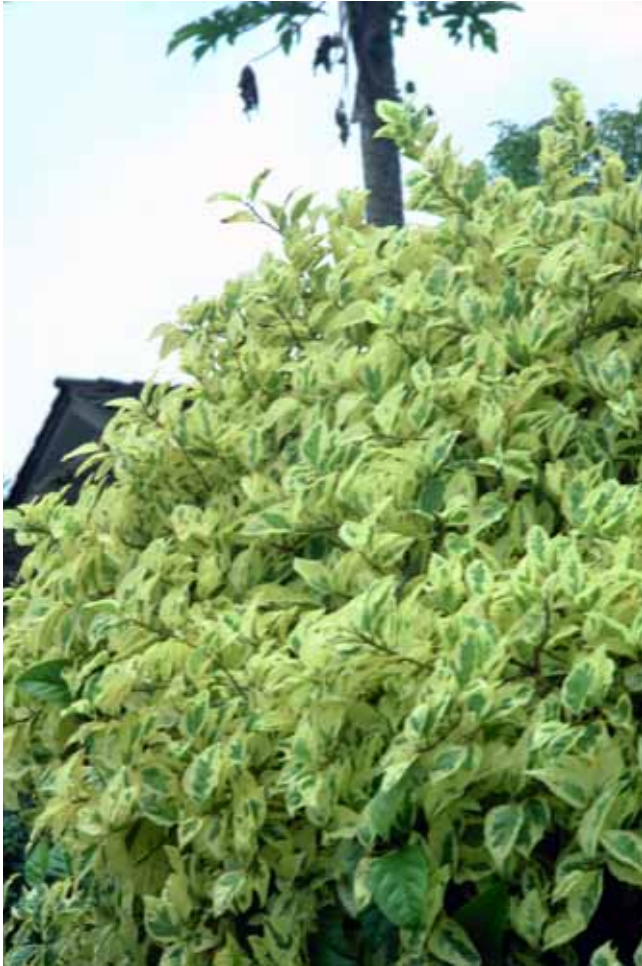
26. Ficus sagittata 'Variegata'