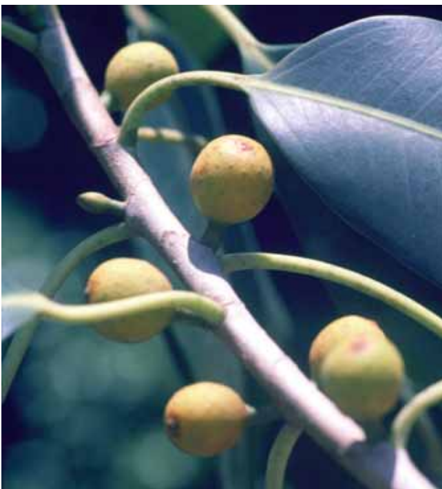
15. Ficus rubiginosa (rusty fig)