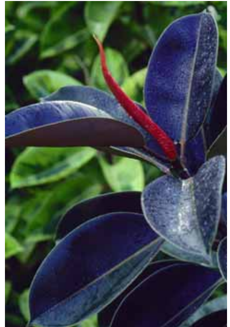
9. Ficus elastica 'Abidjan'