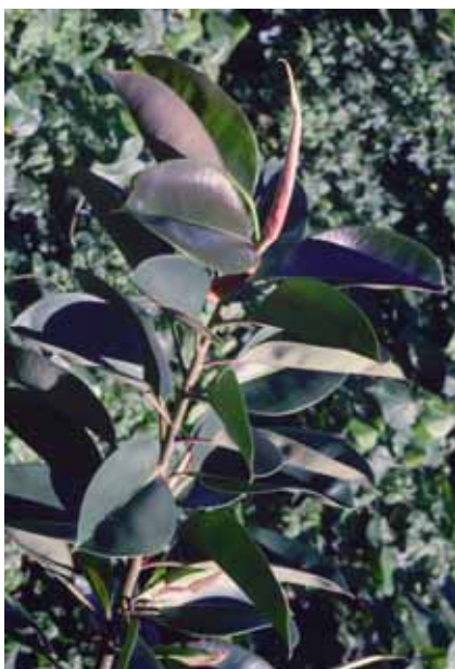
10. Ficus elastica 'Decora'