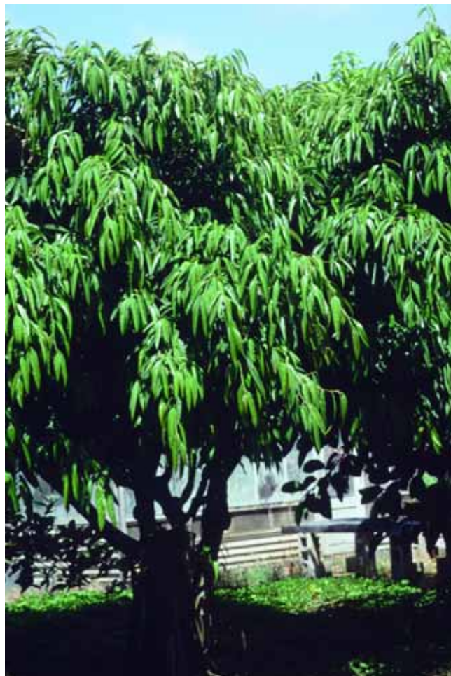
19. Ficus binnendykii 'Alii' (narrowleaf fig)