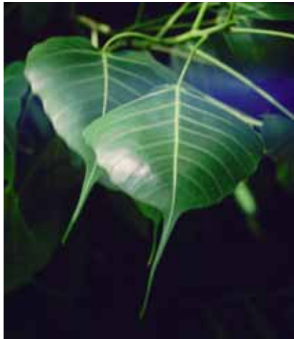
7. Ficus religiosa (bo tree)