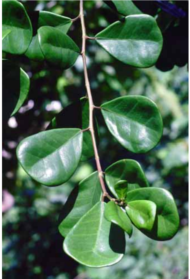
27. Ficus triangularis