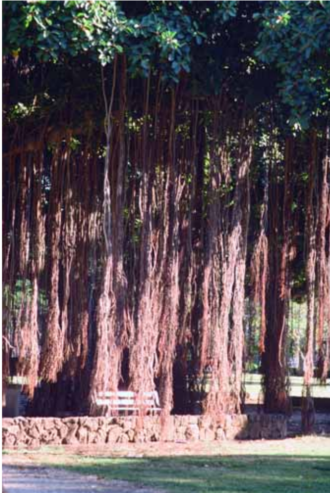
1. Ficus benghalensis (Indian banyan)