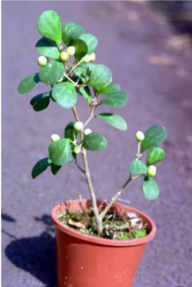
28. Ficus deltoidea (mistletoe fig)