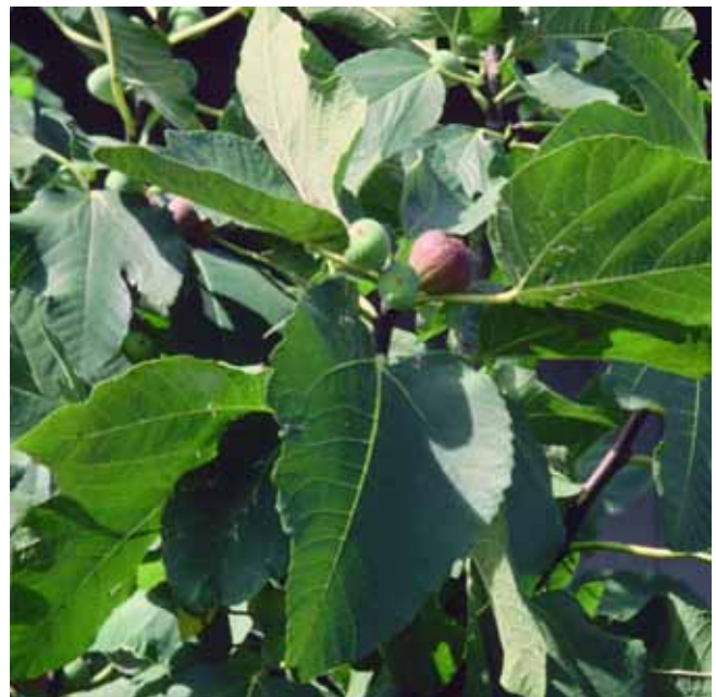
16. Ficus carica (edible fig)