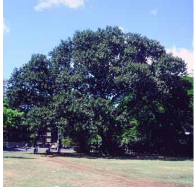
6. Ficus macrophylla (Moreton Bay fig)