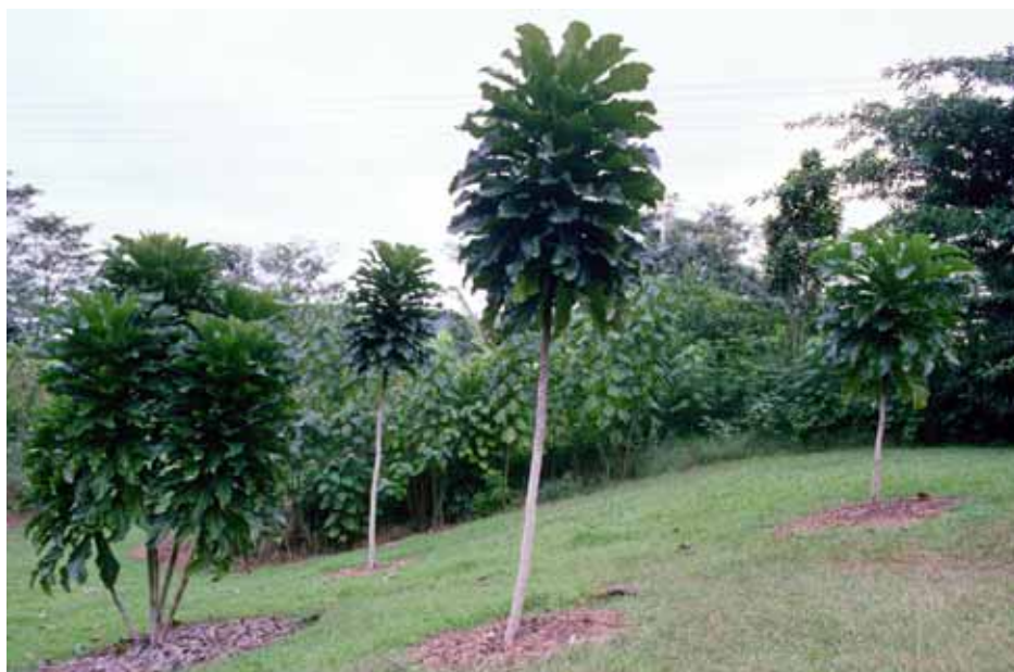
23. Ficus pseudopalma (Philippine fig)