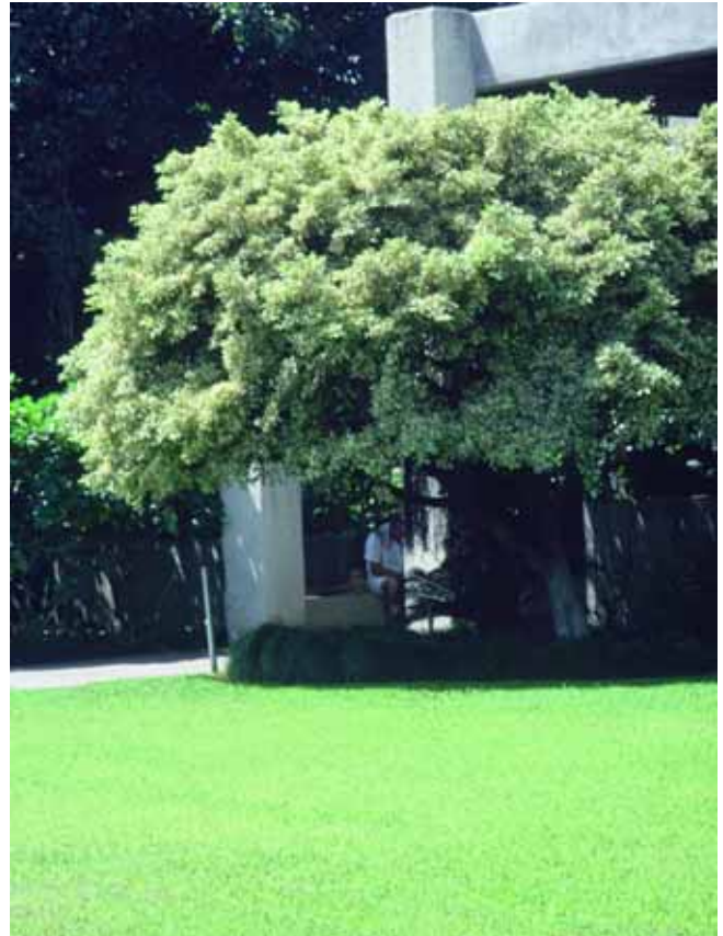
22. Ficus microcarpa 'Variegata' (variegated Chinese banyan)