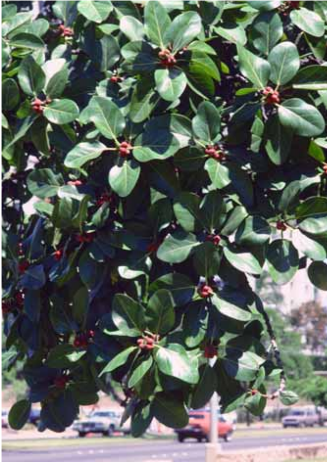
5. Ficus altissima