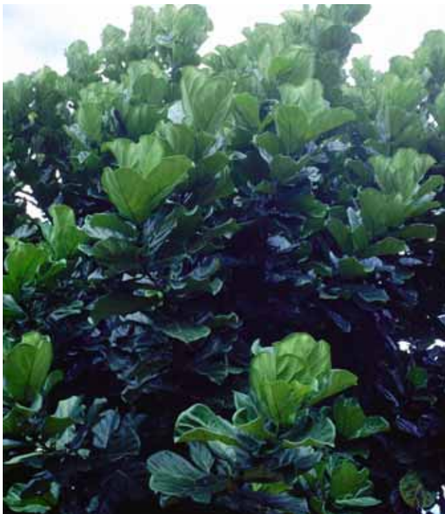
21. Ficus lyrata (fiddle-leaf fig)