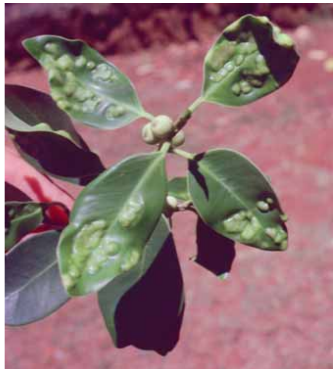
3. Wasp damage to Chinese banyan