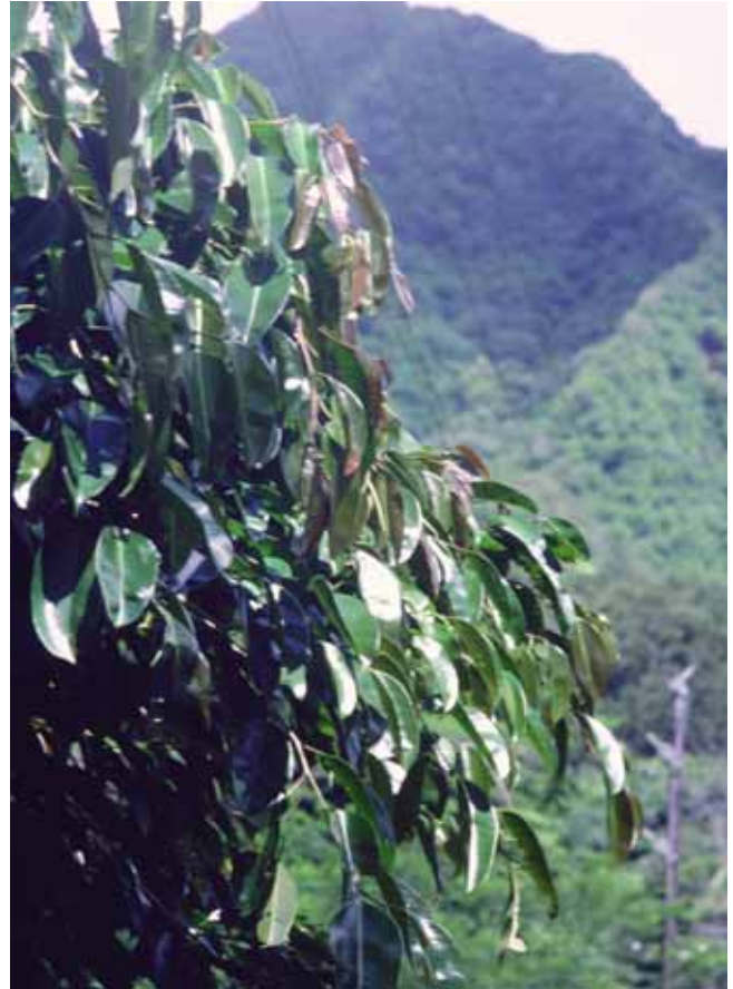
14. Ficus neriifolia 'Nemoralis'