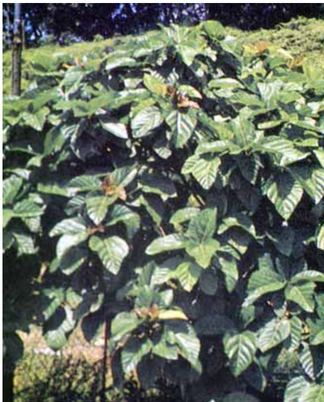
17. Ficus auriculata