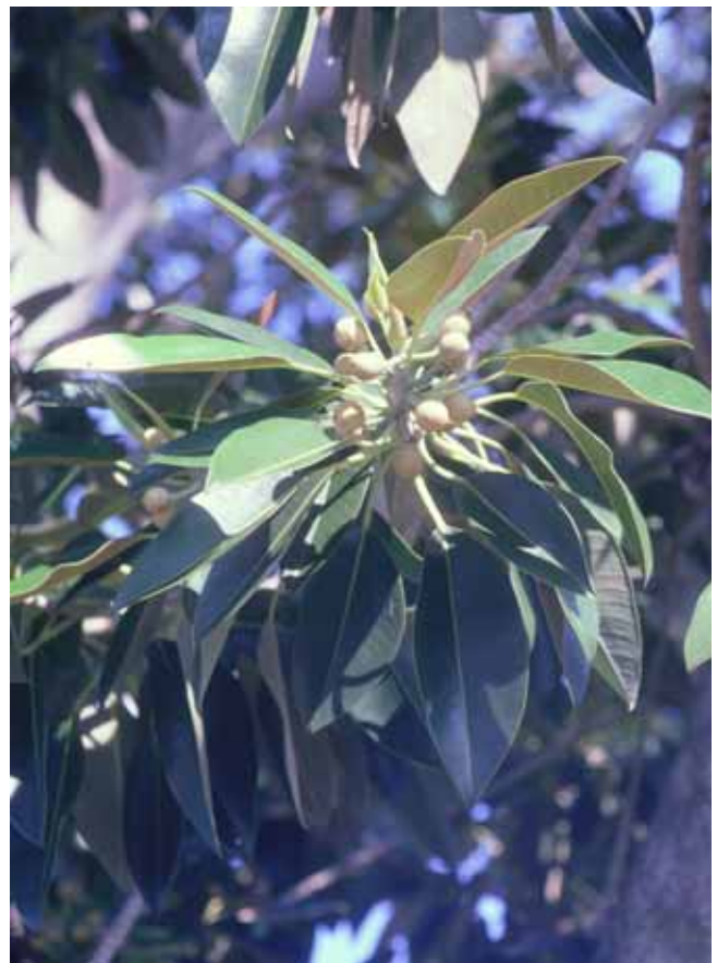
6. Ficus macrophylla