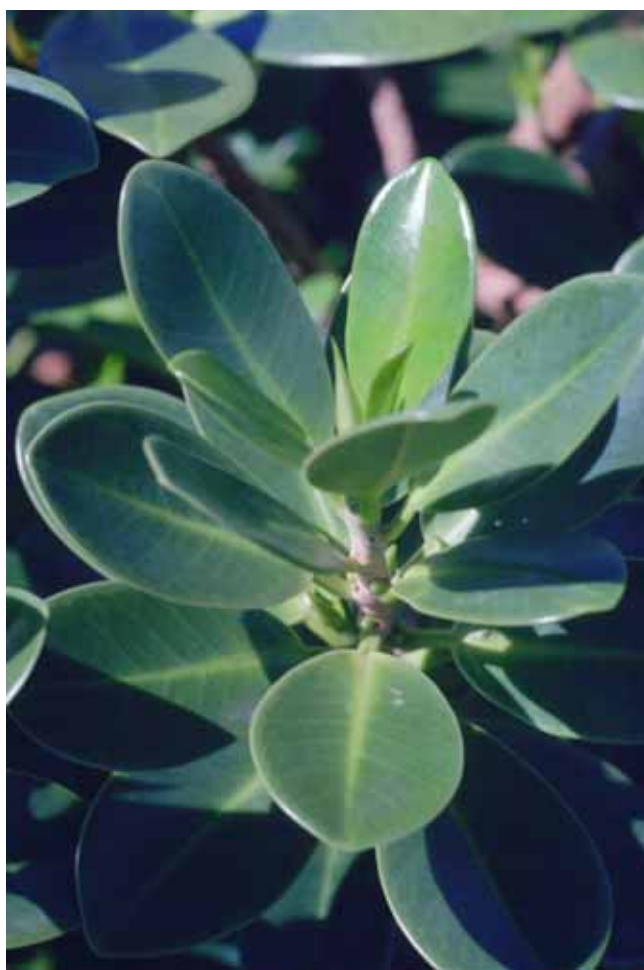
25. Ficus microcarpa var. crassifolia (wax ficus)