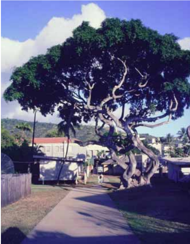
13. Ficus benjamina 'Comosa'