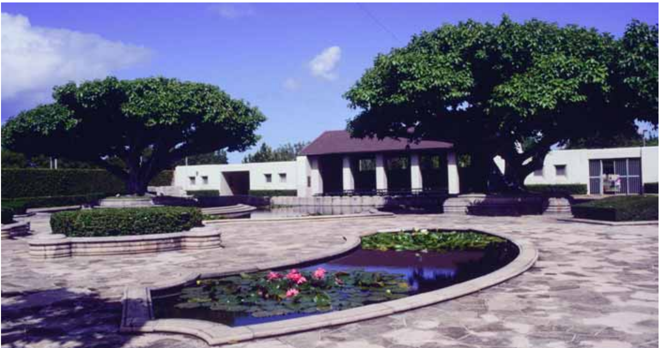
5. Ficus altissima (council tree)