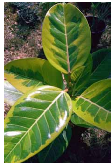
12. Ficus elastica 'Gold'