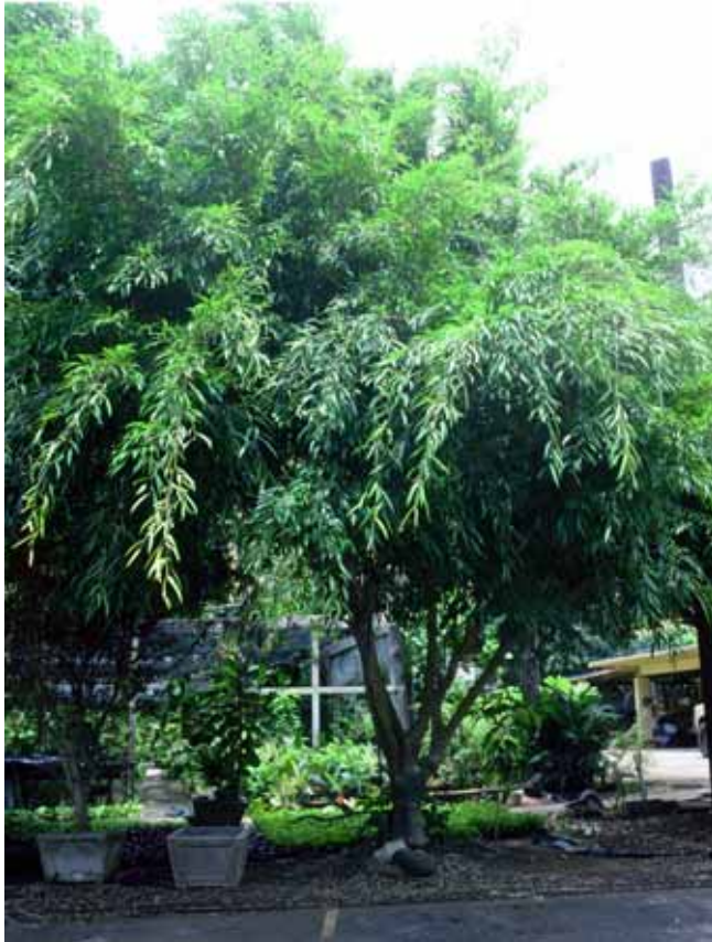
20. Ficus celebensis (willow ficus)