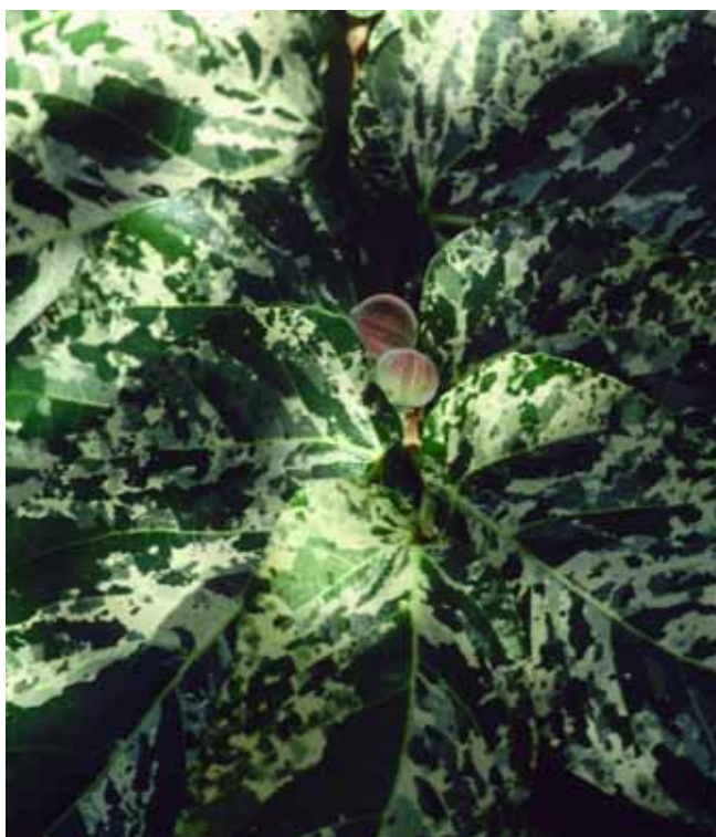
18. Ficus aspera (clown fig)