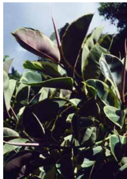
11. Ficus elastica 'Asahi'