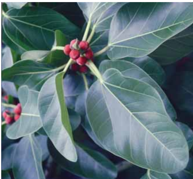
1. Ficus benghalensis