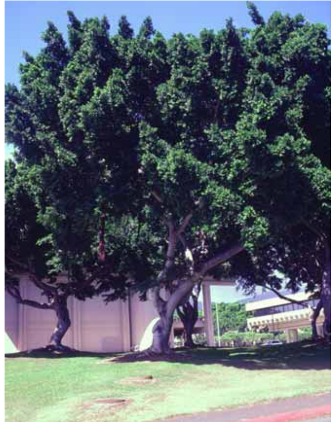
2. Ficus microcarpa (Chinese banyan)