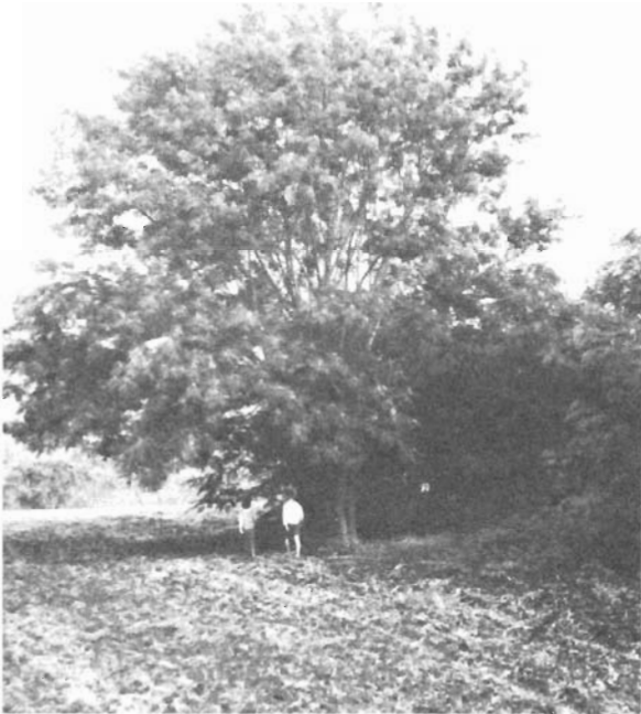
Figure 2. Three-year-old 80-chromosome trees of K19 × K63 ( L. pulverulenta × L. leucocephala ).

est in its hybrids with koa haole (Gonzalez, Brewbaker, and Hamill, 1967). These 80-chromosome hybrids were vigorous in growth, forming a 40-foot tree in 3 to 4 years (Figure 2). They were not heavily seedy, due to chromosomal sterility, and made an excellent windbreak on the Kapaa Farm at 600 feet elevation.