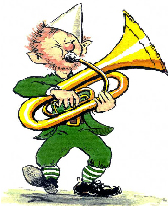
Above: Seamus O'Tuba

"Proud wee folk wearing green, in Union Township no