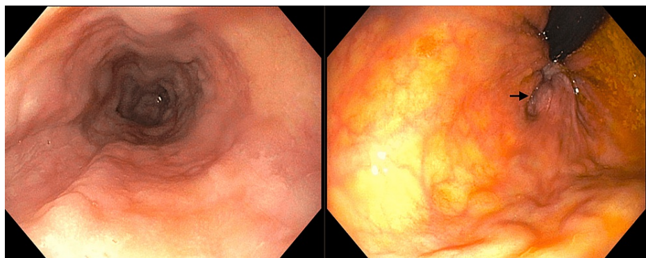
FIGURE 1: Grade I esophageal varices (left) and internal hemorrhoids (right) found by EGD and colonoscopy

WBC: white blood cell, CO2: serum bicarbonate, BUN: blood urea nitrogen, AST: aspartate transaminase, ALT: alanine transaminase, ALP: alkaline phosphatase, T-Bil: total bilirubin, TP: total protein, PT: prothrombin time, INR: international normalized ratio, aPTT: activated partial thromboplastin time.