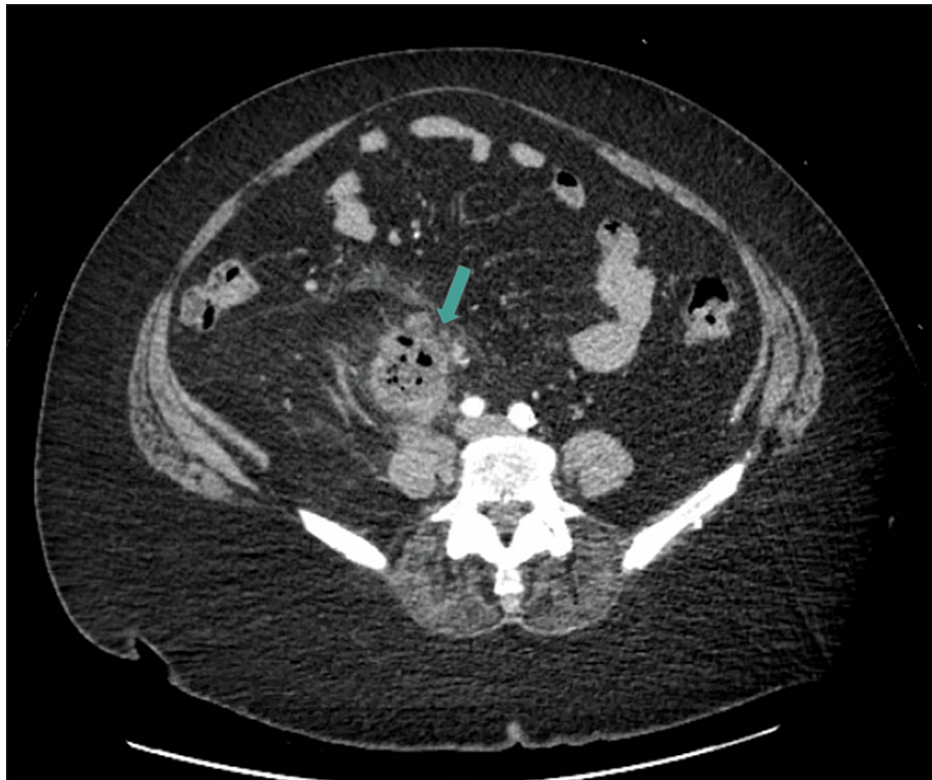
FIGURE 5: Cross-sectional CT transverse view demonstrating a gas and fluid-filled peri-ureteral structure, consistent with abscess