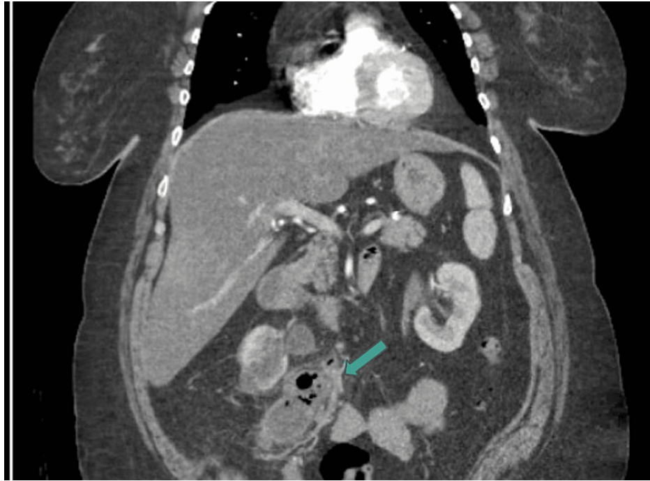
FIGURE 4: CT coronal view of gas and fluid-filled peri-ureteral structure, consistent with abscess