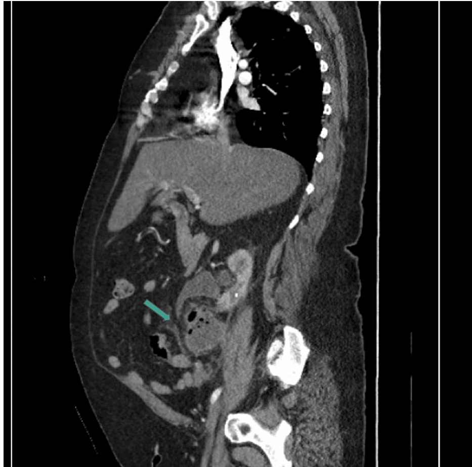
FIGURE 3: CT sagittal view representing the peri-ureteral fluid and gas-filled lesion, consistent with abscess

abdominal pain, shortness of breath, nausea, vomiting, and diarrhea. Three days prior to the presentation, she had the aforementioned ureteral stent removed by her urologist as an outpatient. On presentation, she was afebrile, with vital signs significant only for tachycardia of 126 BPM. Her physical exam revealed a firm, distended, and diffusely tender abdomen, most notable in the epigastric region. Laboratory analysis revealed a creatinine of 1.3 mg/dL, BUN of 22 mg/dL, hemoglobin of 9.1 g/dL, and white blood cell count of 8.9 \times 10^9/L . Her urinalysis was significant for 50 mg protein, <20 RBCs, >100 WBCs, positive leukocyte esterase, and rare bacteria. Due to the nature of her symptoms in the setting of a recent hospitalization and procedure, she underwent both CT angiography of the chest and CT cross-sectional imaging of her abdomen and pelvis with contrast, which revealed a subsegmental PE, an abscess located adjacent to the right mid-ureter with gas, and a distal right ureteral stone causing mild hydronephrosis. The abdominal CTs revealing the abscess are shown in Figures 3-5.