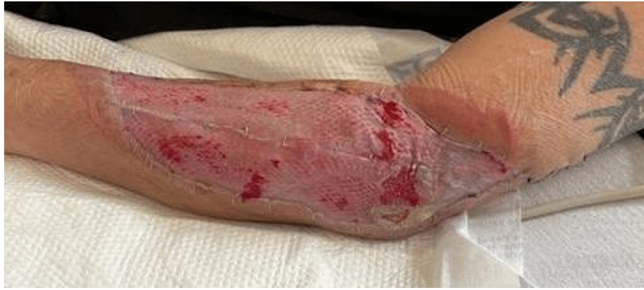
FIGURE 9: Forearm wound 6 days post split-thickness skin grafting.

Follow-up with General Surgery and Infectious Disease was arranged to ensure adequate resolution of the affected left upper extremity; however, the patient was lost to follow-up.