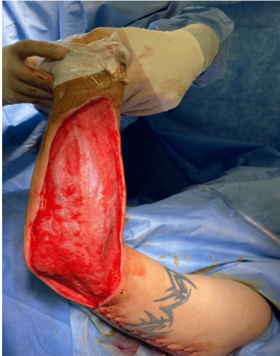
FIGURE 7: Surgical wound after reapproximating upper extremity skin flaps.

A wound vac was replaced over the forearm. Plastic Surgery was consulted regarding wound closure, and skin grafting was recommended. Roughly one week after his most recent takeback surgery, the patient was returned to the operating room for final closure. Epidermis and dermis were harvested from the patient's right thigh, and a split-thickness skin graft was applied to the right forearm and fixed with surgical skin staples (Figure 8).