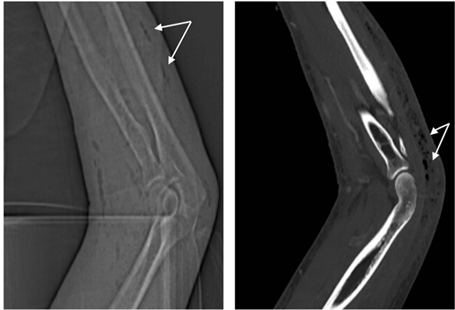
FIGURE 2: Radiographic imaging of the left upper extremity showing subcutaneous emphysema extending from the shoulder to the forearm (arrows) concerning necrotizing fasciitis.

Subsequent cross-sectional imaging of the upper extremity with IV contrast confirmed extensive subcutaneous emphysema/cellulitis and cutaneous emphysema, presumably from a gas-producing organism, as well as a fusiform subfascial abscess at the level of the posterior distal arm and extending proximally to the proximal arm (Figure 3).