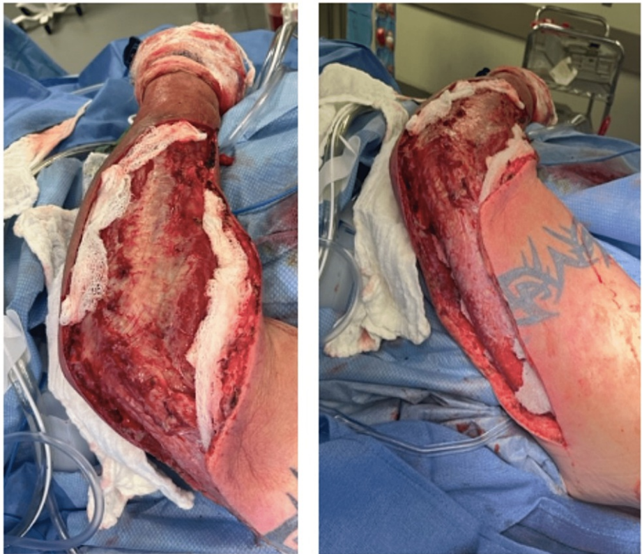
FIGURE 5: Surgical wound during a second intervention, post debridement, and washout.

Cultures from the index procedure grew moderate Streptococcus constellatus and moderate Actinomyces odontolyticus . Cultures from the takeback surgery also grew moderate Streptococcus constellatus ; however, evidence of moderate Gemella morbillorum was also found within this culture specimen. After reevaluation by Infectious Disease, the patient's antibiotic regimen was converted to IV Ampicillin/Sulbactam based on susceptibilities. Daily wet-to-dry dressings were carried out, and appropriate healing was noted. On postoperative day four from the takeback surgery, there was evidence of adequate blood supply within the wound bed and tissue granulation (Figure 6).