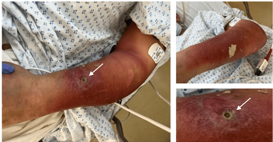
FIGURE 1: Left upper extremity upon initial presentation, with significant cellulitis and draining punctate wound (arrow).

At the initial evaluation, the patient was afebrile and normotensive. Laboratory values were significant for a lactic acid level of 3.0 and a sodium level of 130; however, the CRP was borderline, and the white blood cell count was within normal limits. The patient's LRINEC Score was two, leaving him at low risk for necrotizing fasciitis. However, a slight elevation of the CRP would have increased his score to six, resulting in an intermediate risk for necrotizing fasciitis. Furthermore, clinical suspicion was high based on history, physical exam, and imaging findings (Table 1).