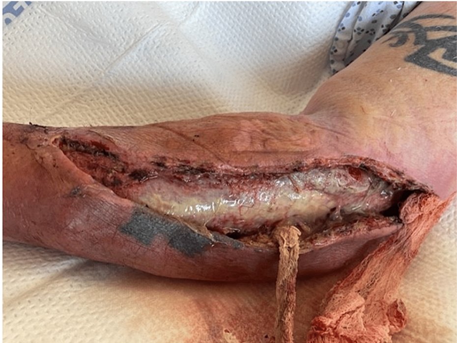
FIGURE 4: Surgical wound on POD1 from index procedure, demonstrating significant purulent drainage with concern for muscle involvement.

shift. The patient complained of significant pain during an exam. The dressing was taken down, and upon removal of the Kerlix packing, there was much foul-smelling, purulent fluid. In addition, the skin of the left forearm appeared to be necrotic, and there was a concern for invasion of infection into the musculature (Figure 4).