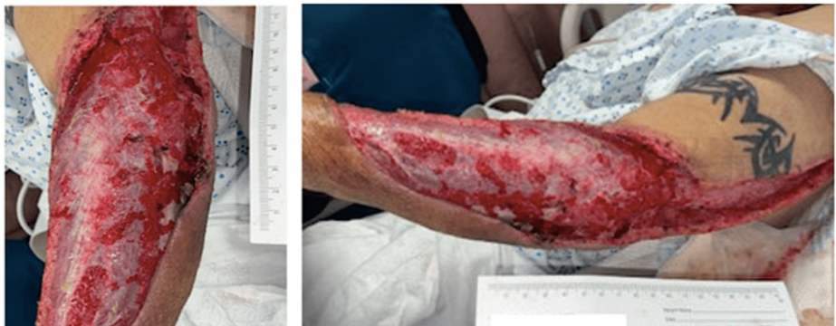
FIGURE 6: Surgical wound on POD5 from the index procedure and POD4 from the takeback.

Cultures from the index procedure grew moderate Streptococcus constellatus and moderate Actinomyces odontolyticus . Cultures from the takeback surgery also grew moderate Streptococcus constellatus ; however, evidence of moderate Gemella morbillorum was also found within this culture specimen. After reevaluation by Infectious Disease, the patient's antibiotic regimen was converted to IV Ampicillin/Sulbactam based on susceptibilities. Daily wet-to-dry dressings were carried out, and appropriate healing was noted. On postoperative day four from the takeback surgery, there was evidence of adequate blood supply within the wound bed and tissue granulation (Figure 6).