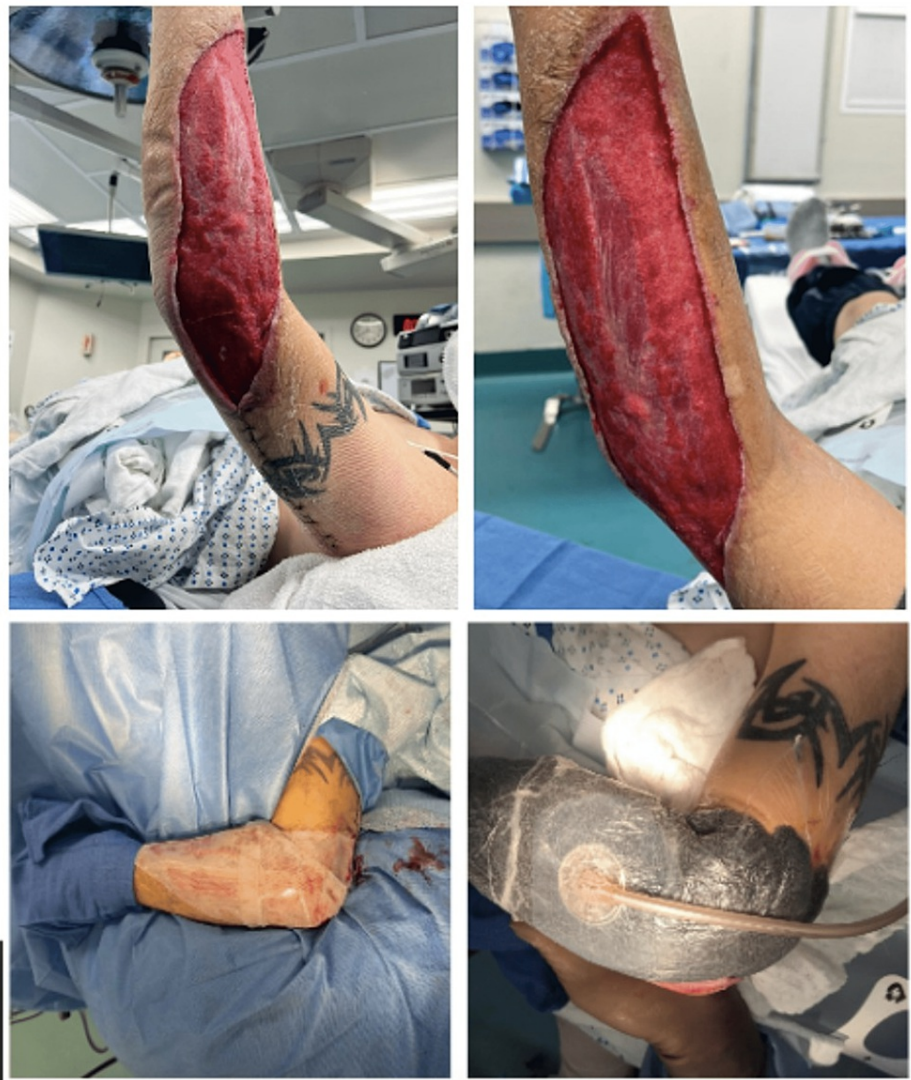
FIGURE 8: Wide forearm wound base (above) pre-skin grafting and (below) post-skin grafting with overlying vac therapy.

Infectious disease followed the patient throughout his hospital course, and he remained on IV ampicillin/sumbactam perioperatively. Per recommendations, the patient will remain on oral amoxicillin/clavulanic acid 875mg twice daily for six to 12 months post-discharge to adequately treat his soft tissue infection. Given his active heroin use upon initial presentation, the patient was discharged to a rehabilitation facility after adequately healing his infected wound (Figure 9).