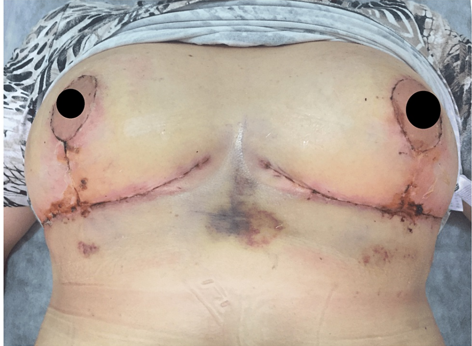
FIGURE 3: Inflammation, edema, and serous discharge observed in and around the incision line

suture line and inverted T incision (Figure 3).