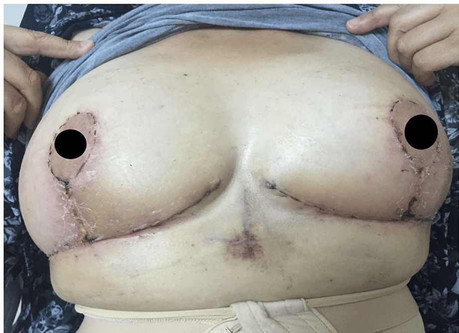
FIGURE 4: Approximately 15 days after surgery, minimal wound dehiscence and small superficial necrotic areas were observed at the lower part of the vertical suture line

The patient was discharged three days after the operation, and daily controls were made. Minimal wound dehiscence developed on the seventh day, and a small superficial necrosis with a diameter of 1 cm developed at the most distal part of the vertical suture on the 15th day (Figure 4).