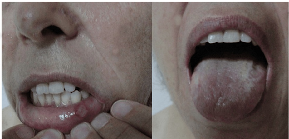
FIGURE 2: Active aphthae were observed on the oral mucosa and tongue of the female patient with Behçet's disease

The patient was taking colchicine and had records of uveitis and oral and genital aphthae (Figure 2). The patient did not have any disease that would adversely affect wound healing, such as diabetes and morbid obesity.