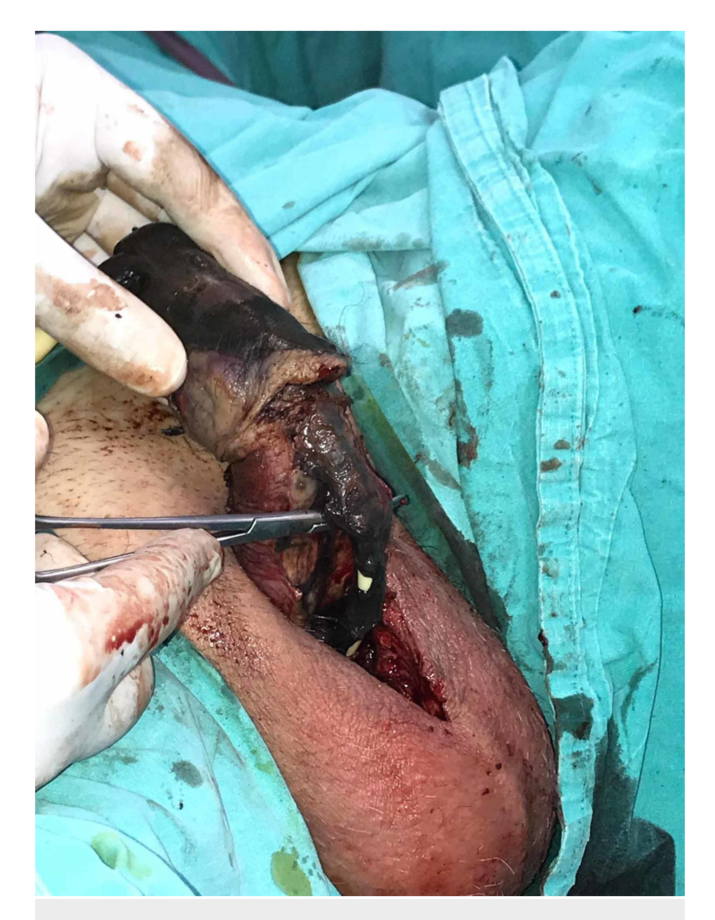
FIGURE 2: Necrosis extended to urethra

Rectoprostatic fascia was mostly necrotic. Rectum mucosa was viable. Scrotum, testicles, and spermatic cords were spared, but the left tunica vaginalis was partially involved. Penectomy, urethrectomy, and debridement of the necrotic tissues were performed. An indwelling cystostomy catheter was placed, and the urine was macroscopically clear without intestinal content, blood, or debris and so we ruled out a fistula. After the surgery, the patient was taken to the intensive care unit, and wide-spectrum antibiotics were started. Penile swab culture resulted in Klebsiella pneumoniae spp, and pathological examination revealed chronic granulation tissue with acute onset and severe necrosis.