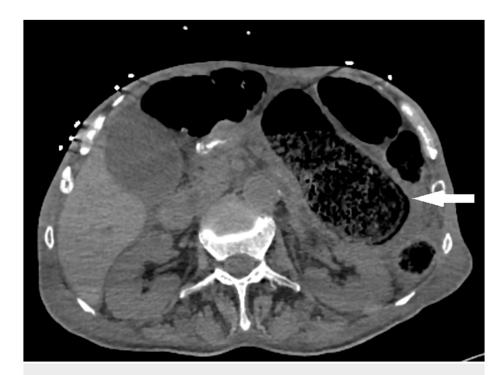
FIGURE 3: Dilated colon in computed tomography

After gaining access to the abdomen, purulent fluid was aspirated from the abdomen without any apparent perforation. Multiple liver metastases and peritoneal implants were seen. The sigmoid colon was seen as dilated and necrotic (Figure 4).