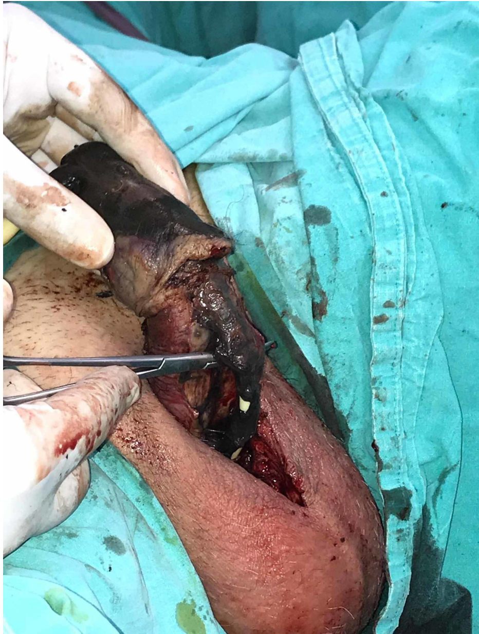
FIGURE 2: Necrosis extended to urethra

Rectoprostatic fascia was mostly necrotic. Rectum mucosa was viable. Scrotum, testicles, and spermatic cords were spared, but the left tunica vaginalis was partially involved. Penectomy, urethrectomy, and debridement of the necrotic tissues were performed. An indwelling cystostomy catheter was placed, and the urine was macroscopically clear without intestinal content, blood, or debris and so we ruled out a fistula. After the surgery, the patient was taken to the intensive care unit, and wide-spectrum antibiotics were started. Penile swab culture resulted in Klebsiella pneumoniae spp, and pathological examination revealed chronic granulation tissue with acute onset and severe necrosis.