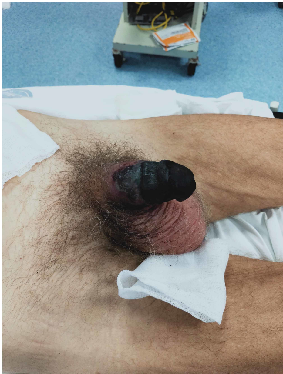
FIGURE 1: Isolated necrosis of the penis

Scrotum and perineum were preserved. The abdominal examination was normal. The anal canal was very hard and tender with palpation, and there was no bloody discharge and abscess formation.