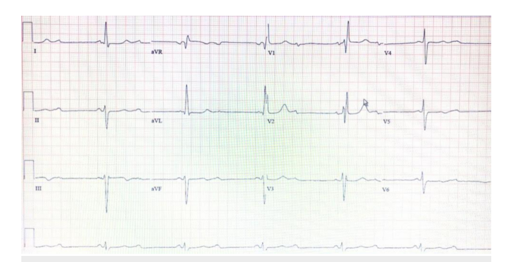
FIGURE 1: ECG depicting a sinus rhythm at 30 bpm with new onset complete heart block, right bundle branch block, left ventricular hypertrophy, left anterior fascicular block, and complete heart block.