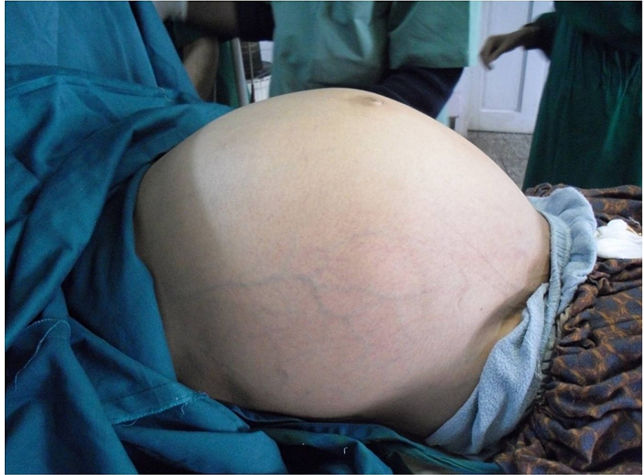
FIGURE 1: Massively distended abdomen (130 cm)

Macroscopic examination revealed a 13 kg specimen (30 cm x 30 cm x 26 cm), however, histopathology was refused by the family who instead requested to take the specimen home to demonstrate as evidence to their family and community members to prove that her abdominal distention was secondary to a tumour and not a foetus (Figures 1-5).