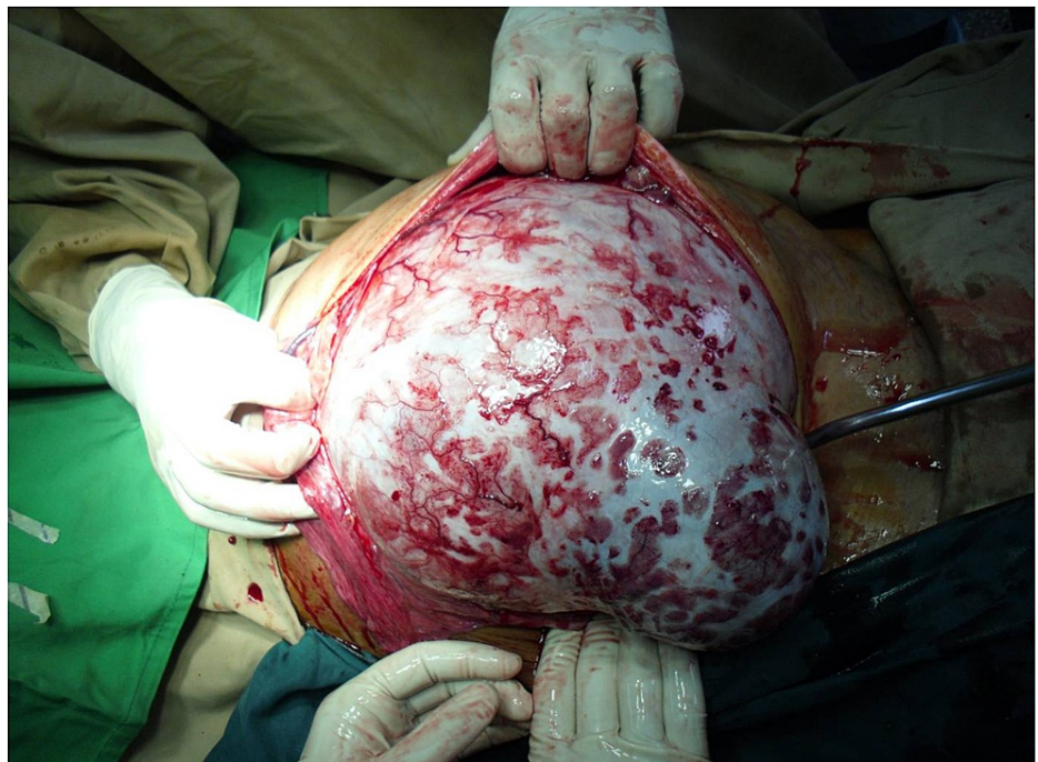
FIGURE 2: Huge mass originating from the right ovary