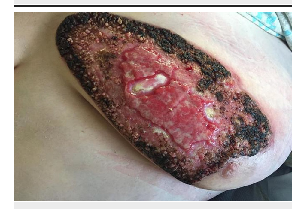
FIGURE 3: Left breast lesion on the day of hospitalization.