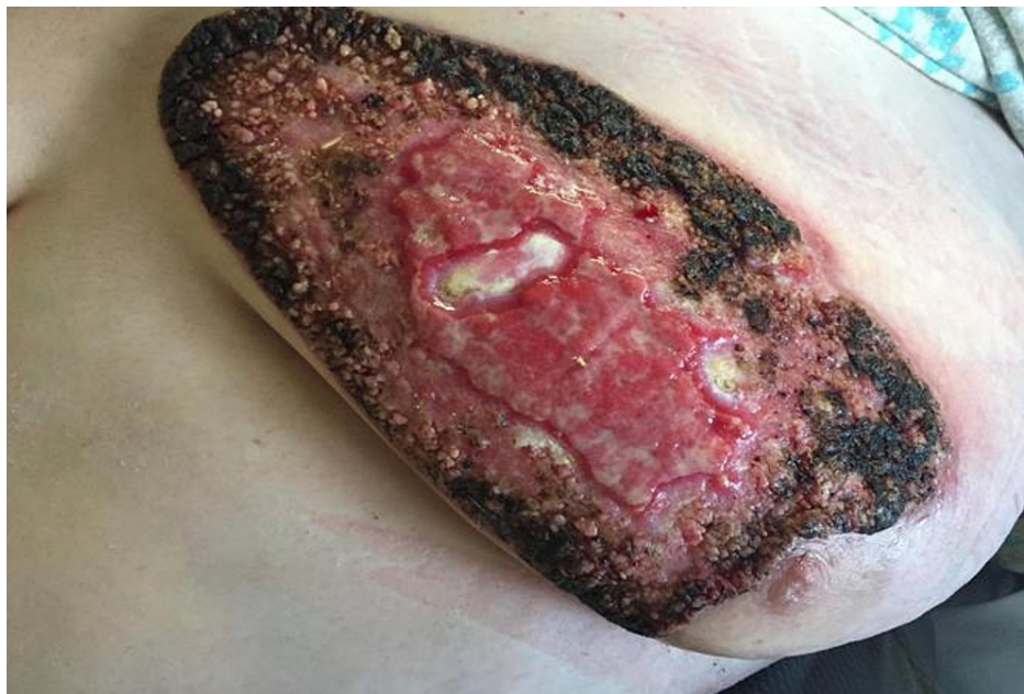
FIGURE 3: Left breast lesion on the day of hospitalization.