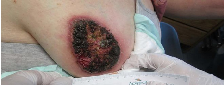
FIGURE 1: Left breast lesion prior to hospitalization.