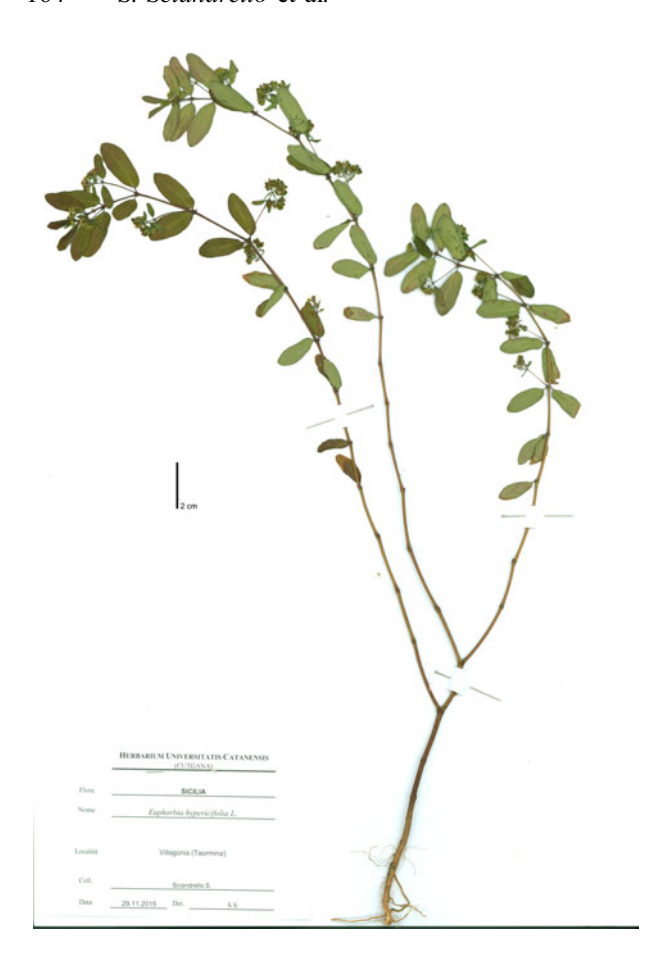
Figure 1. Herbarium specimen of Euphorbia hypericifolia from Villagonia – CAT. Taormina (Messina, Sicily).

to the tropical and subtropical New World (i.e. USA, Mexico, Central and South America). The name has been loosely applied to an aggregate of closely related species with a much wider distribution, such as Euphorbia parviflora , Euphorbia reniformis , Euphorbia braeolaris and Euphorbia indica and now treated as separate species (Raju and Rao 1979).