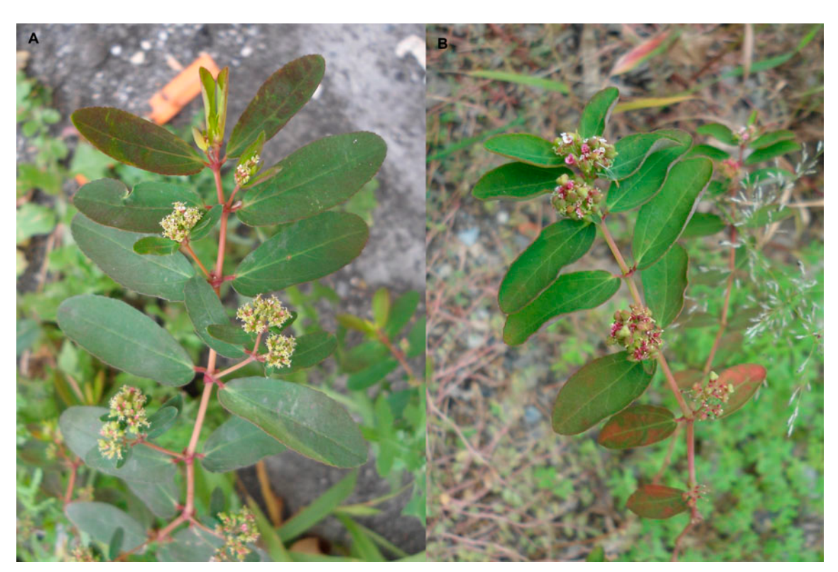
Figure 2. Euphorbia hypericifolia from Villagonia (A) and from the coast facing Isola Bella (B) (Taormina, Messina).

Herbs, annual, glabrous, branched, more or less erect, 15-46(-70) cm tall, apex of branches drooping. Leaves opposite, simple; stipules triangular, 1.5-2.5 \times 1.2-1.8 mm, one pair often fused, hairy at margins; petiole 1-3 mm long; blade elliptical-oblong to oblong, 1.5-3 \times 0.8-1.8 cm, base cuneate, asymmetric, apex obtuse to bluntly acute, margin obscurely toothed. Cyathia axillary, densely clustered into a head 1-1.5 cm in diameter; peduncle 0.5-2 cm long; cyathia almost sessile, c. 1 mm long, with a cup-shaped involucre, lobes