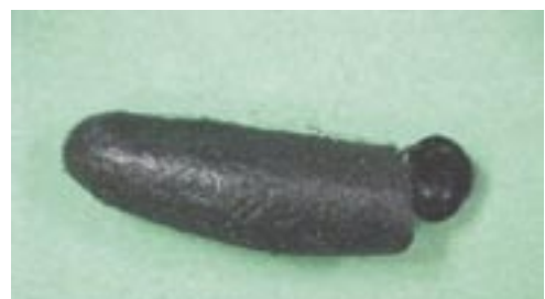
Figure 10. An emerged Netelia pupal case (20 mm). These pupal cases are found in the underground pupal chambers of parasitised helioverpa.