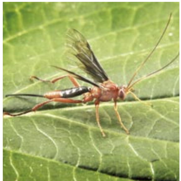
Figure 17. Female Lissopimpla excelsa resting on a leaf. Note the dark coloured wings and long black ovipositor.

Male Lissopimpla excelsa wasps are commonly called the orchid dupe because they are tricked into pollinating orchids. Orchid flowers mimic the odour and appearance of female Lissopimpla wasps. Male Lissopimpla wasps mistake the flowers for females and attempt to mate with the flower, pollinating it in the process (Figure 18).