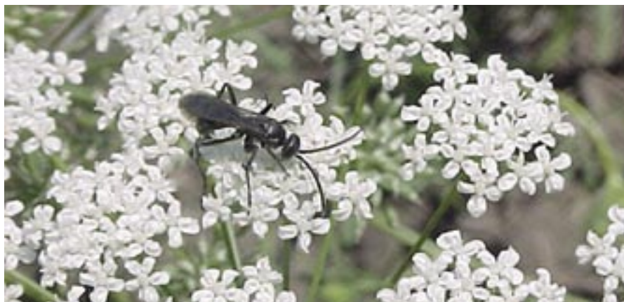
Figure 2. A wasp feeding on nectar. Many parasitoid wasps and flies feed on various sugar sources, including nectar and aphid honeydew.

Some adult parasitoids also ‘host feed’. This involves feeding on fluids that exude from a host’s puncture wound, caused by the wasp’s ovipositor (‘stinger’). Host feeding supplements the nutrition of the adult parasitoid, and odours detected while host feeding may assist the wasp with host searching. Female Trichogramma , Netelia and Ichneumon wasps host feed.