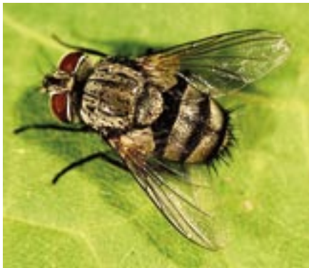
Figure 11 . An adult tachinid fly (10 mm)

Tachinid flies are found in all summer crops and some species are active in winter crops like chickpea, wheat and barley. Most tachinid flies that attack helioverpa are the same size and general appearance as a blowfly (7–10 mm) (Figure 11).