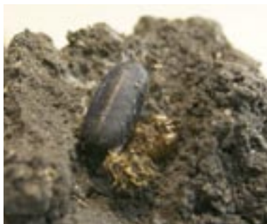
Figure 12. A tachinid pupa lies next to the shrivelled remains of its dead caterpillar host within an excavated helioverpa pupal chamber.