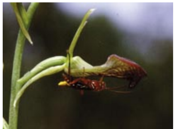
Figure 18. Duped! This male Lissopimpla is attempting to mate with an orchid.