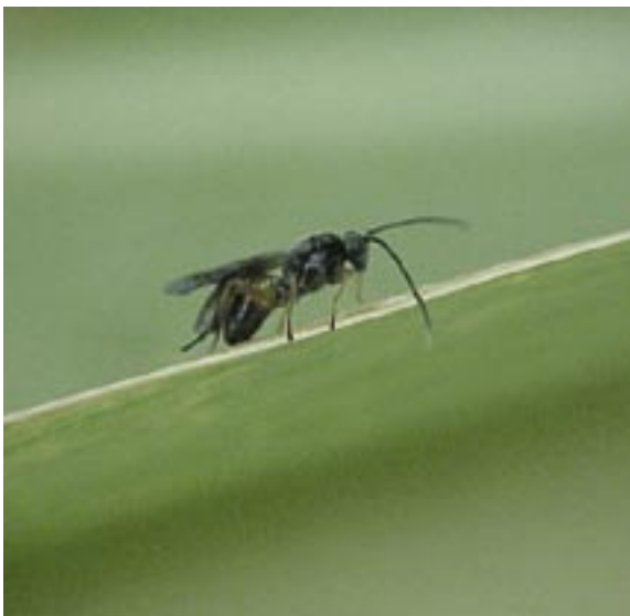
Figure 6. Microplitis adult resting on a sorghum leaf

Female Microplitis wasps sting second instar (4–7 mm) helicoverpa caterpillars. The parasitoid larva then feeds internally and chews a hole in the side of its host to emerge and pupate externally. Host caterpillars are killed before they do much feeding damage. The whole Microplitis lifecycle (egg–adult) takes about 10–12 days.