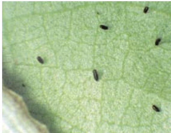
Figure 13 . Tachinid planidia (2 mm) on a leaf waiting to latch onto a host caterpillar

Carcelia illota and Chaetophthalmus dorsalis lay their mature eggs close to where a host caterpillar is feeding. Soon after being laid, the eggs hatch into leech-like larvae (planidia). These larvae remain stationary in an upright position waiting for the caterpillar to pass by (Figure 13). When a larva (planidium) detects movement, it stretches out its body and latches onto the passing caterpillar's body. The planidium then quickly burrows through the skin of the caterpillar and feeds on its host's internal tissues.