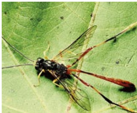
Figure 15. Two-toned caterpillar parasite, Heteropelma scaposum , so-called because of the adult wasp's two-toned body colouring: black in the front (head and thorax) and orange at the back (abdomen)

For more information on helioverpa diapause and the biology of helioverpa, see the DPI&F brochure ' Understanding helioverpa ecology and biology in southern Queensland: Know the enemy to manage it better '.