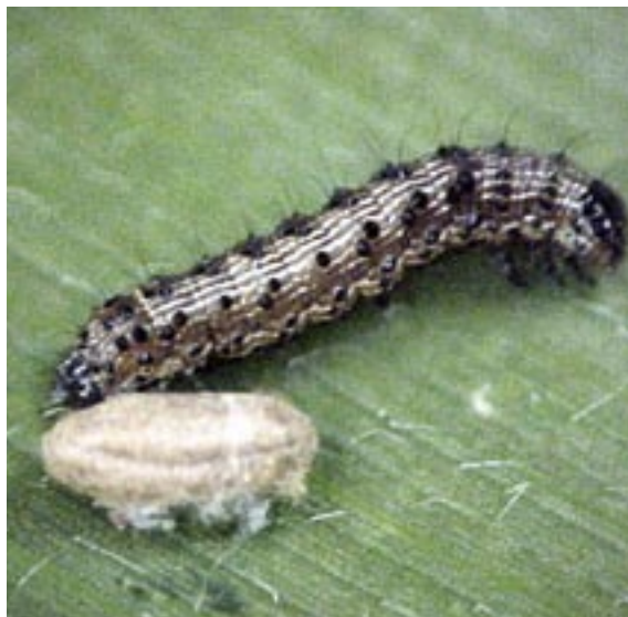
Figure 7. Microplitis cocoon attached to its host