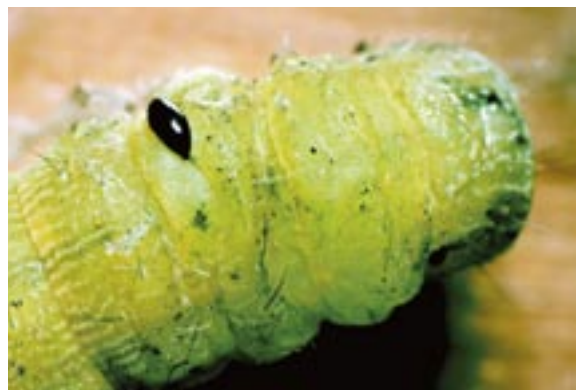
Figure 9. Netelia eggs are laid close to the head of the host caterpillar.