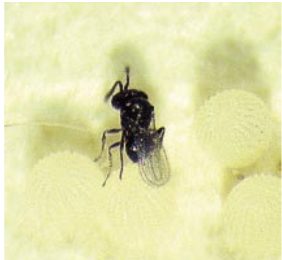
Figure 5. The small egg parasitoid Telenomus .

The Telenomus wasp is black with black eyes (Figure 5). Numbers are most abundant in spring and early summer.