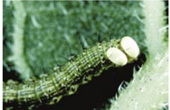
Figure 14. Tachinid eggs (2 mm) on the head of a heliCOVERPA caterpillar

The tachinid fly Exorista curriei lays eggs (measuring 2 mm each) directly onto the host caterpillar, usually on or just behind the head (Figure 14). The eggs are glued onto the host and do not readily dislodge. When the egg hatches, the larva burrows through the skin of the host and feeds internally.