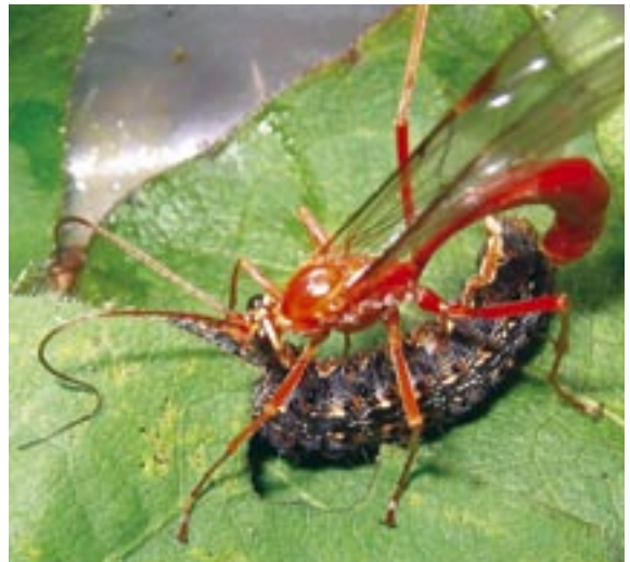
Figure 8. Adult Netelia wasp parasitising a paralysed helioverpa larva

The immature Netelia larva hatches from the egg and develops externally, hanging on behind the head of the caterpillar. The parasitoid does not complete its larval development until the helioverpa caterpillar has tunnelled into the soil and formed its pupation chamber. After the host forms its chamber, parasitoid feeding kills the host and the Netelia larva spins a black furry cocoon within this chamber (Figure 10).