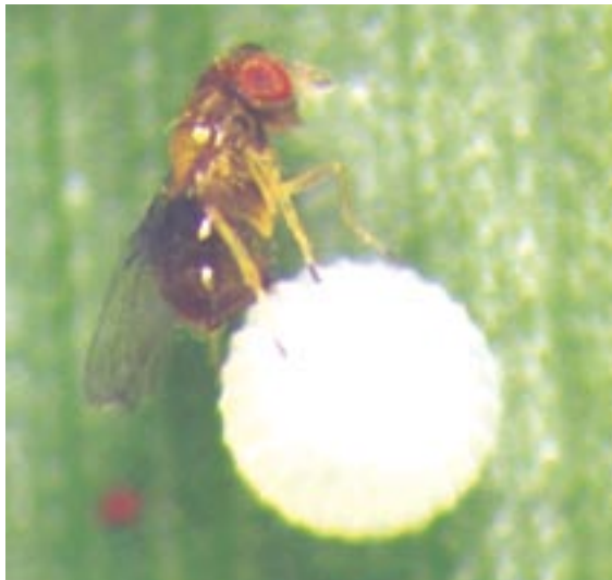
Figure 4. Female Trichogramma wasp stinging a Helicoverpa egg. Helicoverpa eggs measure about 0.5 mm across but Trichogramma adult females are even smaller.

The Trichogramma wasp is yellow - brown with red eyes (Figure 4). Numbers increase from low densities in spring to become very abundant in late summer.