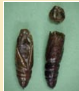
Figure 16. A helioverpa pupal case after the moth has emerged (left); a pupal case after the parasitoid Heteropelma scaposum has emerged (right).

Parasitised host pupae become stiff, while healthy helioverpa pupae wiggle their abdomens freely. Use this information to identify parasitised pupae during pupae sampling. Adult wasps emerge from host pupal cases by chewing the head end off the case. This feature distinguishes parasitised pupal cases from pupal cases from which moths have emerged. Heteropelma scaposum , Ichneumon promissorius and Lissopimpla excelsa wasps emerge in this way.