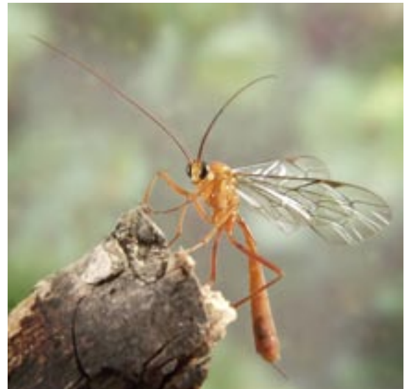
Figure 1. Netelia producta is one of the most commonly encountered parasitoids of heliothis. Females lay their eggs onto caterpillars, and the hatching wasp larva feeds on its host, eventually killing it. Parasitoids such as Netelia can be important biological control agents of heliothis in crops.

Parasitoids kill their hosts; parasites (such as lice and fleas) do not. All the insects in this brochure are parasitoids. Despite this difference, the terms parasitoid and parasite are often used interchangeably, if inaccurately.