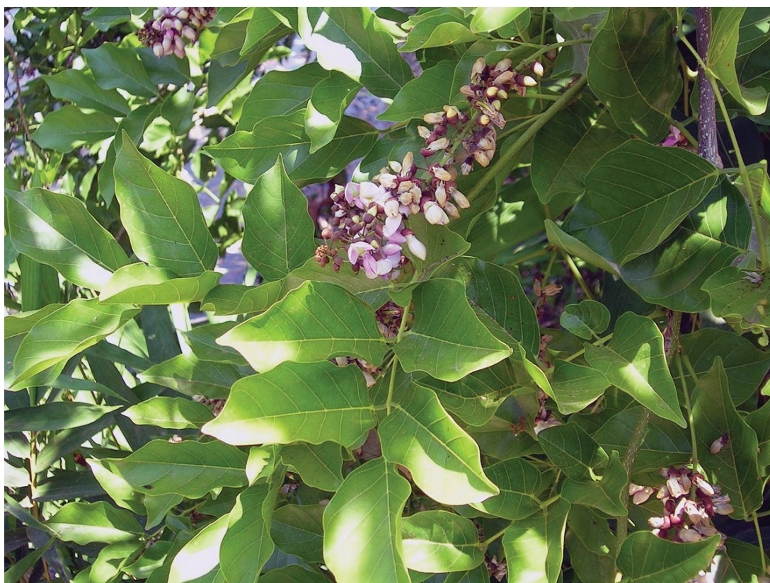
Figure 1. A flowering shoot of Millettia pinnata (Source: Derrispinnata.jpeg; Author: L. Shyamal (2007), licensed under a GNU Free Documentation License, Version 1.2).

The branchlets are hairless with pale stipule scars evident. The leaves are arranged alternately along the stems. Each leaf is composed of 5–9 leaflets with the terminal leaflet being largest. The leaves are hairless, pinkish-red when young, darkening to a glossy green above and a dull green with prominent veins below as they mature. The leaflets are ovate elliptical or oblong (5–25 cm x 2.5–15 cm), obtuse-acuminate at the apex, rounded to cuneate at the base, not toothed at the edges and slightly thickened. Stipules are caducous.