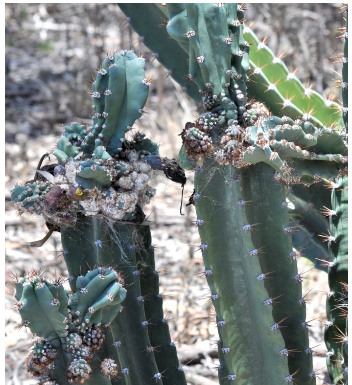
Biological control damage from mealy bug insect