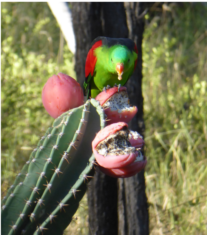
Bird eating willow cactus fruit

Note: Refer to the permits for more herbicide options. Read the label carefully before use and always use the herbicide in accordance with the directions on the label.