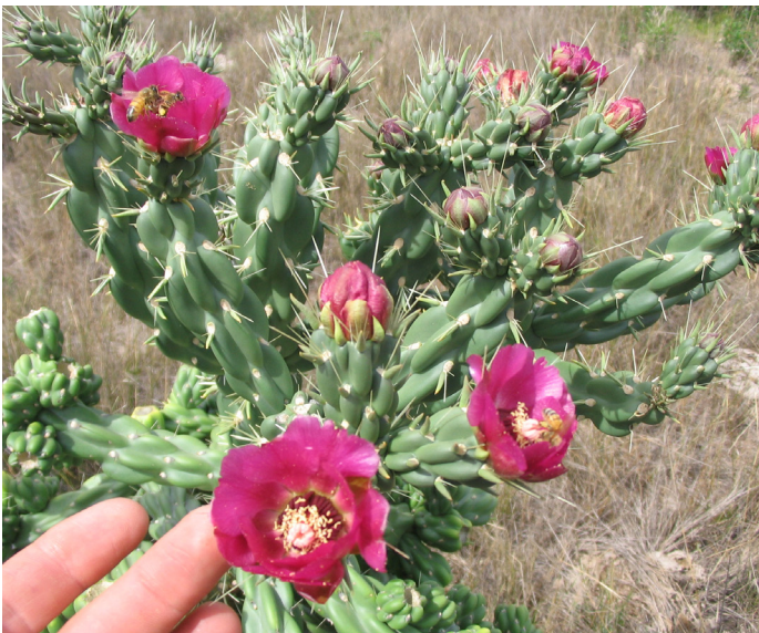
Devil's rope pear ( Cylindropuntia imbricata )