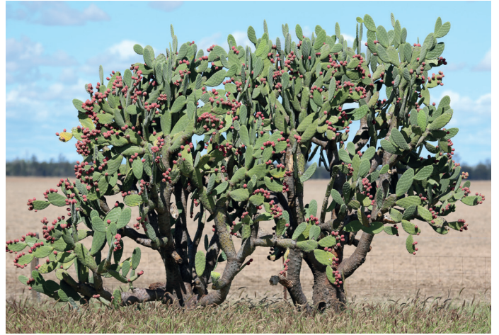
Velvety tree pear ( Opuntia tomentosa )