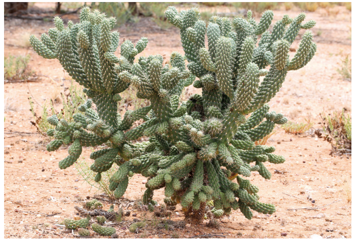
Coral cactus ( Cylindropuntia fulgida )