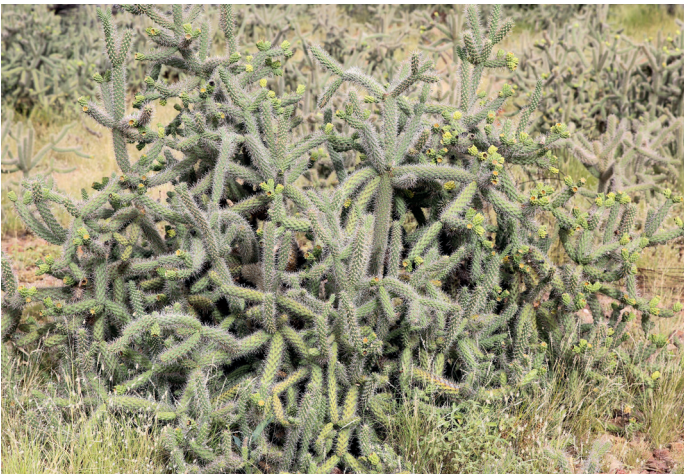
Snake cactus ( Cylindropuntia spinosior )