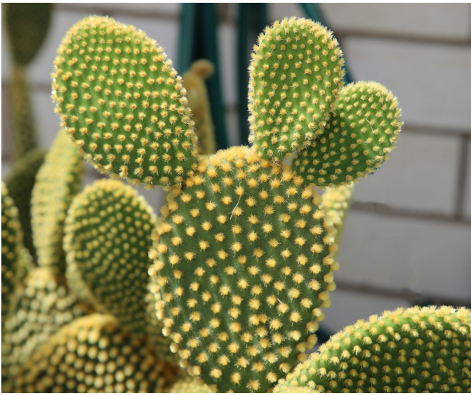
Bunny ears ( Opuntia microdasys )