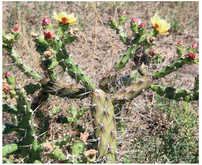
Tiger pear ( Opuntia aurantiaca )