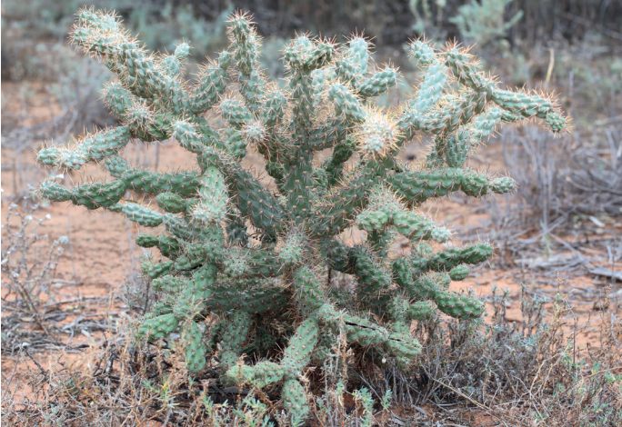
Jumping cholla ( Cylindropuntia prolifera )