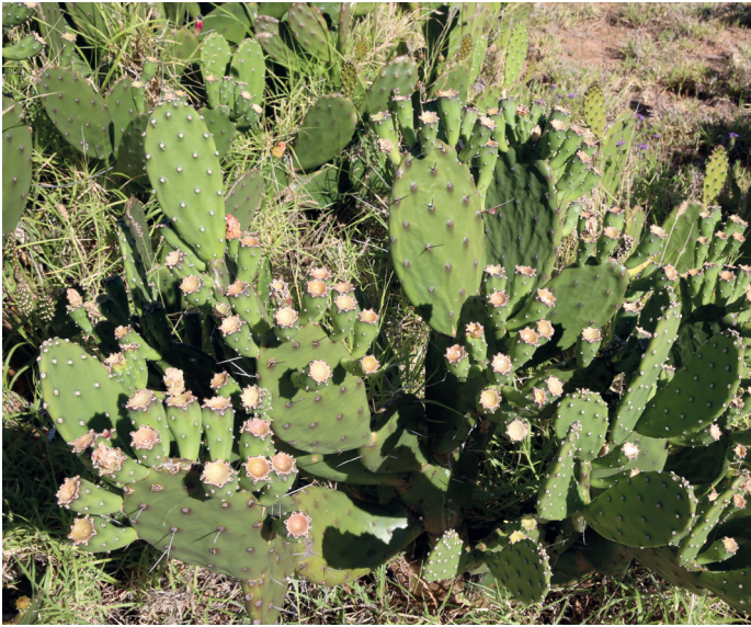
Riverina pear ( Opuntia elata )