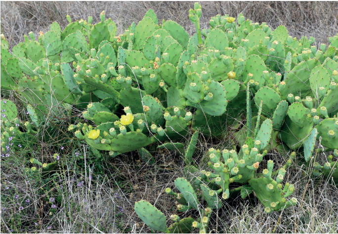
Common pest pear ( Opuntia stricta )