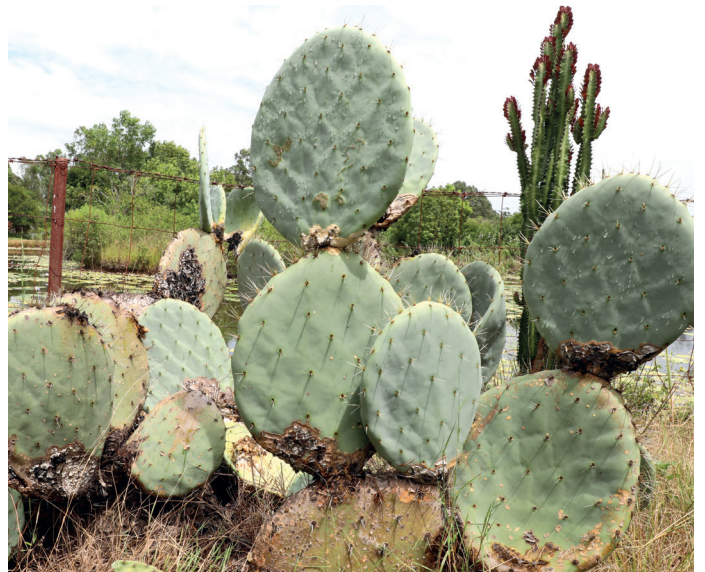
Wheel cactus ( Opuntia robusta )

Fact sheets are available from biosecurity.qld.gov.au . The control methods recommended should be used in accordance with the restrictions (federal and state legislation, and local government laws) directly or indirectly related to each control method. These restrictions may prevent the use of one or more of the methods referred to, depending on individual circumstances. While every care is taken to ensure the accuracy of this information, the department does not invite reliance upon it, nor accept responsibility for any loss or damage caused by actions based on it.