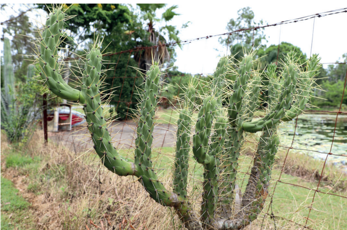
Eve's pin cactus ( Austrocyllindropuntia subulata )