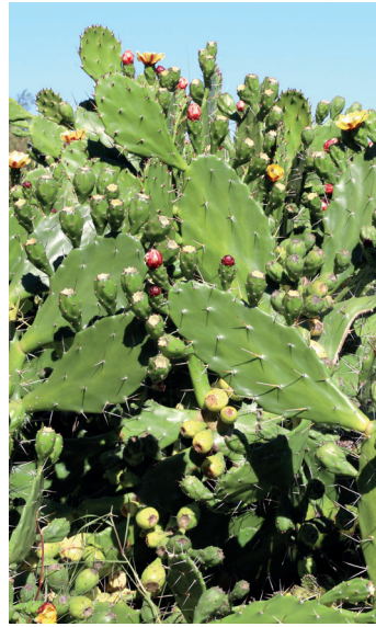
Drooping tree pear ( Opuntia monacantha )