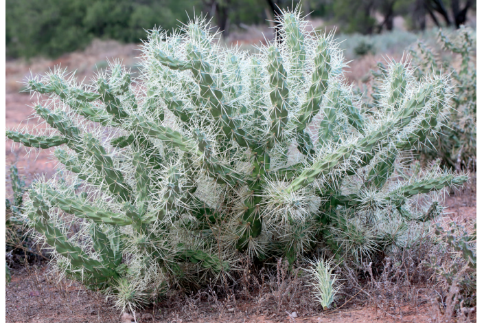
Hudson pear ( Cylindropuntia pallida )