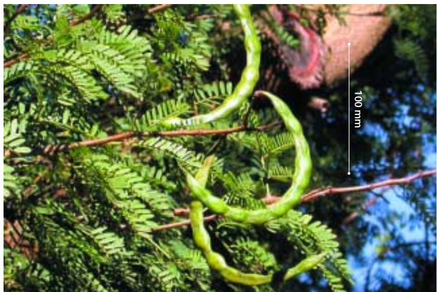
Curved sickle-shaped seed pods are a distinctive feature of Karroo thorn.

If left unchecked, Karroo thorn would damage Australia's environment and economy