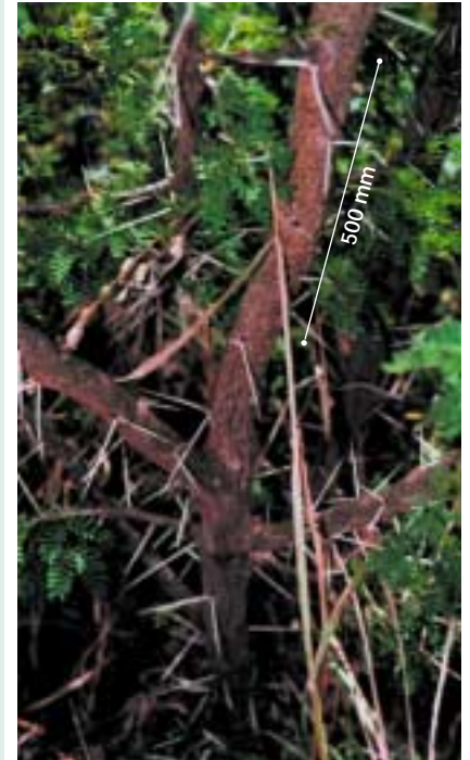
The spines are longer, stronger and more numerous at the base of the tree.