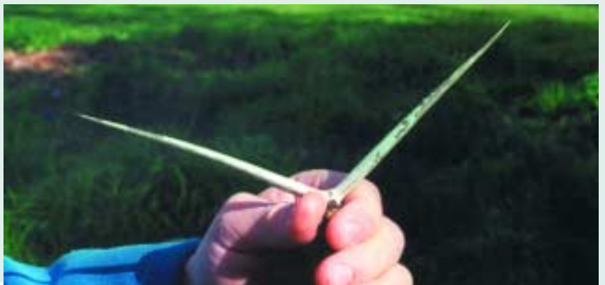
Large thorns up to 250 mm protect the leaves from browsing animals.

Other parks, zoos and councils have also sought to remove their specimens. Karroo thorn plants have recently been removed from Kings Park in Perth, Western Australia, Stockton in New South Wales, and the Werribee Open Range Zoo and Melbourne Zoo in Victoria. Other sites are preparing similar removals.