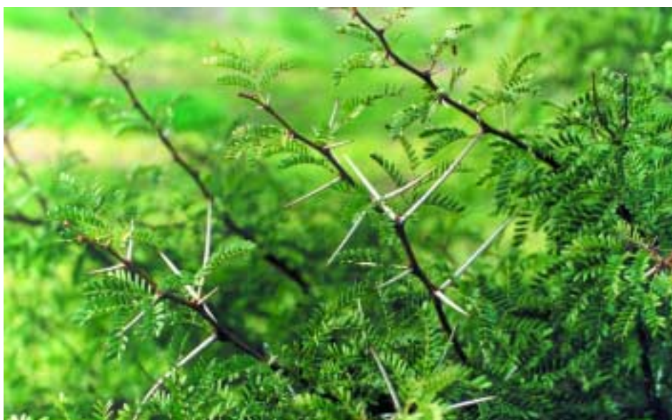
Karoo thorn has been planted in the African exhibits of Australian zoos and botanical gardens.

Karoo thorn is a shrub or tree which grows up to 12 m high. It has paired thorns, usually up to 100 mm long although occasionally as long as 250 mm,