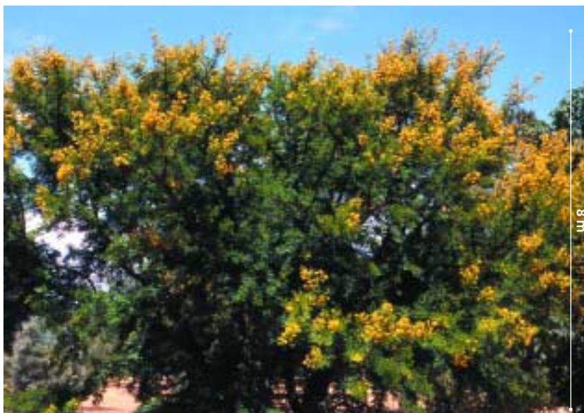
The yellow fluffy ball-shaped flowers are prominent during summer.

The exact origin of the plantings of Karroo thorn in Australia is unknown. It was first recorded in metropolitan Perth in the early 1960s and may have spread from a residential planting or the Botanic Gardens. Karroo thorn is well suited to much of Australia's rangelands. It has been widely planted throughout botanic gardens and zoos in South Australia, Victoria and New South Wales as it is particularly evocative of the African landscape and is said to be the favourite food of the black rhinoceros.