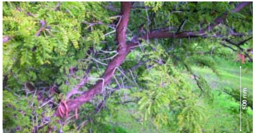
Karroo thorn is considered a weed throughout much of South Africa because it invades grasslands and rangelands.

( Acacia catechu ), another Alert List species which is currently being eradicated from small infestations in Darwin, Northern Territory. Similar to Karroo thorn, a major weed of Northern Territory wetlands, the Weed of National Significance mimosa ( Mimosa pigra ) was also originally planted in a botanic garden. Efforts to control the spread and impact of mimosa by chemical, mechanical and biological means have cost millions of dollars.