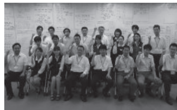
HVAC Tohoku members