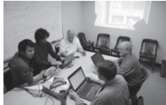
Fostering "bridge persons," people who link the Head Office with local workplaces