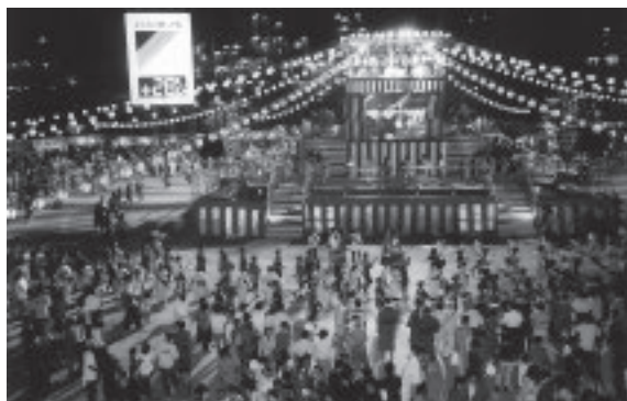
Bon Dance Festival at the Yodogawa Plant (2014)

The training camp that Inoue started later also welcomed new employees from other factories and branch offices. That same camp