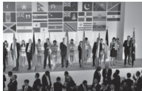
Celebration of Daikin's 90th anniversary (2014)