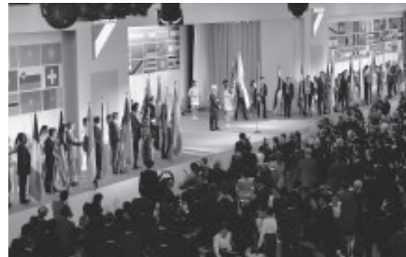
Stage at the celebration for the 90th anniversary (2014)