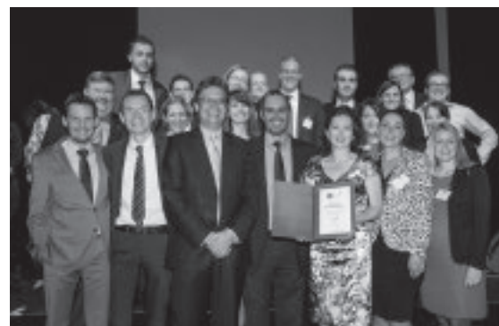
Award ceremony for the Great Place to Work (2013)

Nonetheless, employees of the acquired companies must have had initial reservations about Daikin, particularly concerning People-Centered Management, and they must have had some anxieties toward a Japanese multinational company exhibiting such sudden