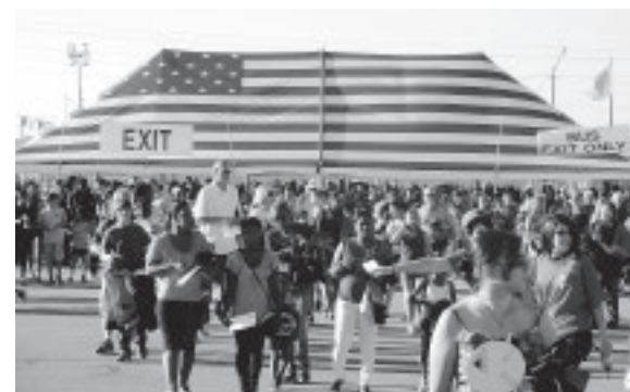
Bon Dance Festival at the Decatur Factory

The Daikin Festival is accepted as the biggest event in the community and attendance has steadily grown each year. In May 2014 at the 20th anniversary of the event, two former U.S. Air Force pilots parachuted down to the grounds while waving the Daikin flag to the