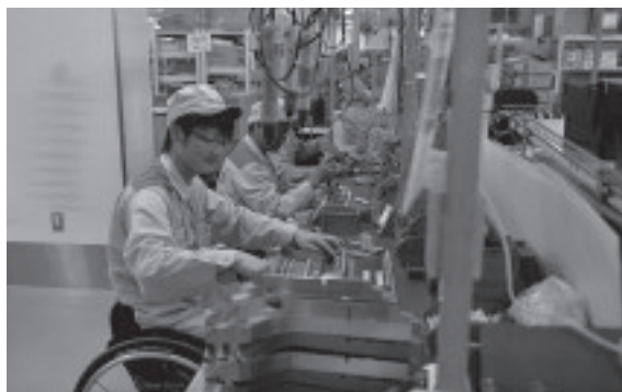
Inside the Daikin Sunrise Settsu Factory