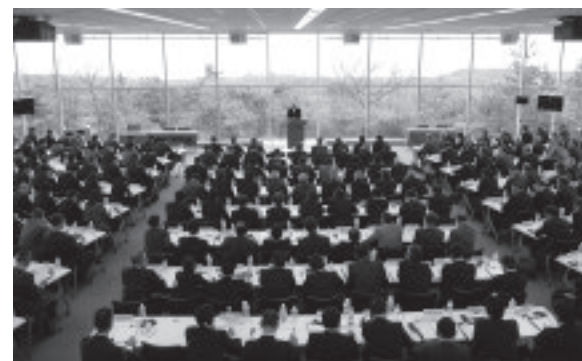
Fifth Global Management Meeting in 2014