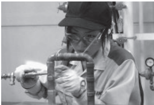
Daikin Global Skills Competition (brazing)