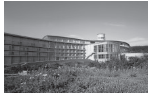
Daikin Ales Aoya