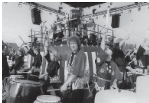
Bon Dance Festival at the Ostend Factory