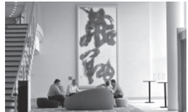
Private Meeting by Global Managers