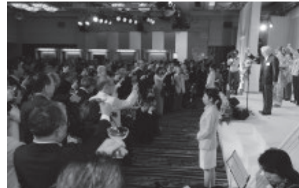
Opening the tournament-eve reception at Daikin Orchid