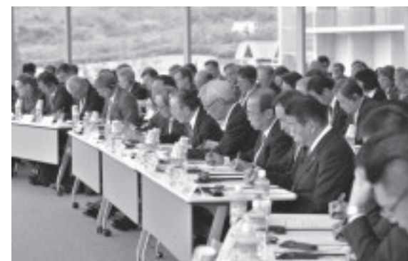
Group Management Meeting held at Daikin Ales Aoya (2014)