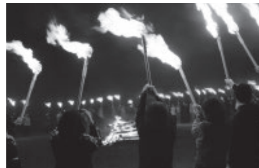
Lighting the way for new employees at Daikin Ales Aoya

With the Sea of Japan stretching before it, Daikin Ales Aoya offers an unrestricted view of the horizon. As evening approaches, fish lamps on squid-fishing vessels light up one by one off the coast. On one such Saturday evening in April, a massive campfire roared on a dark sandy beach and over 100 young people danced in a circle around it. Several bonfires burned nearby. The man adding wood to the bonfires was Togawa, president of Daikin Industries. Chairman