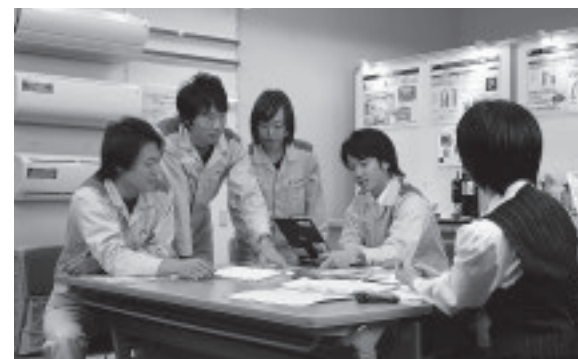
Development meeting for “Urusara 7”