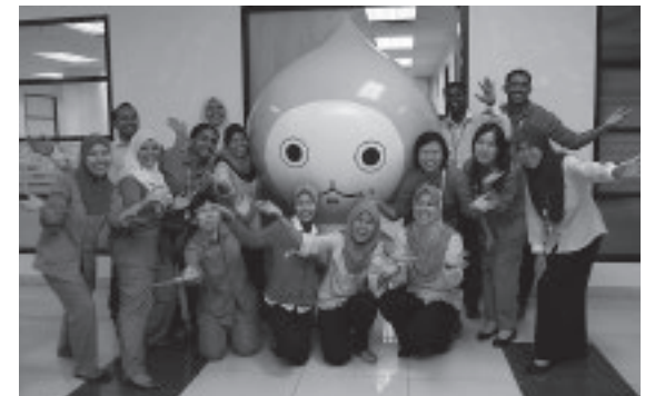
Employees at O.Y.L. Manufacturing posing with PICHONKUN