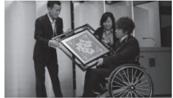
Daikin Air-conditioning (Shanghai) celebrates 20th anniversary of Daikin Sunrise Settsu

Not only in Japan, but overseas companies of the Daikin Group also promote employment of the disabled, and in 2006 Daikin