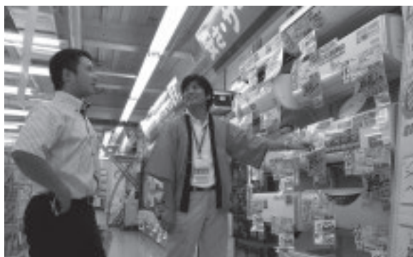
Sales promotion at a consumer electronics store