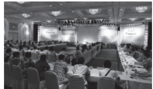
Joint meeting of Daikin and O.Y.L. held in Honolulu, Hawaii