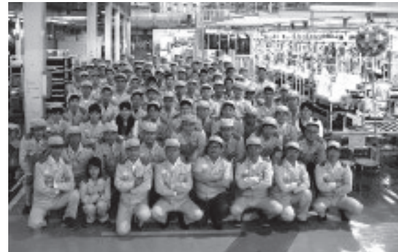
Commemorative photo celebrating the completion of "Urusara 7"