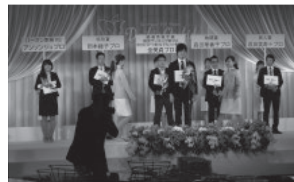
Rehearsal for the tournament-eve reception

The tournament-eve reception annually welcomes guests on a scale of approximately 530 people (for the 26th Daikin Orchid) that include the 160 people participating in the pro-am tournament along with the officers of RBC, the 80 spouses of the attending guests, the 108 professional female golfers participating in the tournament, the 140 invitees of the RBC and Daikin HVAC Solution Okinawa, and the 40 tournament officers and related personnel. Without careful preparations and attention to details, the event could not succeed. Every year in July, 40 planning members are selected to make preparations for the following year. In addition to the General Affairs Department acting as the secretariat, there are people in charge of the Daikin Orchid tournament-eve reception, the pro-am tournament, the ladies golf tournament, the commemorative gifts given to guests and their accompanying spouses, and the Daikin sightseeing guide highlighting the unique appeal of Okinawa. For the day of the big event, there are people in charge of guest arrivals and departures on the day of the tournament, people in charge of hotels who organize