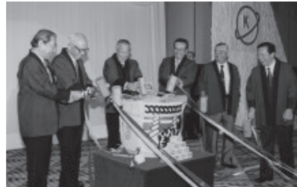
Celebration of Daikin's 70th anniversary (1994)