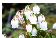
C. selaginoides 'Blühwunder'