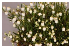
C. mertensiana subsp. gracilis