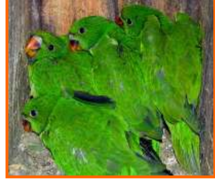
1+1+1+1=4 Echo Parakeet chicks

Despite the uncertainties about the future of the birds in view of PBFD, 2006/07 was a highly successful season. The best ever in fact, in terms of the number of chicks fledging in the wild! 72 chicks in total! It was a season of "firsts" also, for the first time in the history of the Echo programme, 8 females managed to fledge 3 chicks each. In the past they mostly have only fledged one or two chicks. We also had four healthy chicks fledge from one nest. This caused much excitement as it probably the first time this has occurred for hundreds of years. The Echo Parakeet population is currently estimated at 343 birds in the wild.