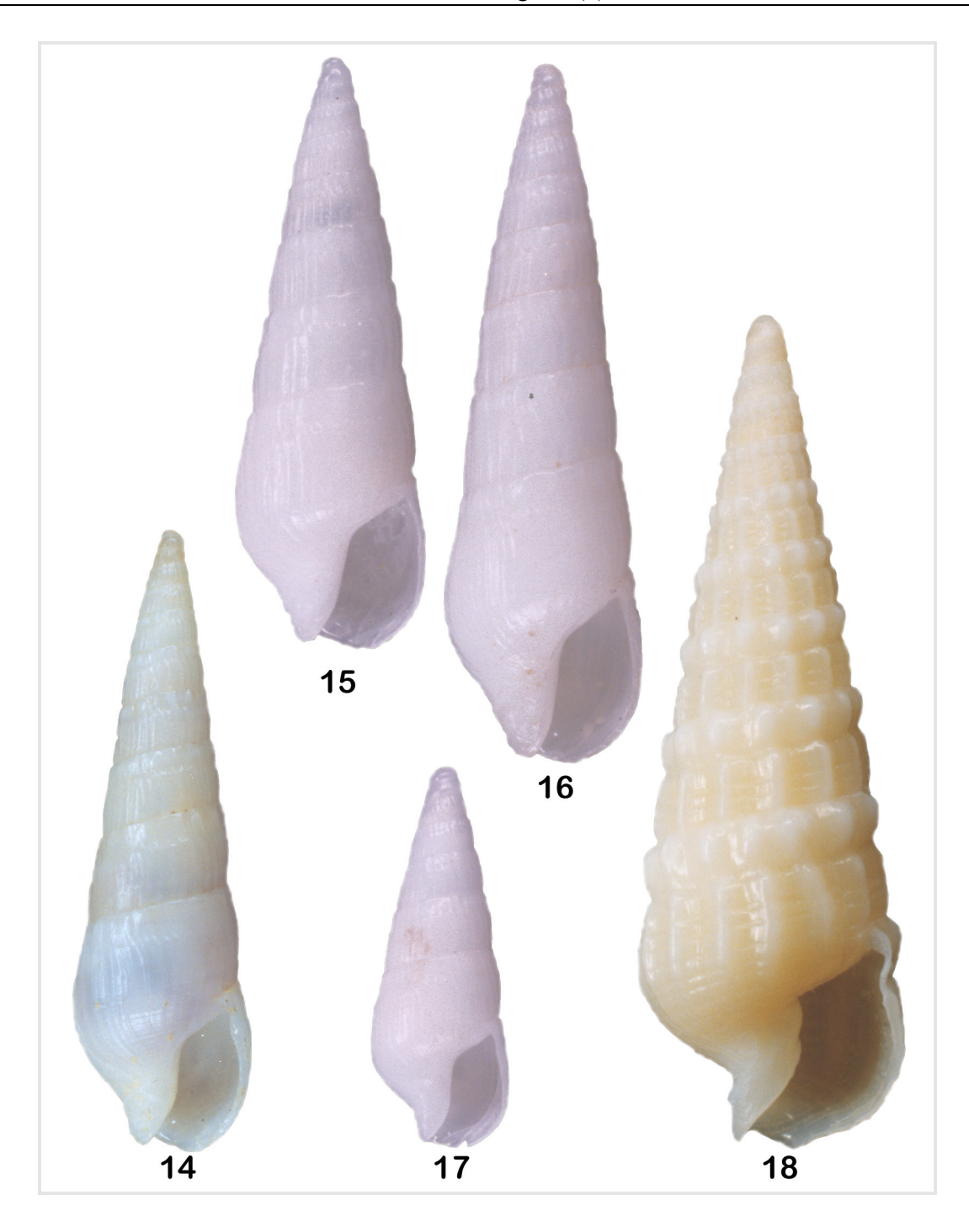
Figs 14-18 . Terebridae. 14. T. incisa n. sp.; Aruba, north coast, beach (FV); paratype, adult; 15 mm; 6.5x [same specimen figured in J&C, pl. 43 fig. 574]; 15. Terebra incisa n. sp.; Aruba, sand dredgings (FV); paratype 1, subadult, ventral; 10.5 mm; 8.9x; 16. T. incisa nov spec.; Aruba, sand dredgings (FV); holotype, subadult, ventral; 12.3 mm; 8.9x; 17. T. incisa n. sp.; Aruba, sand dredgings (FV); paratype 2, juvenile, ventral; 6.7 mm; 8.9x; 18. Terebra dislocata (Say, 1822); Bahamas, Abaco, Boat Harbour, beach (MF; Fab 98/10); subadult, ventral; 14.4 mm; 9.0x.