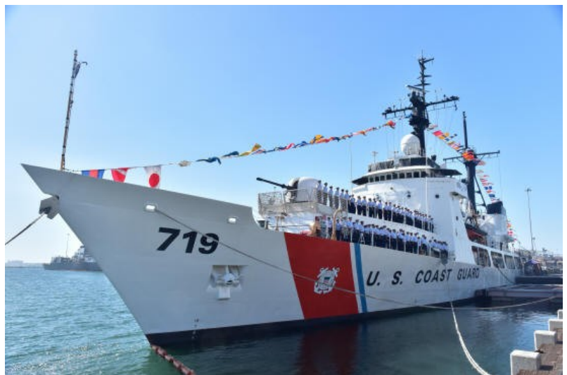
The crew of the 378-foot USCGC BOUTWELL mans the rails for the last time during the decommissioning of the ship at Naval Base San Diego, March 16, 2016.

Furthermore, CGC BOUTWELL made port in Libya, a first for a U.S. Naval warship in over 40 years.