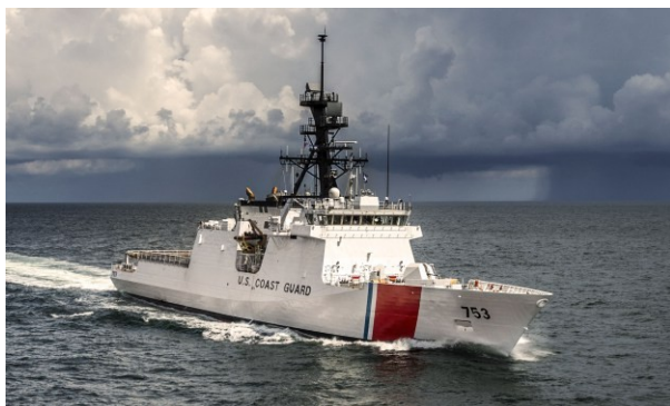
Photo of USCGC HAMILTON

Hamilton assigned revenue cutters to the East Coast's ten major seaports, allowing for import tariff collection, critically important to the economic viability of the nation. In addition to their law enforcement role, the fleet of cutters rendered aid and assistance as needed "for the protection of lives and property at sea," a humanitarian life-saving role that defines the Coast Guard to this day.