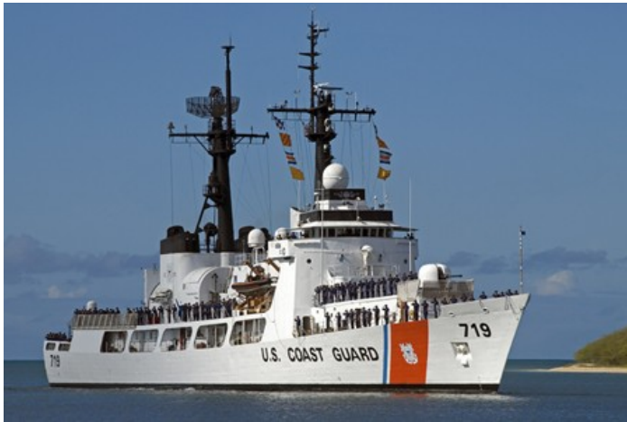
USCGC BOUTWELL

homeport once again to Alameda, CA in October, 1990. Finally in 2011, following the decommissioning of CGC HAMILTON, the CGC HAMILTON crew relieved BOUTWELL's crew and changed homeport to San Diego, CA.