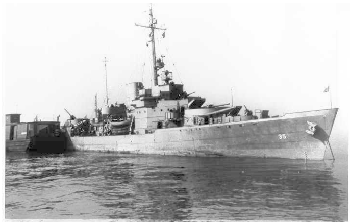
F64406169 NAVY YARD, NEW YORK MAY 28, 1944 U.S.C.G.C. W 35.