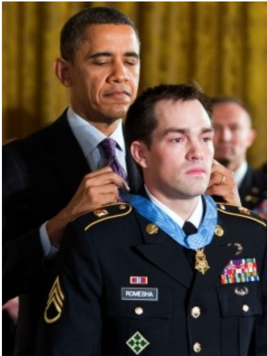
President Barack Obama presents the Medal of Honor to former Army Staff Sergeant Clinton Romesha on Feb 11, 2013 at the White House.

Red Platoon is a first-hand account of the Battle of Keating (also known as the Battle of Kamdesh) as told by Clinton Romesha. In 2009, Romesha of Red Platoon and others from Black Knight Troop were in the process of closing Command Outpost (COP) Keating, a remote outpost (built by the U.S. military in Kamdesh District, Nuristan Province) designed to prevent the Taliban and their allies from moving back and forth between Afghanistan and Pakistan. Deemed too isolated to defend, the U.S. Army decided to end its three-year occupation of the area.