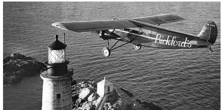
A Flying Santa Tri-Motor delivers a parcel to Graves Light off Boston