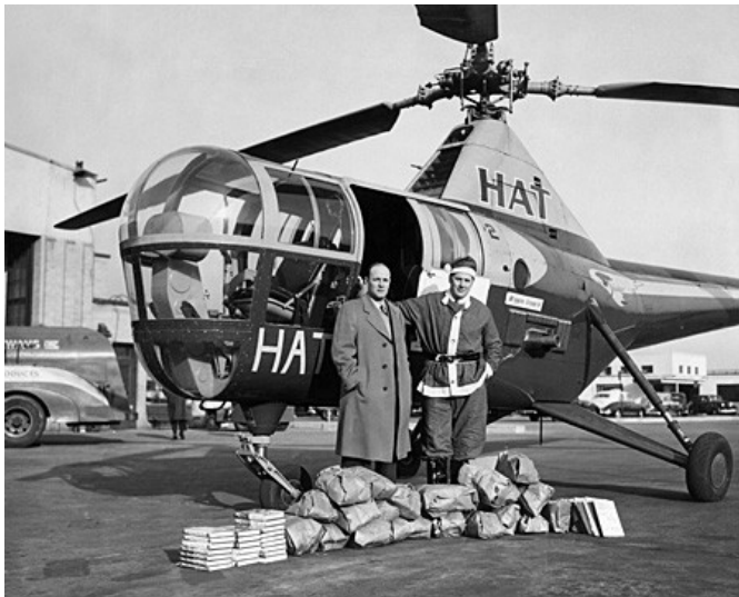
In 1946, the Flying Santa used a Sikorsky S-51 for deliveries. It was the first used of a helicopter for Christmas deliveries.