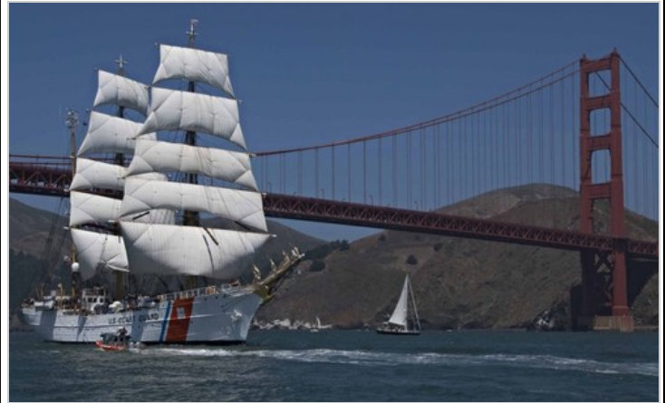
(USCGC EAGLE)