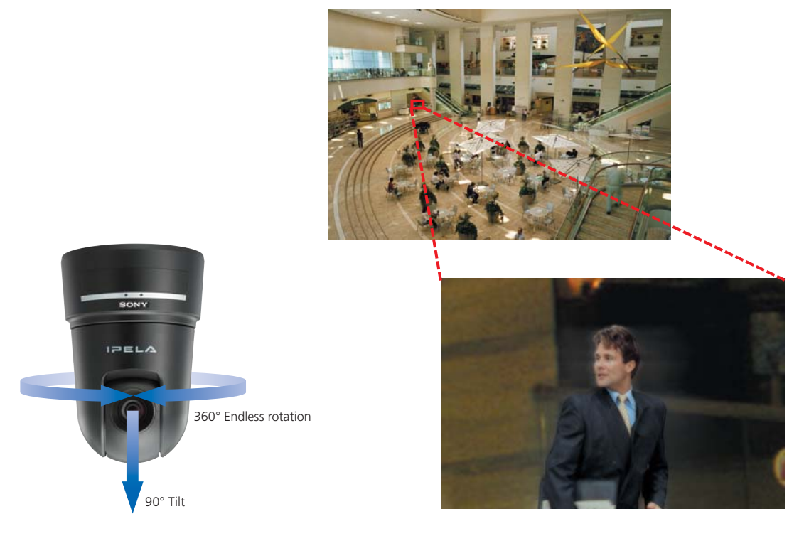
Fig. 1 Pan/Tilt Range

The SNC-RX550 supports a maximum frame rate of 30 fps when the image size is VGA (640 x 480) in both MPEG-4 and JPEG modes, producing clear and smooth-moving images. The frame rate can be set to meet your network environment and system requirements.