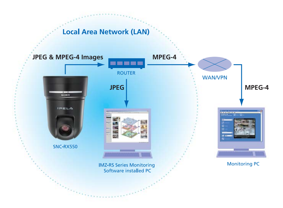
Fig. 3 Dual Image Encoding

*6 This function is available only with recording software that complies with the Sony digital signature scheme. For more details, please consult your nearest Sony dealer.