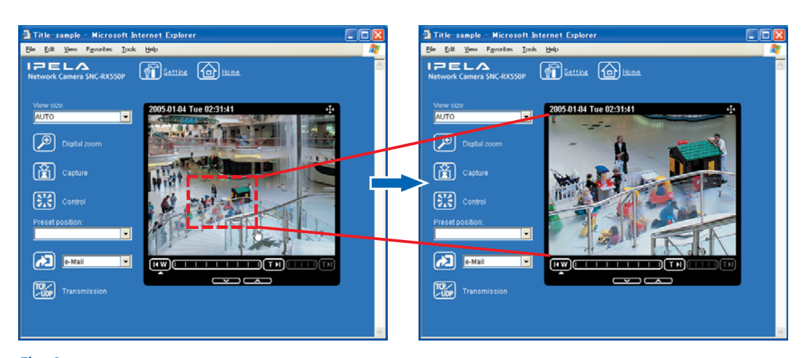
Fig. 4 Intuitive GUI Operation

The SNC-RX550 can interface with external control equipment using the Sony VISCA protocol. This configuration allows for local control of Pan/Tilt/Zoom and for camera settings.