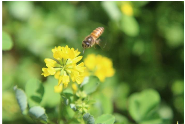
The flowers of fenugreek are fertilized by bees, bumblebees or butterflies.

Fenugreek is characterised by its peculiar, sweetishly spicy smell. This coumarin-like smell even intensifies with drying. When the seeds germinate, the smell is more reminiscent of celery - the seedlings also taste bitter and are slimy when chewed.