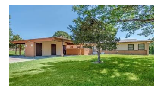
Fort Carson, CO - Constructed 1970