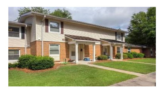
Fort Jackson, SC - Constructed 1972