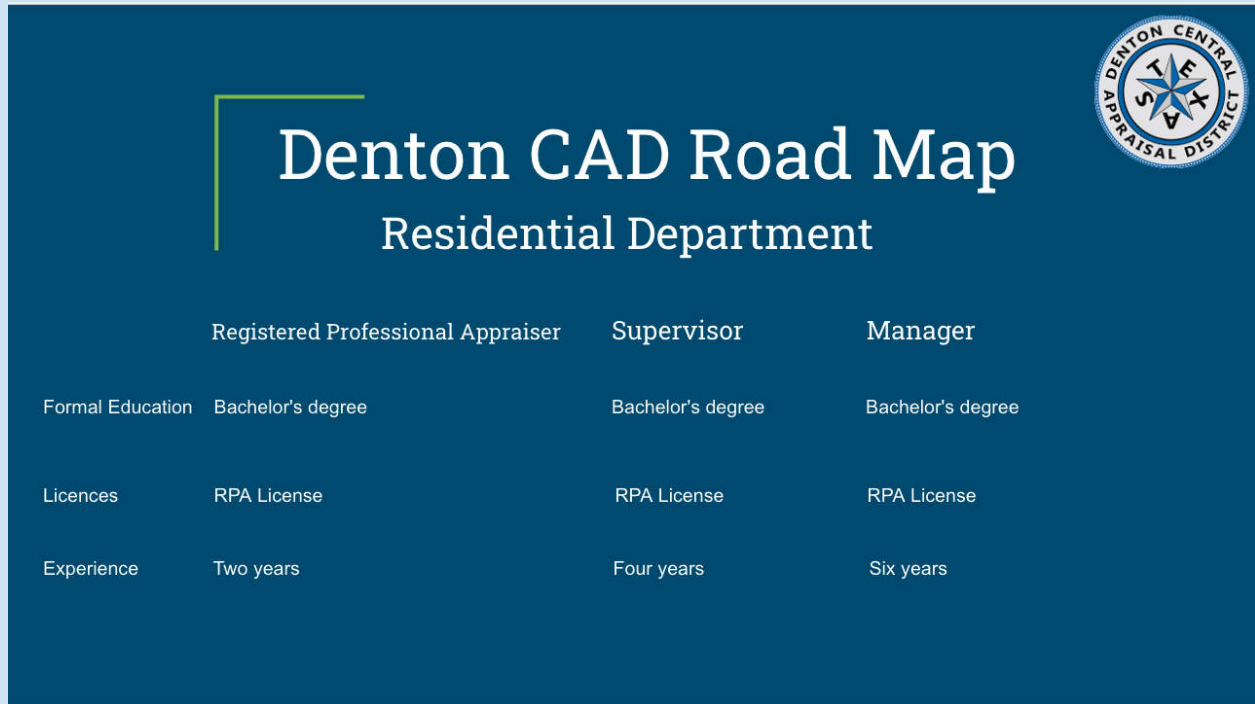
Figure 3 - DCAD Road Map

One way to recognize employees is by promoting, investing, and training them. The Road Map is a program that will provide employees with the requirements needed to advance within the organization. This program will be used to encourage and emphasize the DCAD culture and will help to promote from the inside. The Road Map program will be developed in 2023-2024. Below is a small example of the direction of the DCAD Road Map (Figure 3).