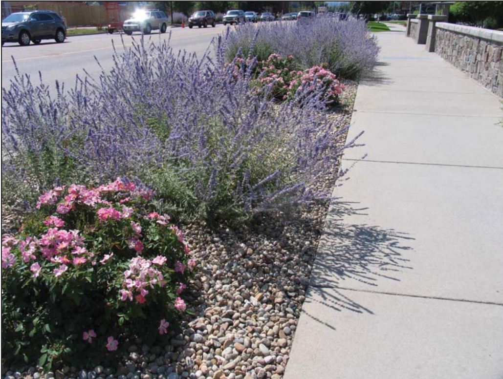
Figure 5.16 Flowering shrubs in gravel mulched beds along 28th Street in Boulder. Gravel stays in place better than wood chips along windy road edges.

readily blow away. Flower, shrub and ornamental grass beds with stone mulch can be more easily blown free of leaves and organic debris (Figures 5.16 and 5.17). There is less frequent call for fertilizer application in gravel mulched beds, since there is little decomposition.