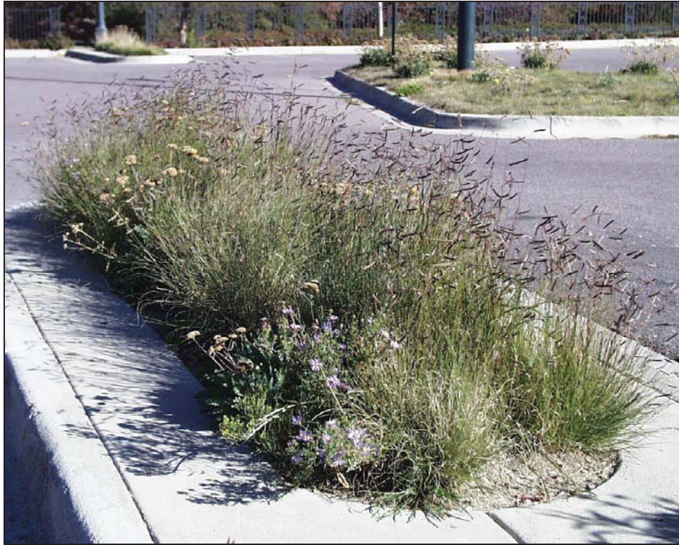
Figure 2.1 Blue grama used in parking lot islands as drought tolerant planting.