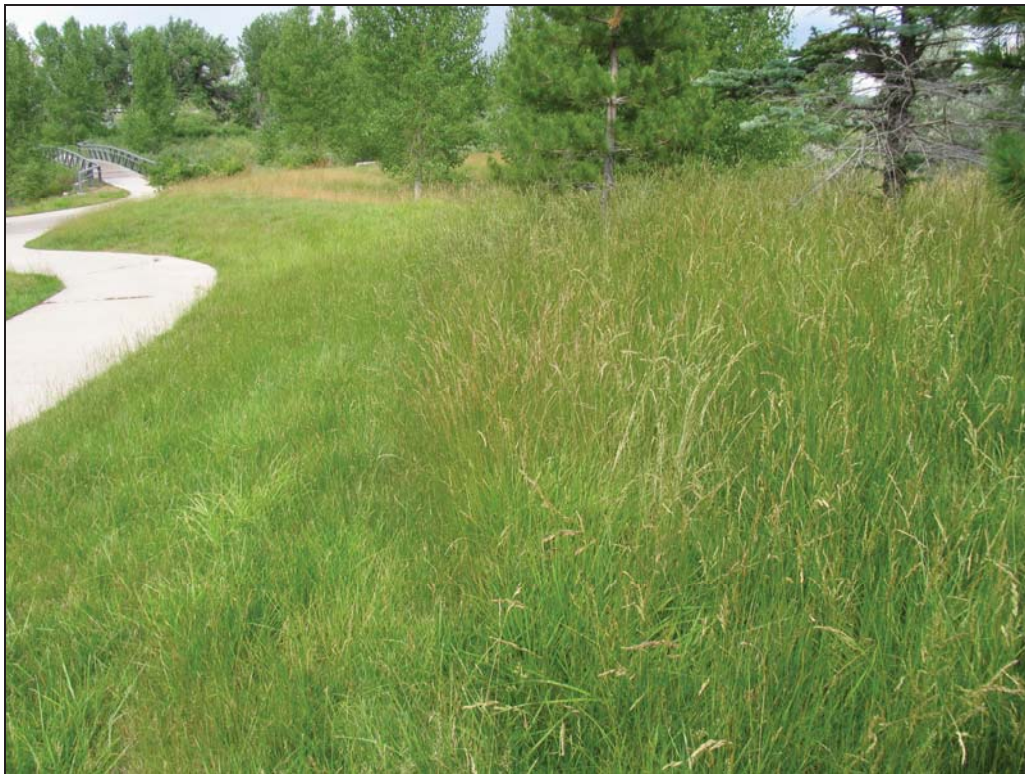
Figure 1.2 Mowed and unmowed fine leaved fescues can provide water savings of 40 percent or greater. This installation is located at Flatirons Crossings Mall in Broomfield.