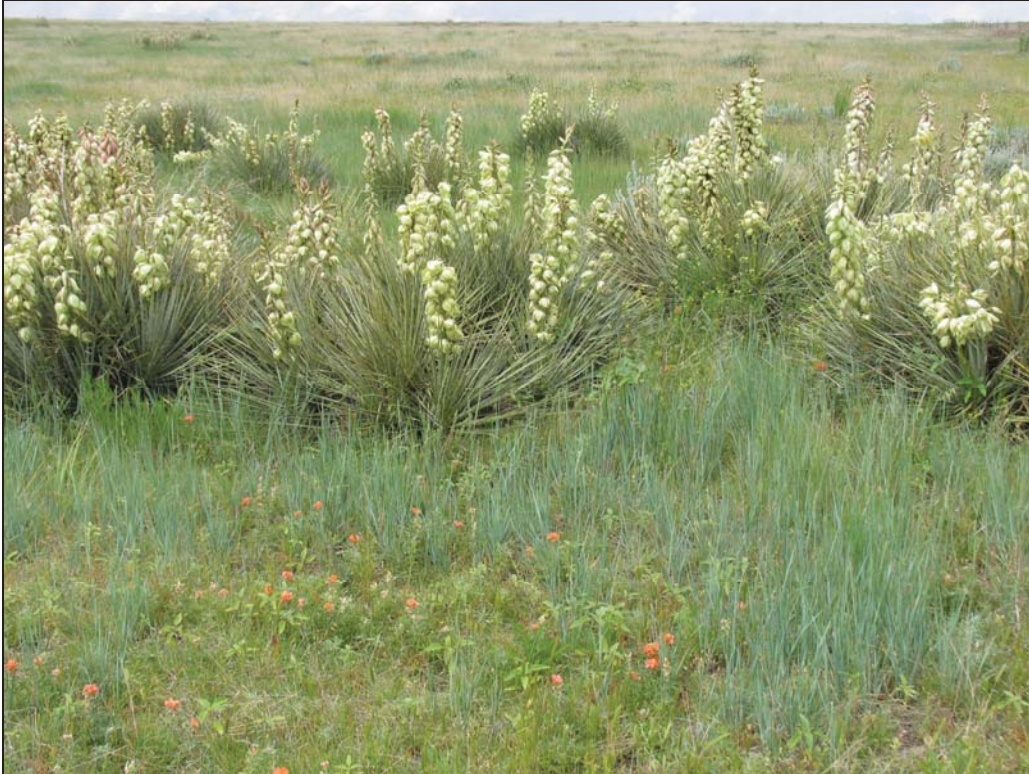
Figure 5.9 Native midgrass prairie with yucca near Aurora reservoir in late June.

community can be planted on the same range of native soils as shortgrass prairies, including clay loam, loam or sandy loam soils. Less severe areas such as east or north facing exposures, intermediate south-facing and west-facing slopes, flatter uplands sites are well suited to this grassland type.