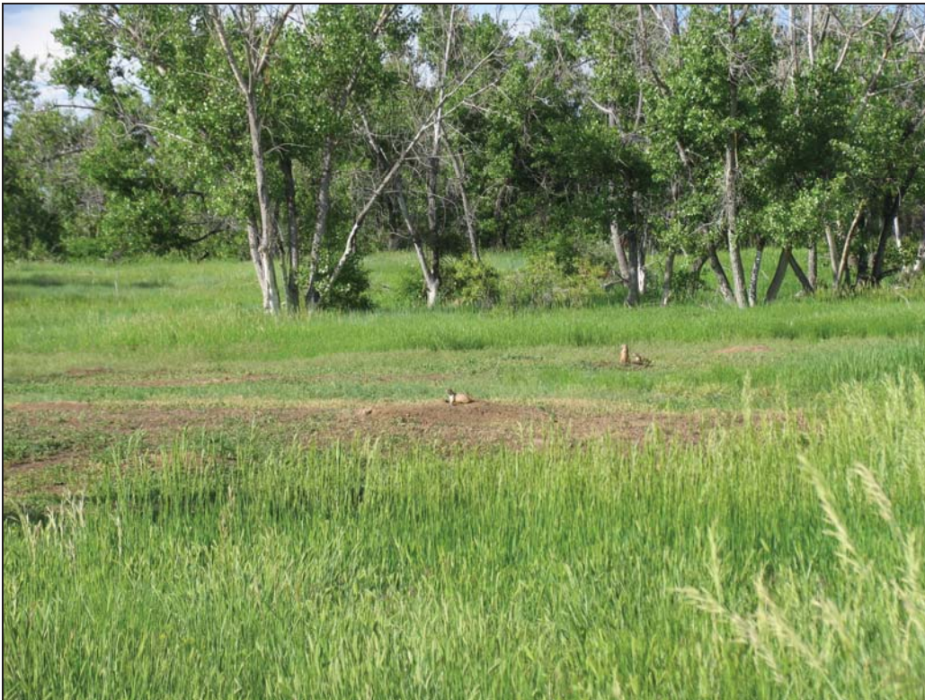
Figure 7.1 Prairie dogs require large areas of grassland and careful management to prevent overcrowding and degradation of the landscape.

It is essential that any newly seeded areas near existing prairie dog colonies be monitored. Encroaching prairie dogs should be controlled or removed immediately to prevent costly reseeding. Several years of grazing exclusion are essential to allow for good root development. Heavy grazing will eventually degrade conversion sites.