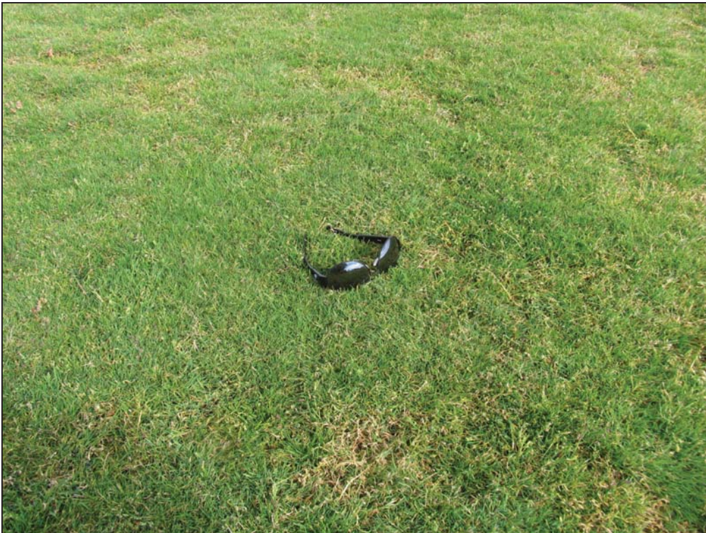
Figure 5.3 A trial area of winter hardy bermudagrass turf at the CSU test plots.

some application for turfgrass in the Front Range of Colorado. The unimproved variety, also called 'common' bermudagrass is known as a weedy aggressive turf and garden invader in southern and western Colorado. The improved varieties are reported to be less invasive and are becoming more commonly used as a drought tolerant, low growing turfgrass (Figure 5.3). As with other warm season grasses, this species turns tan colored with the onset of dormancy about mid-September and greens up late in mid-May. Newer varieties have narrow (0.125 inch) deep green leaves. They are available as seed or may be propagated from plugs dug from existing stands.