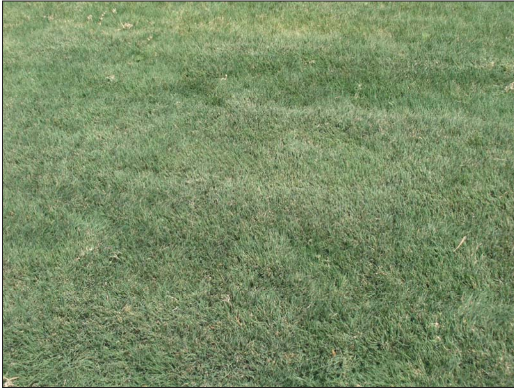
Figure 5.5 Legacy variety buffalograss turf display in July, shows a rich medium green color.

cool season grasses is essential. Careful application of broadleaf or broad spectrum herbicides may be safe during the late dormancy period in March, prior to warm season green up in May. Always follow herbicide label directions.