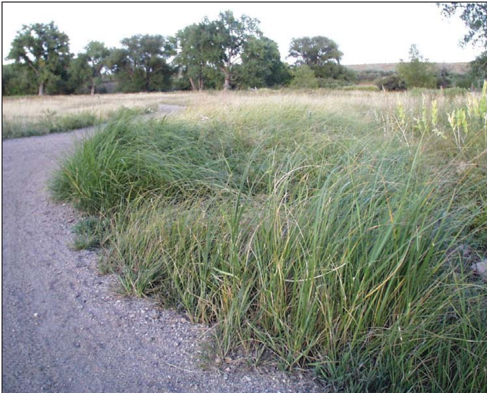
Figure 5.12 Moist meadow vegetation dominated by prairie cordgrass near South Boulder Creek.

Moist meadow and wetland vegetation is adapted to grow in occasionally or consistently saturated soils. Natural drainage areas, detention basins, seeps or low wet areas, such as