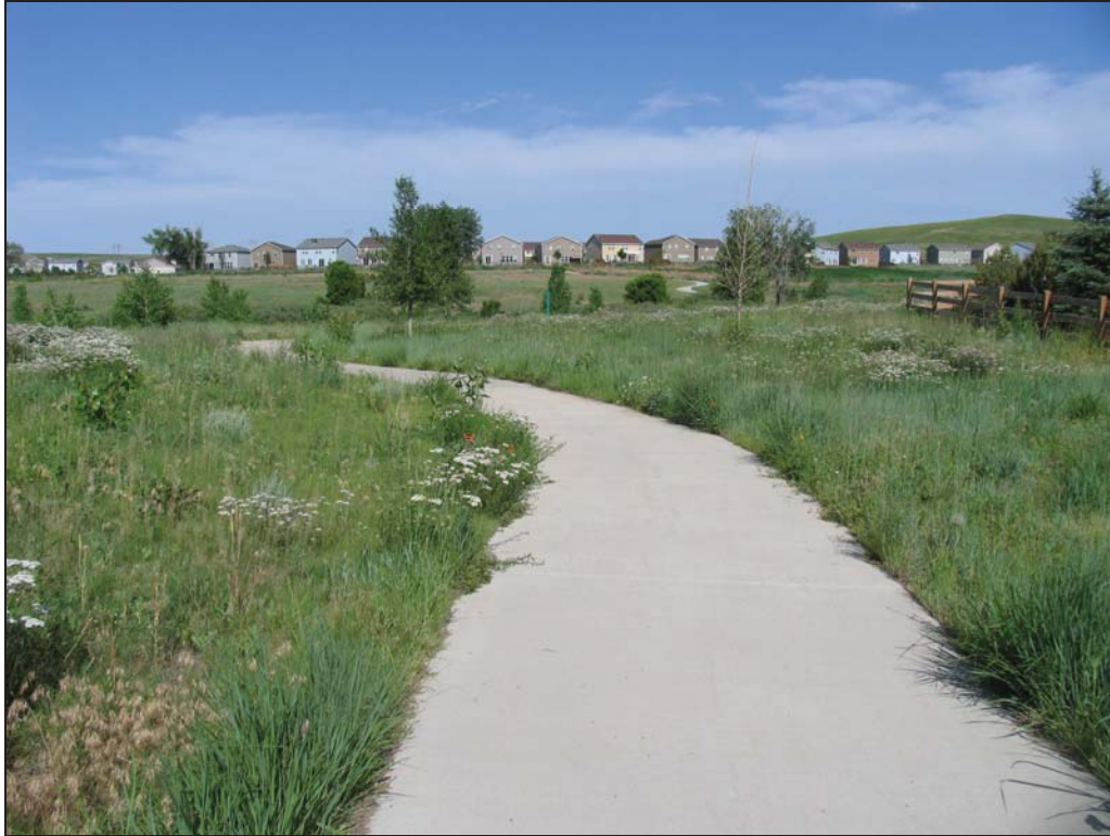
Figure 1.4 Early summer condition of mixed grass prairie planted in Erie Commons Open Space.

Native areas support passive recreation, exploration, creative play, and wildlife habitat, which greatly enrich our metropolitan areas. Personal health and well being and educational benefits can be enhanced by access to functional native or naturalized open spaces. Multi-use benefits of native restoration in drainages and riparian corridors are recognized by the recent trend in Low Impact Development (LID) designs for storm water nationwide. Such sustainable green infrastructure areas are being intentionally featured in urban designs because they provide a range of important ecological services, including: erosion protection, water quality improvement, run off reduction, oxygen production, carbon dioxide sequestration, air cooling, while serving as natural aesthetic features for passive recreation and wildlife habitat.