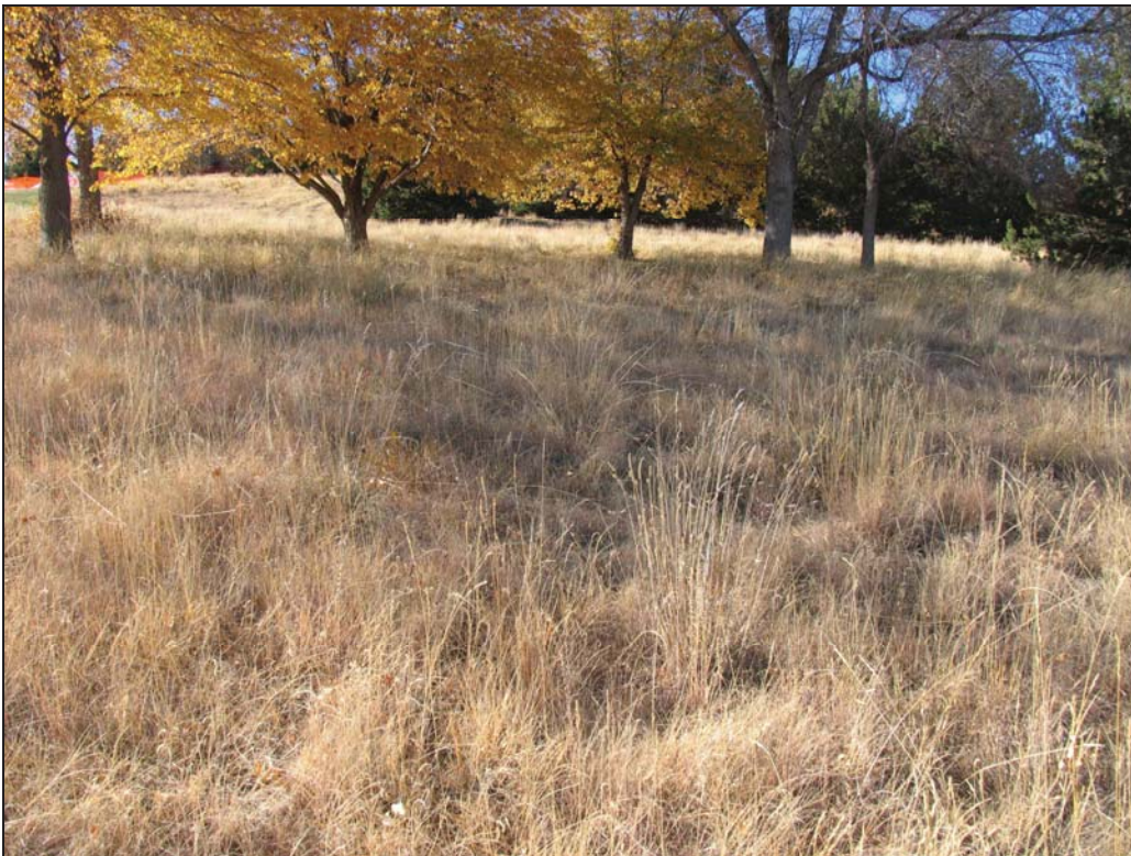
Figure 9.1 Midgrass prairie conversion area in fall condition on Ruby Hill, Denver.

Water demands from on going population growth along the Front Range will continue to apply heavy pressure to the available water supply. At this time, most turfgrass areas remain as water consumptive conventional Kentucky bluegrass. Up to this time drought tolerant landscape designs have focused largely on installation of mulched beds with drip systems, and grasslands. Conversion methods need to be more widely demonstrated on public landscapes (Figure 9.1). While buffalograss and blue grama have seen some use as alternative lawns, excellent alternative turfgrasses such as cold hardy bermudagrass and inland saltgrass have seen very limited application. They should receive more visible application in the public landscape. Modified irrigation and maintenance programs for Kentucky bluegrass should also be publicly demonstrated (Section 4).