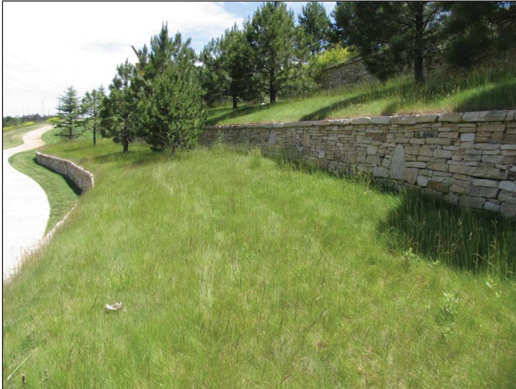
Figure 3.5 Retaining walls reduce the gradient and improve infiltration of this fine fescue grassland.