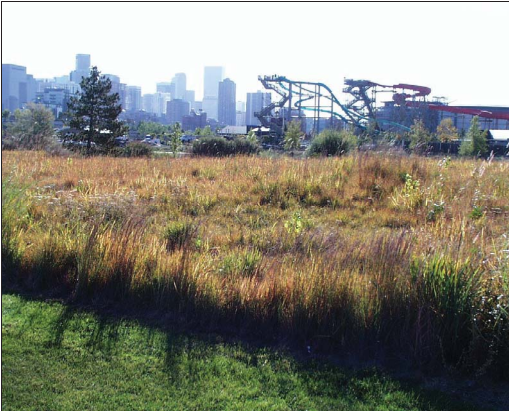
Figure 5.10 A seeded tall grass prairie in Fishback Landing Park west of downtown Denver showing fall color in late September.