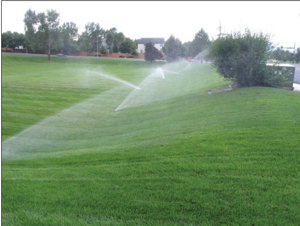
Figure 4.1 Conventionally maintained Kentucky bluegrass areas can yield close to a 20 percent water savings if placed on a modified irrigation and maintenance program.