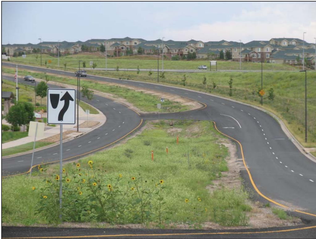
Figure 3.2 Elevated salinity levels inhibit grass cover along road edges, which leaves them more vulnerable to weediness and erosion.

winter and early spring. Drainage can be a problem in shallow soils over shale or other hard pan layers, which function as barriers to water infiltration.