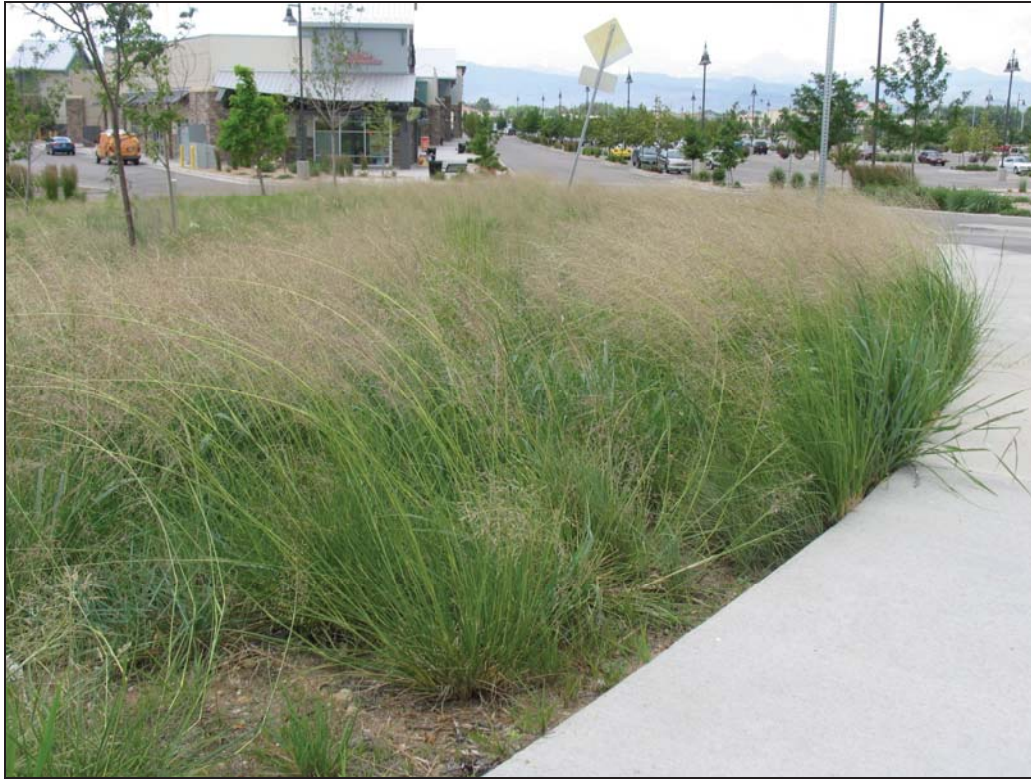
Figure 5.14 Alkali sacaton, a salt tolerant grass in roadside planting east of Longmont.