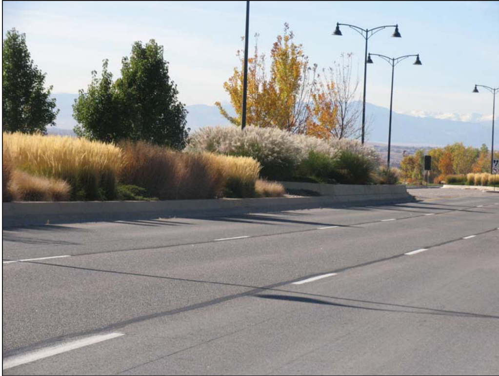
Figure 1.1 Attractive use of drought tolerant ornamental grasses in a Front Range streetscape.