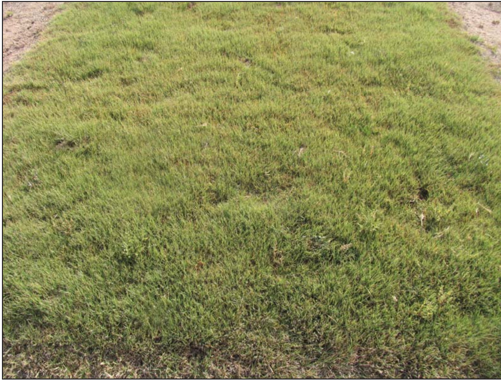
Figure 5.7 An inland saltgrass turf trial area at the CSU test plots.

with excellent turfgrass density. Unfortunately, improved varieties have not yet been commercially released from test trials.