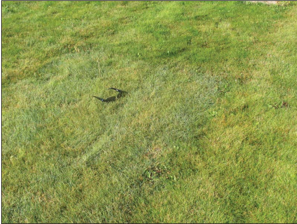
Figure 5.2 Several varieties of fine fescue turfgrass at the CSU turfgrass test plots show the variations in color which are possible within a fescue mixture.

irrigated, fine fescue areas can thin and become patchy. If weed control is required, always check labels prior to chemical application, fine fescues can be sensitive to some herbicides.