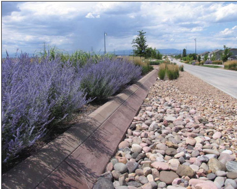
Figure 1.3 Drought tolerant median landscape along east 104th Ave in Thornton.

Sustainable landscape designs have improved greatly over the last two decades. This trend in alternative landscape creation is attuned to regional environments and driven by an interest in resource conservation. Within the Front Range corridor newer developments, malls and streetscapes have created beautiful landscapes which address the paired needs to reduce water consumption and maintenance efforts (Figures 1.1, 1.2 and 1.3). This forward-looking trend has already found wide application, offering a diverse and attractive regional setting for newer urban and suburban developments.