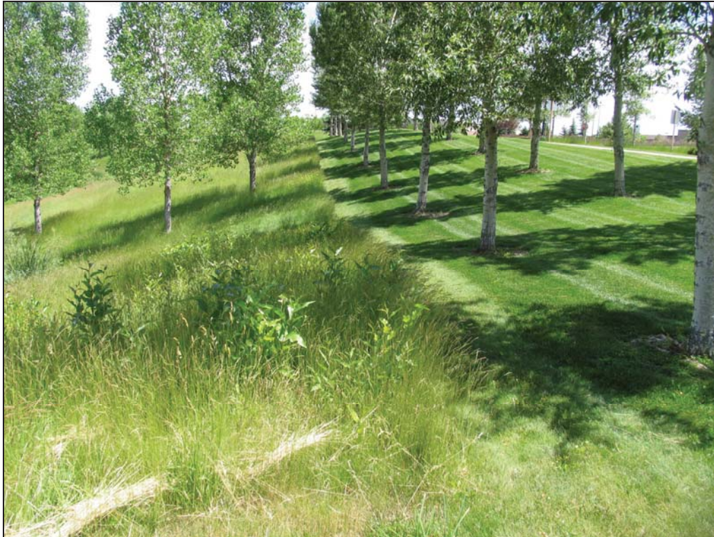
Figure 5.1 An un-mowed fine fescue grassland provides a soft cover for this shady slope. An area of mowed tall fescue turf is under the trees on the right. The lighter mowed grass just above the fine fescue slope is a mowed portion of fine fescue turf.

maintained Kentucky bluegrass. Installations of unmowed fescue grasslands can realize a 68 to 78 percent water savings. Over-watering or under-watering can result in damage, which can require overseeding for restoration. For best results, a regular irrigation schedule at reduced application rates is best to maintain an even and dense stand of grass.