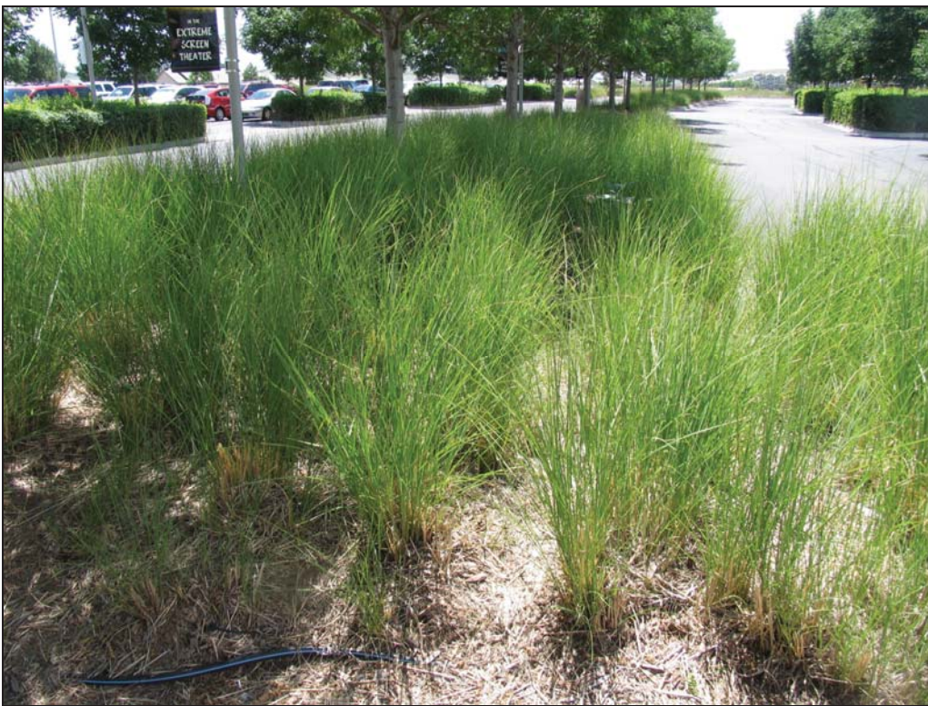
Figure 3.4 Mulched ornamental grass bed in tree lawn. Note use of drip irrigation line in foreground.

Stands of warm season conversion turfgrass species may thin in shaded areas due to a lack of direct sunshine and competition with existing tree or shrub roots. Heavily shaded areas can be converted to mulched beds. For the best water savings and improved woody vegetation maintenance, the irrigation for mulched tree and ornamental grass or shrub beds should be separate from grass areas. Separate zones permit optimal irrigation programs for shady locations and adjacent sunny exposures, or for vegetation types with differing irrigation requirements (Figure 3.4).