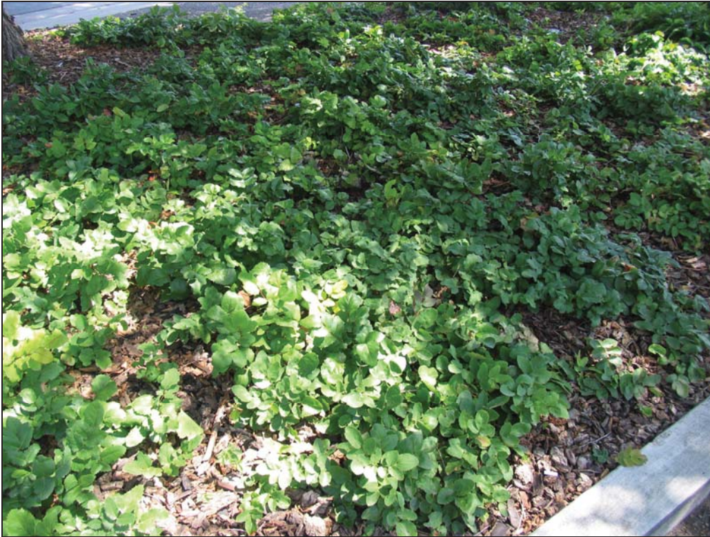
Figure 5.15 Native Oregon grape in shady woodchip mulched bed under pines.

for traditional turf, depending upon the selected vegetation. Conversion turfgrass or native grassland conversions which have pre-existing tree or shrubs can preserve the shrubs and trees by installing mulched beds around the woody plantings. The beds should extend to the tree or shrub drip line (outer extent of the tree or shrub canopy). Separate irrigation must be provided for the mulched beds and adjacent grass areas.