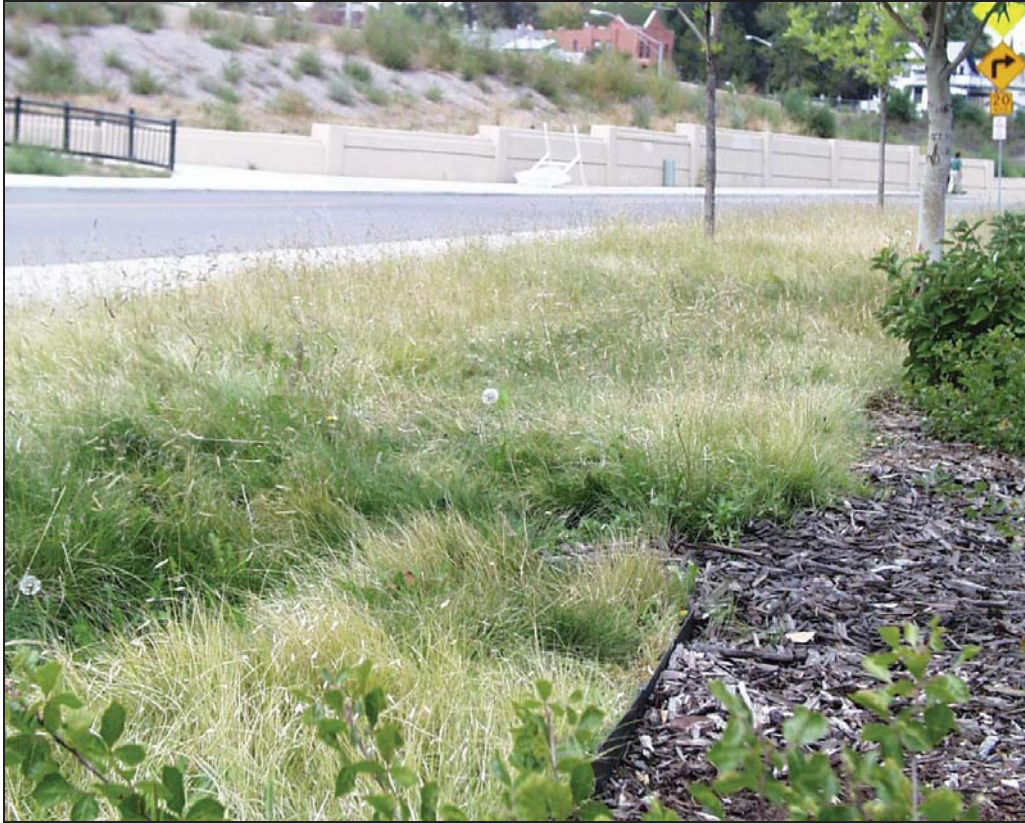
Figure 5.6 Blue grama turf with flowering heads near REI, in Denver. This area is a bit too shady; fine fescues might be better.

broadleaf or broad spectrum herbicides can be safe during the late dormancy period in March or early April, prior to warm season green up in May.