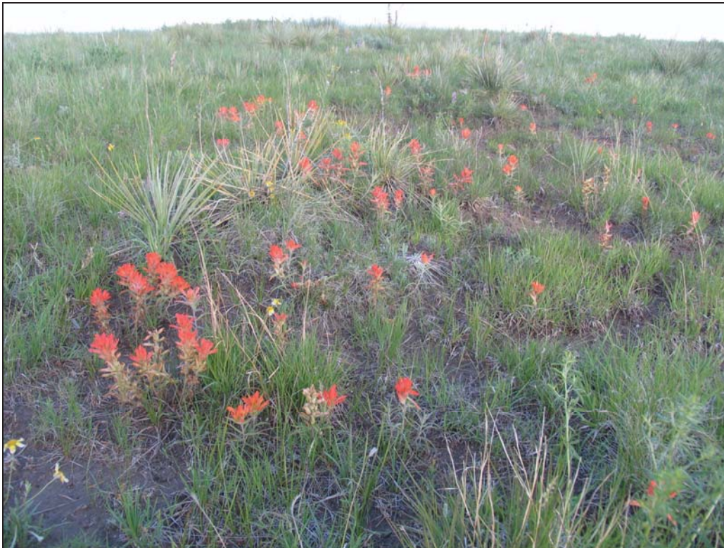
Figure 5.8 Native shortgrass prairie east of Denver in late June with yucca and orange flowering Indian paintbrush.

Shortgrass prairie species occur widely in native areas east of the Front Range. This grassland type is very drought tolerant. Sunny exposed locations can support this low