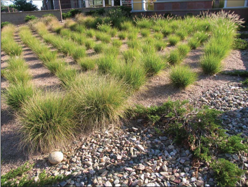
Figure 5.17 Ornamental grasses in gravel mulched bed.