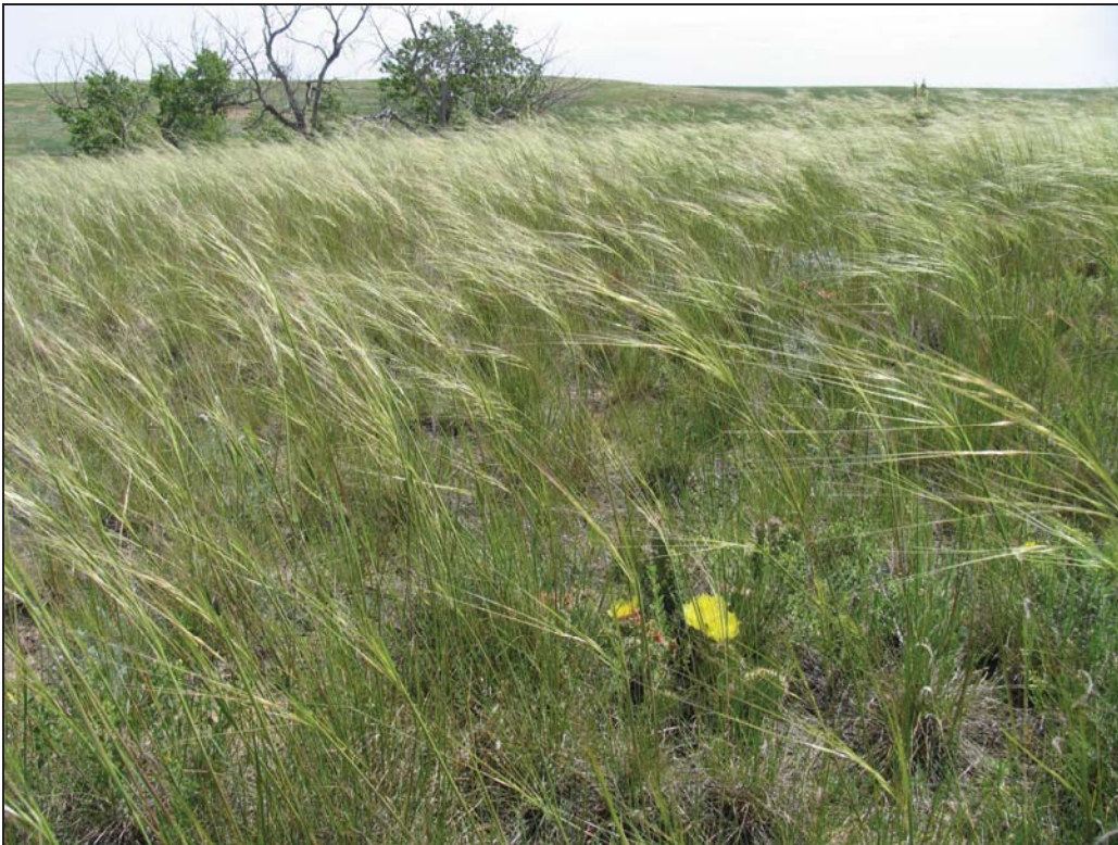
Figure 5.11 Native sand prairie with needle-and-thread grass, east of Denver.

locations are typically dominated by midgrass to tallgrass species including sandreed ( Calamovilfa longifolia ), sand bluestem ( Andropogon hallii ), Needle-and-Thread grass ( Stipa viridula aka Nasella ) and sand dropseed ( Sporobolus cryptandrus ). These species are also recommended to be included when reseeding porous landscape detention (PLD) areas, since these areas use sand enhanced growth media. Sand prairies can be planted wherever sandy soil conditions permit, however, the taller sand prairie species will be better developed on lower slopes and valley floor locations with higher levels of soil moisture.