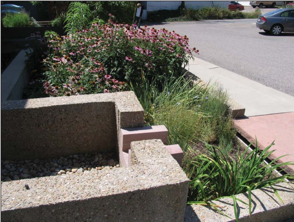
Figure 3.6 A colorful rain garden which receives roof runoff and is supplemented by a drip irrigation system during dry spells.

Drainage areas can often be converted to include riparian plant communities. With no additional water, low areas can support diverse local native vegetation including: tallgrass prairies, moist meadows, and wetlands. Where space allows, native woody species can be added to improve community structure and habitat value, including plains cottonwood, peach-leaved willow, wild plum, chokecherry, golden currant, red osier dogwood, woodbine, netleaf hackberry, virgins bower, western snowberry and other attractive species. Planted in the proper locations for the individual species' soil moisture requirements, these native plants need little or no irrigation after establishment. These riparian species can provide erosion protection, summer cooling, structural and aesthetic diversity as well as critical wildlife habitat.