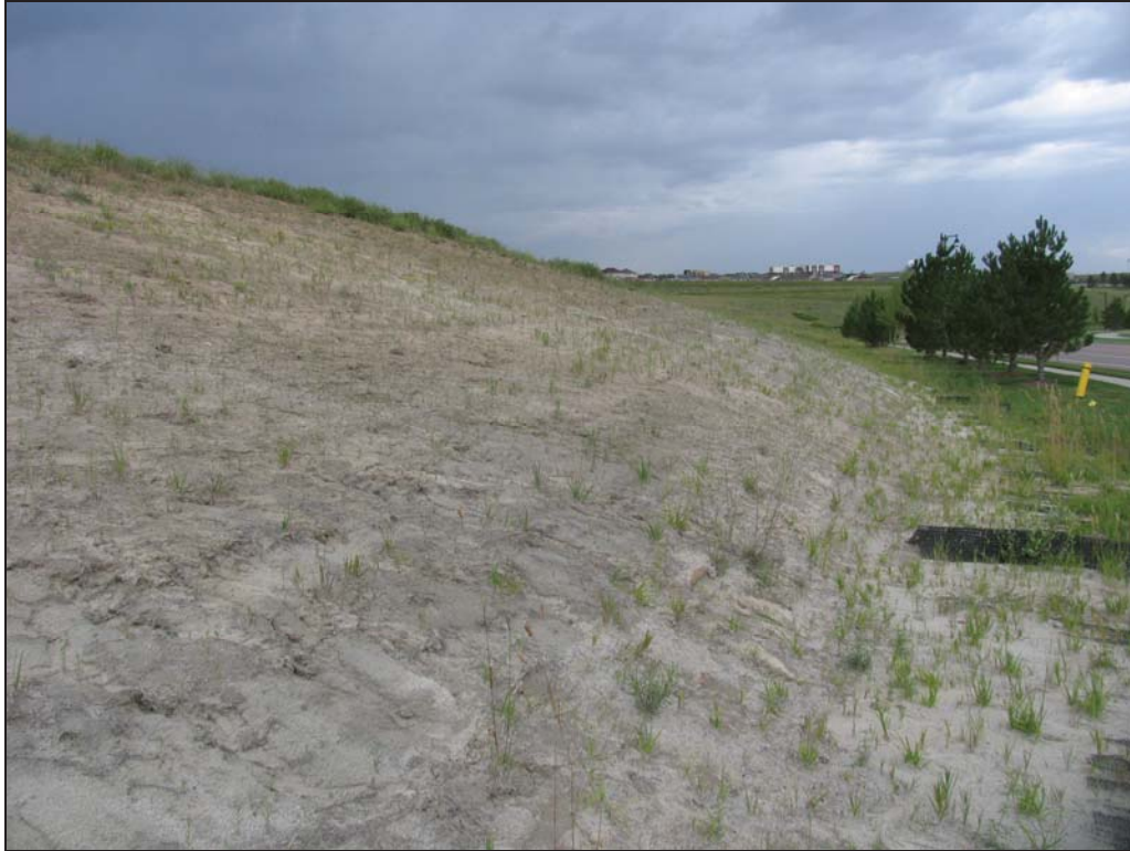
Figure 3.1 Vegetation has not successfully established in this area of exposed subsoil. Salvage and reapplication of topsoil would have improved seeding results.