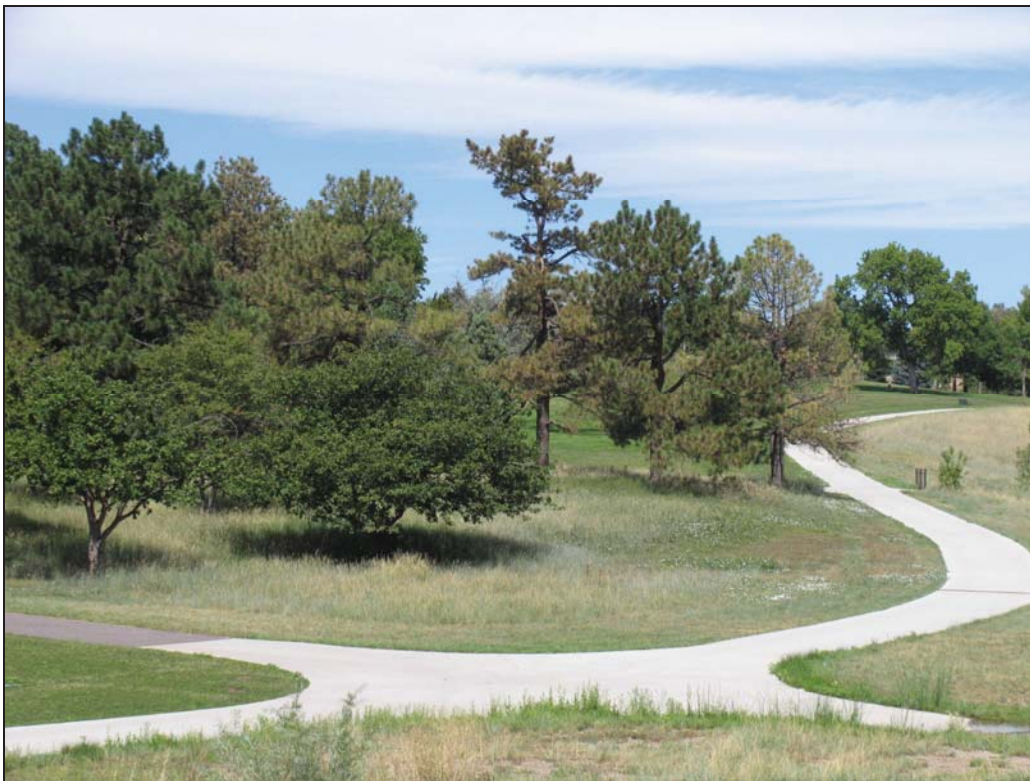
Figure 5.4 A new wheatgrass installation late in the first year after seeding. This installation shows the late summer appearance of the unmowed wheatgrass grassland. A six foot band of mowed wheatgrass turf appears in the lower left photo adjacent to the sidewalk. A small section bluegrass lawn appears on the left and at the top of the photo. The thin spots filled in the following year.

throughout the Front Range of Colorado. It is useful in mowed tree lawns or parking strips where a coarser (wider) leaf texture is acceptable. This mixture of species can provide a very durable drought tolerant turf which requires less maintenance than conventional Kentucky bluegrass. It includes both native and introduced cool season wheatgrasses with moderately good turf potential. Unmowed grasslands can germinate and establish fairly easily on 15 inches of precipitation or irrigation per year. Establishment irrigation will improve seeding results. If not mowed the seed heads can reach 24 inches in height and are interesting but not striking. Except for slender wheatgrass, these grass species are sod formers. This cool season mixture of grasses will grow well in clay loam to loam soils. Two different seeding rates are included in Appendix A: one for turf, at a heavier seeding rate, and one for naturalized grasslands, at a lower seeding rate.