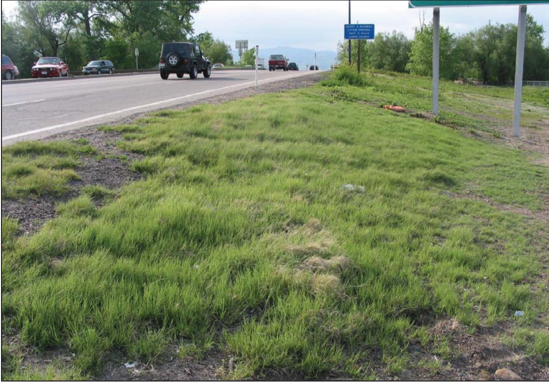
Figure 5.13 Native inland saltgrass on roadside in north Boulder.

Elevated salt levels naturally occur in the Denver area, due to exposed regional marine sediments. The splash zone in roadside areas can also have elevated salt content where salt products are used for de-icing. If a grassland or native prairie mixture has been planted within a streetscape, a salt tolerant mixture can be over-seeded on top of the basic seed mixture to provide salt tolerant grasses (Figures 5.13 and 5.14). However, all native species have an upper limit of salt tolerance. Mature salt tolerant species can tolerate twice the levels (EC of 6-8 mmhos/cm) necessary for their seedlings to successfully establish (EC of 3-4 mmhos/cm). The edges of highways, where magnesium chloride is regularly applied, may already exceed the acceptable salinity levels tolerated by these native species. It can be very difficult to keep vegetation alive in these areas. If roadside areas have an irrigation system, it can be helpful to thoroughly irrigate in early spring in order to flush the salts from the soil.