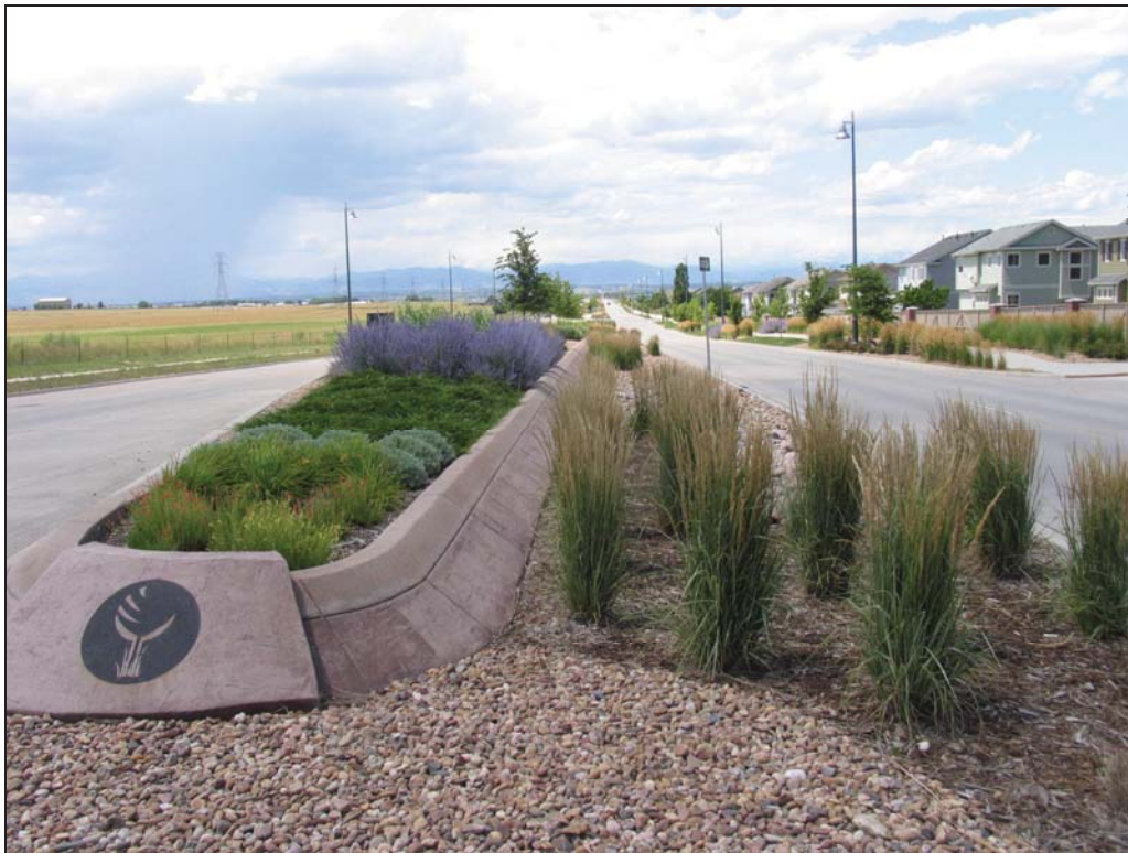
Figure 3.3 Splash guards and vegetated elevated medians can help reduce salt impact to plantings along road edges.

Where healthy streetscape vegetation is critical, physical protection for vegetated medians and street edges can be enhanced with elevated medians which provide splash guards to reduce damage from salt spray (Figure 3.3). To create a successful streetscape, it may be necessary to leach accumulated salts or replace existing saline soils with fresh topsoil. By installing an irrigation system, heavy winter salt contamination can be flushed from the area each spring. Saline street areas or roadsides, where installation of irrigation flushing systems would be impractical, should be considered for hardscape treatment.