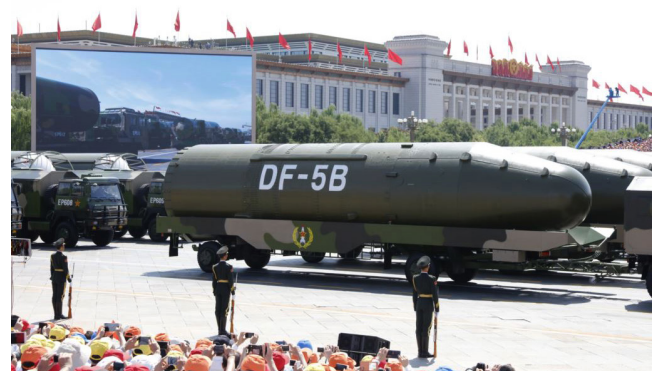
The CSS-4 is a silo-based ICBM that can reach most locations in the United States.

China has about 75 to 100 ICBMs with nuclear missions in its inventory, including the silo-based CSS-4 Mod 2 and Mod 3 (Chinese designator DF-5), the solid-fueled, road-mobile CSS-10 Mods 1 and 2 (DF-31 and DF-31A), and the shorter ranged CSS-3 (DF-4). The CSS-10 Mod 2, with a range in excess of 11,000 kilometers, can reach most locations within the continental United States. The remainder of China’s nuclear force includes road-mobile, solid-fueled CSS-5 (DF-21) medium-range ballistic missiles (MRBMs) for regional missions. 95