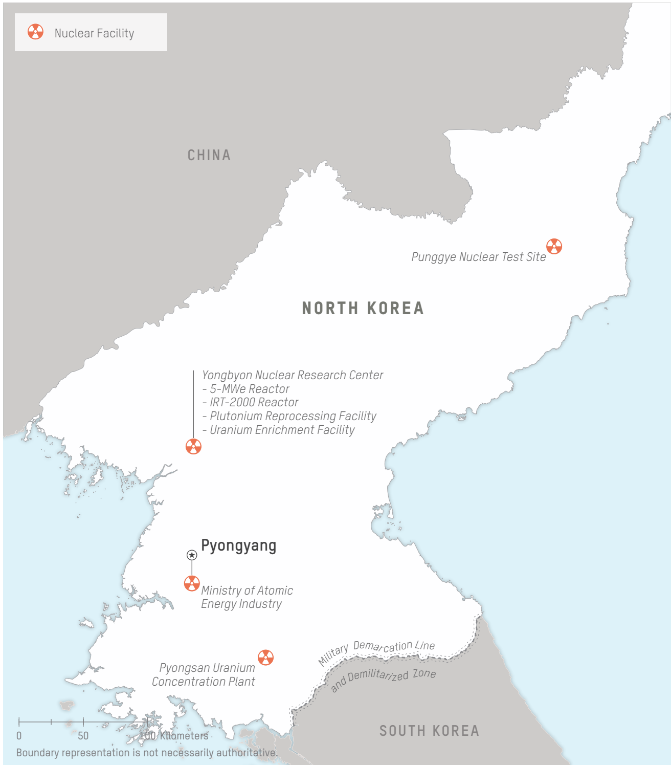
1703-12171 North Korea's Nuclear Infrastructure