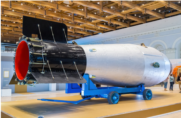
Model of Soviet 50-Megaton "Tsar Bomb"

Russia's nuclear weapons program began during World War II, accelerated after the bombings of Hiroshima and Nagasaki, and by 1949 resulted in a successful test of a nuclear device. From 1949 until 1990, the Soviet Union was responsible for 715 of the world's 2,079 reported nuclear detonations. Of the 715, 219 occurred in the atmosphere, in space, or underwater. The remaining 496 detonations were performed underground. The majority of the testing occurred at two sites: 456 tests at Semipalatinsk in Kazakhstan and 140 tests on the