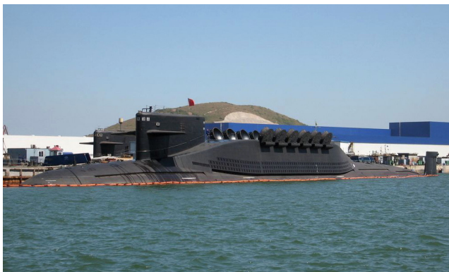
Jin Class Nuclear-Powered Ballistic Missile Submarine

opment includes launch platforms for new weapon systems, such as more-mobile transporter-erector-launcher systems, possible rail-launch platforms, and a next-generation SSBN, which will reportedly carry the JL-3 SLBM. 107,108 China tested a hypersonic glide vehicle in 2014, although official statements made no reference to its intended mission or its capability to carry a nuclear warhead. 109,110 In 2016, the PLA Air Force commander referred publicly to the military's efforts to produce an advanced long-range strategic bomber, a platform observers tied to nuclear weapons. Past PLA writings expressed the need to develop a "stealth strategic bomber," suggesting aspirations to field a strategic bomber with a nuclear delivery capability. 111