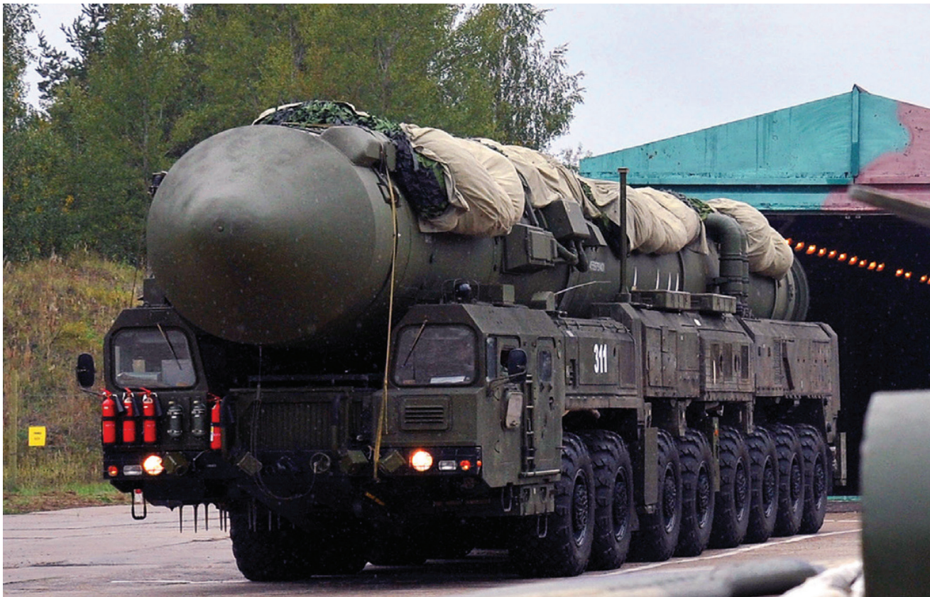
Field Deployed SS-27 Road-Mobile ICBM

Russia's sea-based portion of the triad includes at least 10 SSBNs under operational control of the Naval High Command. 59 The current fleet consists of the SS-N-18 Mod 1 (IOC 1978) deployed on Delta III class submarines, the SS-N-23 (derivative Sineva missile deployed in 2007) deployed on Delta IV class submarines, and the new SS-N-32 (IOC 2014) deployed on Dolgorukiy class submarines. These