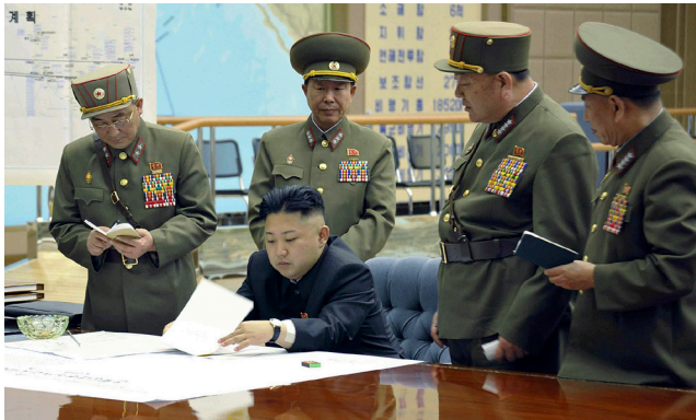
Kim Jong Un allegedly ordering his missile units to be ready to strike