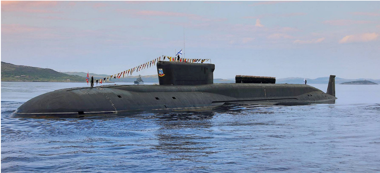
Dolgorukiy Class Nuclear-Powered Ballistic Missile Submarine

missiles carry three, four, and six MIRVs respectively. The Russian Navy is upgrading its strategic capabilities, mainly by building more reliable and quiet Dolgorukiy class SSBNs with the new SS-N-32 SLBMs. The Delta III SSBNs are likely to be retired in the next few years. 60,61