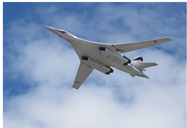
Tu-160 Blackjack Nuclear-Capable Strategic Bomber

Russia fears that the speed, accuracy, and quantity of nonnuclear, strategic-range, precision-guided weapons can achieve strategic effects on par with nuclear weapons, 40 one of the primary reasons that, since at least 1993 (and most recently reflected in Russia's 2014 Military Doctrine), Russia has reserved the right to respond with a nuclear strike to a nonnuclear attack threatening the existence of the state. 41,42,43 Recent statements on Russia's evolving nuclear weapons doctrine lower the threshold for first use of nuclear weapons and blur the boundary between nuclear and conventional warfare. Very-low-yield nuclear weapons reportedly could be used to head off a major conflict and avoid full-scale nuclear war. 44,45