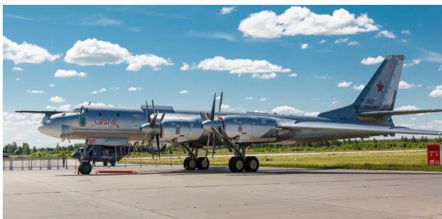
Tu-95 Bear Nuclear-Capable • Strategic Bomber

Russia is committed to modernizing and adding new military capabilities to its nuclear forces. Land-based intercontinental ballistic missiles (ICBMs) are controlled by the Strategic Rocket Forces (SRF), and sea- and air-based strategic systems are managed by the Navy and Aerospace Force, respectively. 12 Russia plans to upgrade the capacity of its strategic nuclear triad by 2020. 13 In addition to its strategic nuclear weapons, Russia is adding new military capabilities to its large stockpile of nonstrategic nuclear