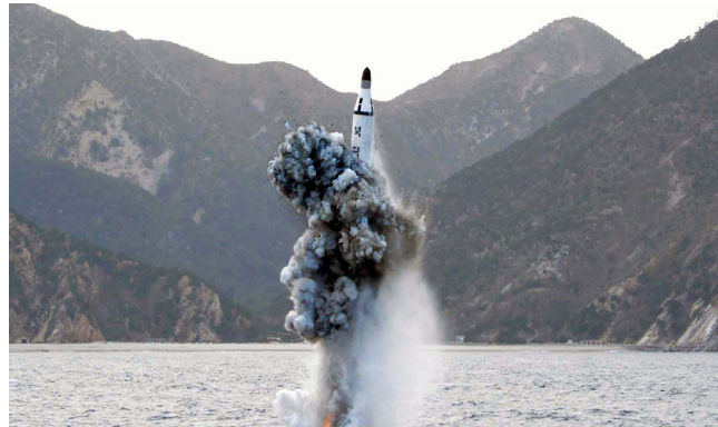
North Korean SLBM launched from an underwater test barge

based variant. 150 In 2016 and 2017, over 40 launches of short-, medium-, intermediate-, intercontinental-range, and submarine-launched systems were conducted. 151 In addition to two Hwasong-14 ICBM tests and a Hwasong-15 ICBM launch, these flight tests included intermediate-range missile tests over Japan in August and September. 152,153