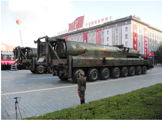
Hwasong-13 Road-Mobile ICBM displayed in a military parade