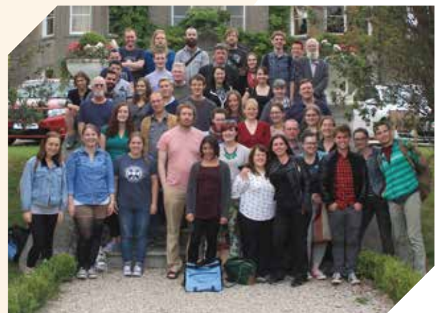
Scoil Samhraidh 2015