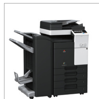
The d-Color MF283 equipped with DF-628 feeder, FS-534SD finisher and PC-214 trays