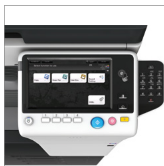
New 7" touch panel with NFC authentication area and optional KP-101 numeric keypad