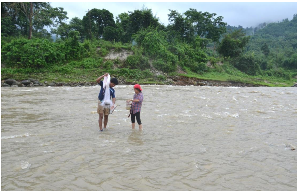
Figure 6 The Poma River, India; Arunachal Pradesh, type locality of Channa pomanensis with authors

In live – Dorsum of head and body tan colored with 7 oblique dark brown bands along flank and one dark brown to dusky cross band at occipital region (sometime indistinct; Fig. 3). Preorbital and postorbital streak light to dark brown, postorbital streak sometime broad and irregular. Lower jaw with white patches on either underside in adult specimens. Flank below lateral line light pinkish brown, scattered with somewhat elongate light brown spots. Ventral surface grayish cream. Dorsal and anal fins with three layers: first, outer margin with a thin white streak, second, a somewhat broad submarginal dark blue streak, and third with sky blue interradial membranes and light brown to grayish brown radials. Pelvic fin light to dark brown with white distal margin. Pectoral fin light brown without distal margin. Caudal fin with light orange distal margin, light to dark brown radials and sky blue to hyaline interradial membrane, consisting about 12–14 narrow brown cross bands (Fig. 5). Eye pupil black with orange ring. A dark brown to dusky band on occipital region.