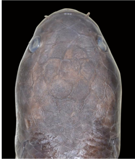
Figure 2 Dorsal view of middle of head of Channa pomanensis , ZSI/APRC P-1308, paratype, 169.6 mm SL; India, Arunachal Pradesh, showing arrangement of larger scales in a flower-shaped pattern, succeeding by two other large scales and preceding by one scale medially.

streak that confluent with brown to dusky cross band across occipital region; light brown somewhat elongate spots on body mostly below lateral line (more distinct in live); two cycloid scales on either underside of lower jaw; lateral line scales 47–51; dorsal-fin rays 36–38; anal-fin rays 25–26; total vertebrae 42–45; predorsal scales 7–8; absence of numerous large black spots on postorbital region of head and opercle; transverse scale rows above lateral line 4\frac{1}{2} – 5\frac{1}{2} ; transverse scale rows between lateral line and anal-fin origin 7\frac{1}{2} – 8\frac{1}{2} ; and pelvic fins present.