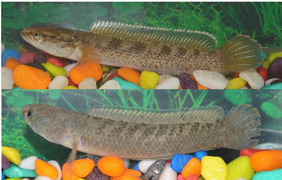
Figure 3 A, Channa pomanensis , ZSI/APRC P-1066, holotype, 111.6 mm SL; India, Arunachal Pradesh, showing live coloration. B, Channa gachua , ZSI/APRC P-1437, 95.6 mm SL; India: Assam: Sonitpur district: Boroï River at Boroighat (Brahmaputra basin)

Dorsal fin long, origin about one-third of standard length, with 36(1); 37* (1); and 38 (5) rays, extending slightly to first caudal procurrent ray.