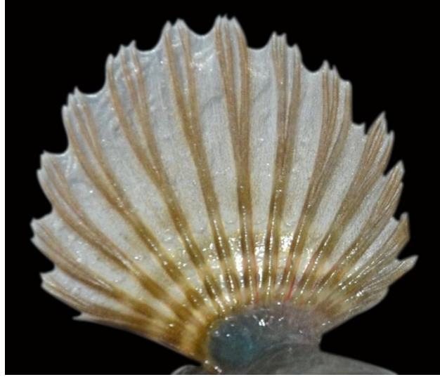
Figure 4 Pectoral fin of Channa pomanensis , ZSI/APRC P-1066, holotype, 111.6 mm SL; India, Arunachal Pradesh, showing dark brown blotch at base and brown semicircular cross bands on fin.