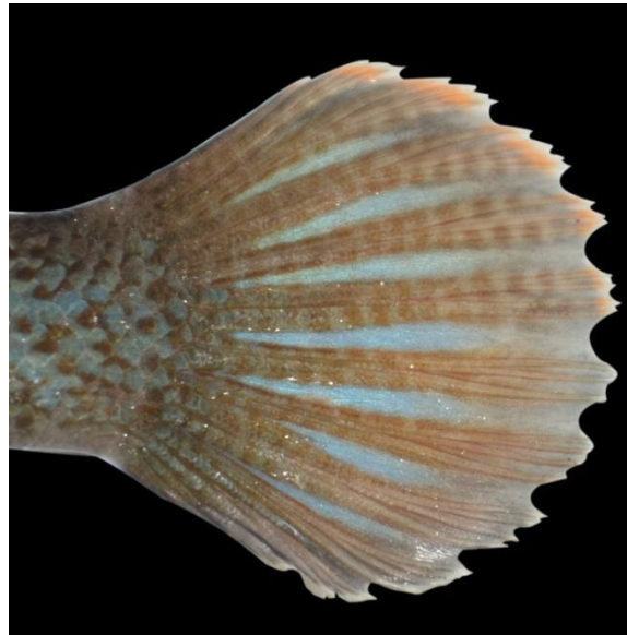
Figure 5 Channa pomanensis , ZSI/APRC P-1066, holotype, 111.6 mm SL; India, Arunachal Pradesh, showing 14–15 light brown cross bars and series of elongate scales on the radials of caudal fin, almost extending proximal half of the radials.

Pectoral fin broadly rounded in adult individual ((152.5–169.6 mm SL; Fig. 4) when expanded and lanceolate in young individuals (88.6–111.6 mm SL), origin in advance of dorsal-fin origin, with 1 unbranched, 13(1), 14*(4), 15(2) branched rays.