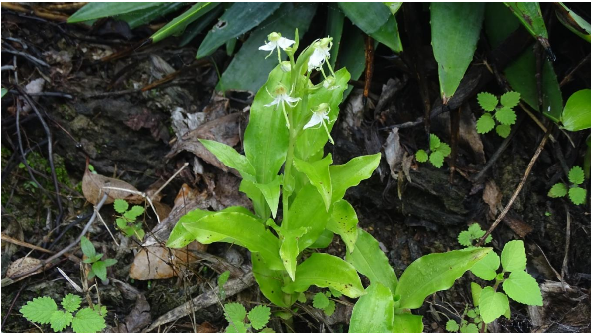
Fig. 2 Full Blooming of Habenaria gibsonii var. foetida in Natural location