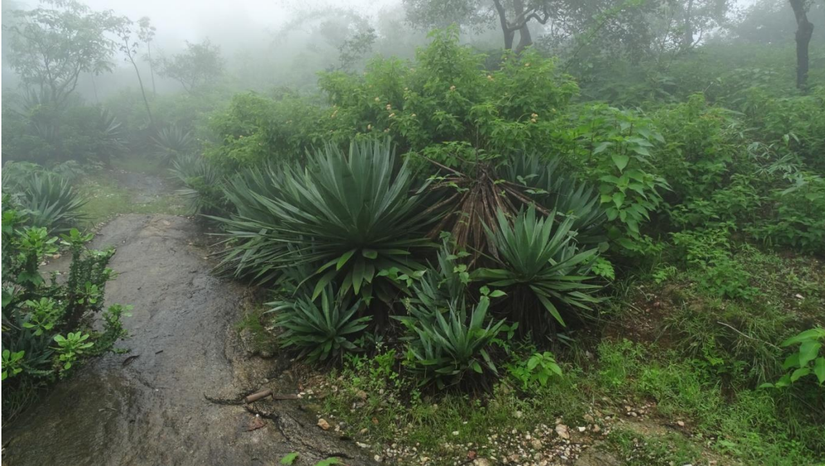
Fig. 1 Natural location of Habenaria gibsonii var. foetida at Mount Abu Wildlife Sanctuary

Although the flowers belonging to our recent collection of plants from Mount Abu, Rajasthan (Purohit & Kulloli, 36953) were emitting a pungent odour. Most of the authors have not commented on a floral odour, probably because they were working with herbarium specimens and not fresh material. During processing of herbarium specimens pungent odour of flowers lost. Because a thorough investigation of the stability of these rather minor and perhaps dubious differences within and between populations is beyond the scope of the present paper, for now we maintain the two varieties as distinct.