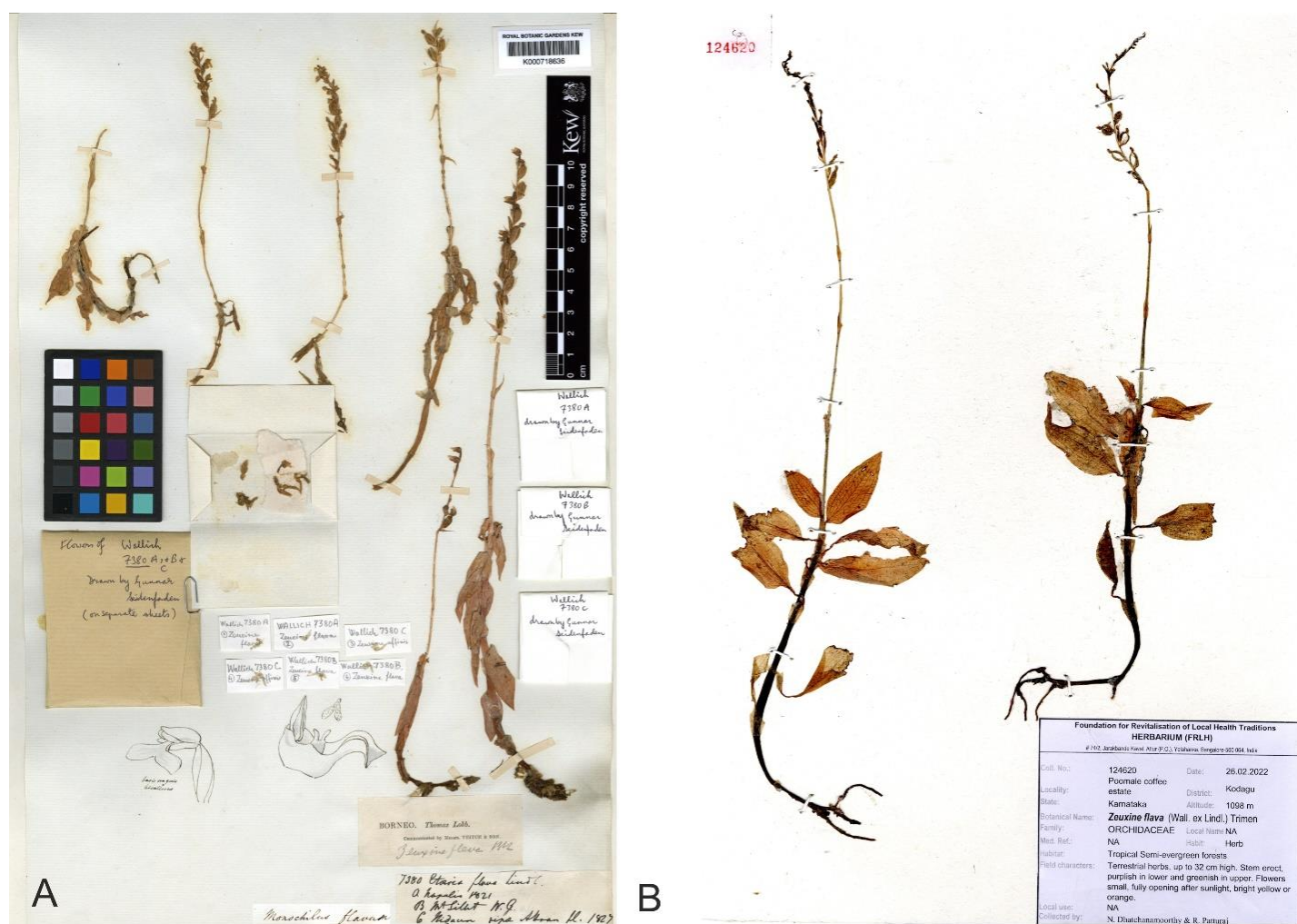
Figure 1. Zeuxine flava A. Type specimens (Reproduced with kind permission of the Board of Trustees, Royal Botanic Gardens, Kew); B. Voucher specimens.