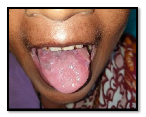
Figure 5 Post operative photo of tongue dorsum

Figure 4 Showing hyperkeratosis with mild dysplasia