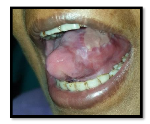
Figure 6 Post operative photo of lateral border of tongue

Figure 5 Post operative photo of tongue dorsum