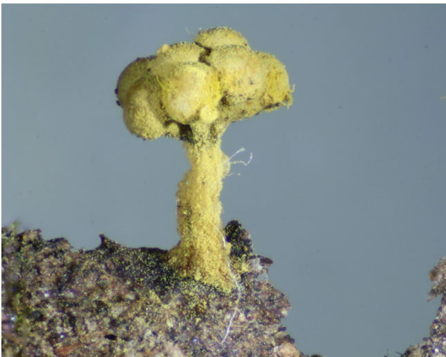
Several colonies of Trichia verrucosa (whose type specimen was collected from Tasmania) were seen on large old rotten logs.