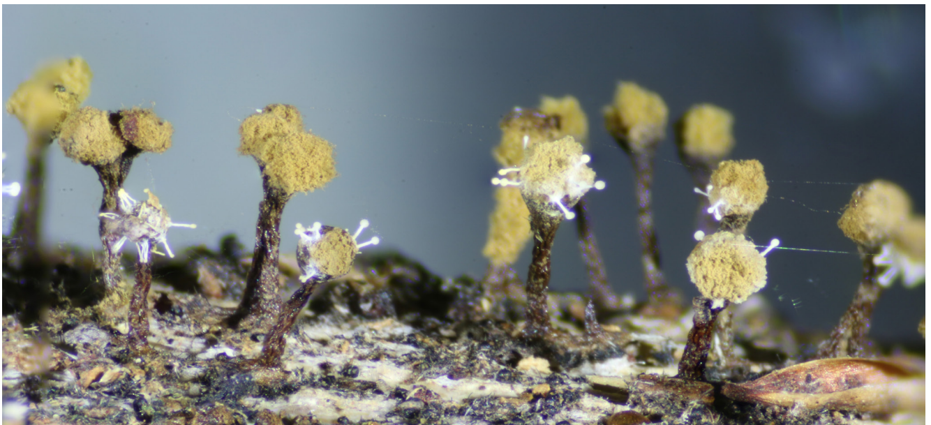
This Trichia erecta is infected with Polycephalomyces tomentosus , a fungus that is found only on Trichia species.