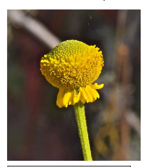
Helenium puberulum.

Ranch and Salt Point. She saw "at least 2-3 plants in the meadow behind TSR Chapel and several plants blooming beautifully on Spring Meadow hill across from the North end of TSR airstrip." Helenium bolanderi has long ray corollas, 12 to 37 mm long, and the disk corollas are 5 lobed. The peduncle (stalk the flower head is on) is densely hairy. Helenium puberulum is widespread in western and central California, but with few reports from our area. It has tiny ray corollas 3.5—10 mm long, and the disk corollas are 4-lobed.