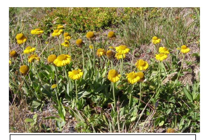
Helenium bolanderi along the road to the Point Arena Lighthouse.

Area code is 707 unless otherwise indicated