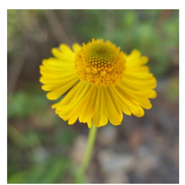
Helenium bolanderii.

Patches of species in the Sunflower Family, Asteraceae, brighten the foggy hillsides in coastal Mendocino and northern Sonoma in the summer. Helenium has about 32 species worldwide, all in the western hemisphere, with 18 in North America north of Mexico, five of them native in California. We have two species in our area, H. bolanderi and H. puberulum. Helenium bigelovii is similar to bolanderi and some of our plants have been incorrectly identified as this, but it doesn't occur on the north coast. Its stems are not as hairy.