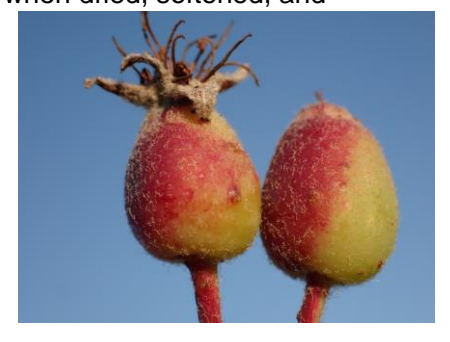
The immature fruits (pomes) of Pacific crabapple are reddish where they are sunlit, green in shade. July 2022.

Pacific crabapple is grown in the Pacific Northwest as a native ornamental tree, and it can develop old large, muscular trunks in favorable moist (or seasonally wet) sites. If it can survive in the extreme harsh wind-blasted environment in a krummholz (alpine treeline) form, it can probably thrive in cultivation here in sheltered domestic landscapes, too.