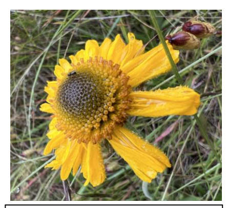
Helenium bolanderi.