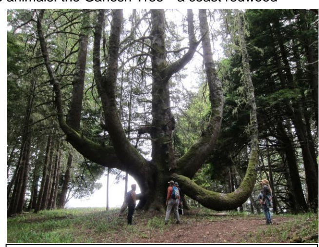
Hikers check out the so-called Octopus Tree.

more striking than the firecracker flower ( Dichelostemma idamaia ), in the Amaryllis family. No one on the walk had ever seen one before. They were a timely and beautiful surprise, blooming before the Fourth of July.