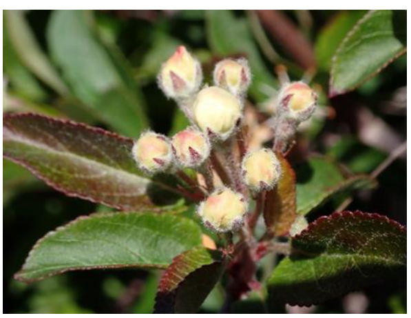
Flower buds of Pacific crabapple.

the top of the canopy. The white flowers appear in clusters of 8 or 9, in an umbel-like inflorescence, like cherry or plum blossoms.