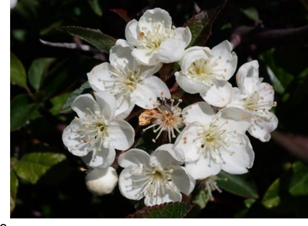
Flowers of Pacific crabapple.

localities occur near Caspar, aligned along Jug Handle Creek. The Calflora records don't include the Mendocino Flora (Smith and Wheeler 1992) 1908 locality reported "between Fort Bragg and