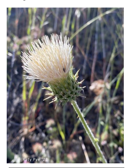
Cirsium occidentale.

females leave egg masses to develop on the undersides of thistle leaves. Pupae cling to stems. Their favorite thistles are native Cirsium: (Cobweb-C. occidentale. Clustered-C. brevistylum. Douglas-C. douglasii, and Brownie-C. quercetorum). Nonnative Bull thistle (Cirsium vulgare),