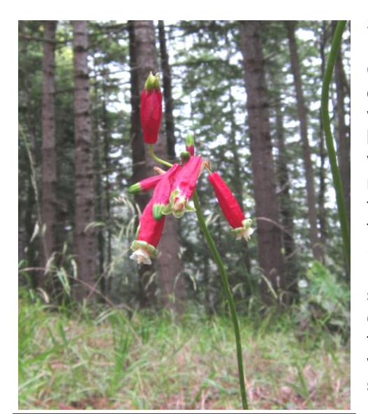
Just in time for the Fourth of July, the firecracker flower delighted Cape Vizcaino hikers.

Susan Wolbarst sent this report on the Vizcaino field trip: Rhiannon Korhummel led a June 26 walk through Save the Redwoods League's Cape Vizcaino property, located just north of Westport. Four hundred acres of Cape Vizcaino is owned by Save the Redwoods League, a non-profit which protects and restores coastal forests in California. Fog that day blotted out what could have been fabulous views of the ocean, but hikers were treated to many special plants and trees on what was billed as "a moderately strenuous 5-mile loop with elevation changes from coast bluffs to the ridge." Two of the trees we saw on the walk have been singled out for their resemblance to animals: the Ganesh Tree—a coast redwood