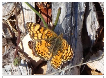
Phycoides mylitta.

I love native thistles. As an intermittent "weed warrior," however, my relationship with non-native thistles has, by nature, been adversarial. Yes, insects use them for nectar and pollen, some birds use thistle down for nests. But this is also true for many native plant species crowded out by these rogue plants. One "slow the spread" tactic I've used when weeding a mature invasive thistle patch several times over a season is to deadhead spent flowers, thus leaving a food resource while reducing viable seed.