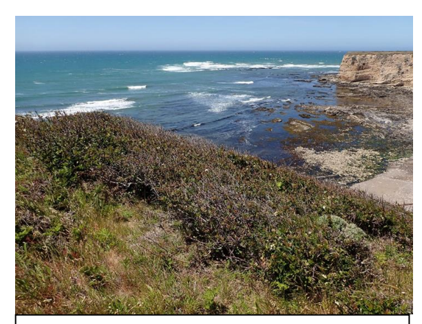
The wind-sheared, salt-spray blasted prostrate thicket of Pacific crabapple ( Malus fusca ) mantles the headland above the surf at the south side of Moat Creek mouth, mixed with poison-oak. In bloom, May 2022.

One of the recurrent themes for the botanical gems in DKY territory is related to relict species – plant populations left behind from past climates, vegetation types, and sea levels. Many of the isolated populations at or near their southern limits of distribution may take on unusual forms, occur in unusual habitats, or both. One of the most unusual examples I have found hiding in plain sight is the unique coastal Pacific crabapple "grove" – actually a thigh-high prostrate thicket – that covers almost an acre of salt spray wind-blasted coastal bluffs above the surf on the south side of Moat Creek, just south of Point Arena. It is almost unrecognizable as Pacific crabapple unless fruits or flowers are present.