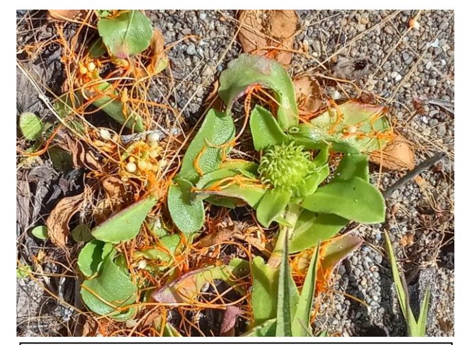
Cuscuta salina on Grindelia stricta var. platyphylla.

The younger dunes at the southern section of Manchester State Park have almost a monoculture of Ammophila , with native species few and far between. The difference between them and the older species-rich dunes to the north is huge, illustrating how very important it is that ongoing restoration take place. Terra Fuller shared with us the recent progress in reclaiming dune habitat by removal of ice plant infestations and other nonnative invasives. She only has a crew of three volunteer aides, so, Good Job, You Guys! Terra wants to let people know that volunteers are always welcome because there's still plenty of invasive plant removal work available. Contact her at Terra.Fuller@parks.ca.gov to volunteer.