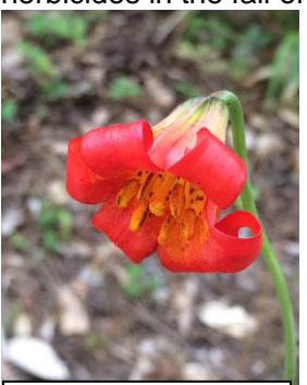
Lilium maritimum.

CALTRANS District 4 coast lily impacts return to Hwy 1 in Salt Point State Park. On June 30, 2022, DKY Rare Plant Chair (The Sea Ranch) Amy Ruegg alerted us to the return of mowing during flowering of the south Salt Point State Park roadside wetland population of coast lilies ( Lilium maritimum , CNPS list 1B.1). This is the same colony that was mistakenly treated with herbicides in the fall of 2015 (see Calypso, May 2016).