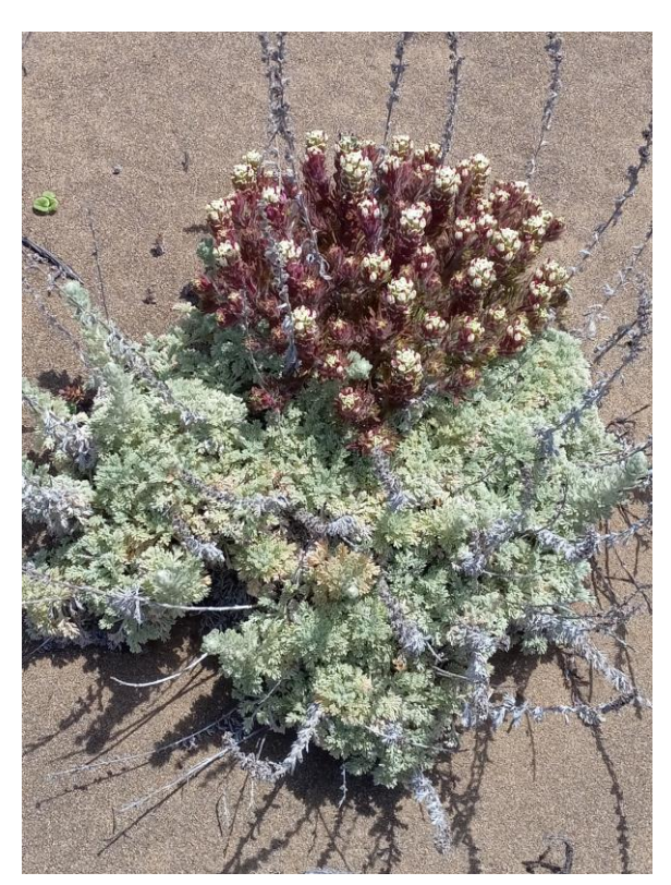
Castilleja exserta subsp. latifolia on Artemisia pycnocephala.