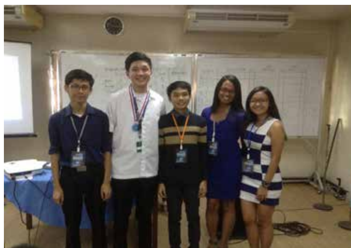
INDIVIDUAL TOP SCORER