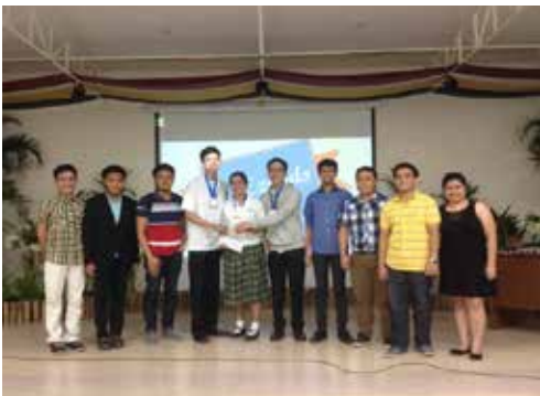
UPLB WEEZARDS QUIZ BEE – 1 ST PLACER (CHAMPION)