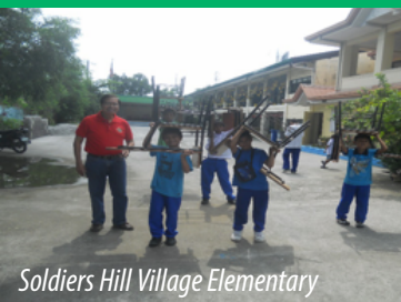
Soldiers Hill Village Elementary