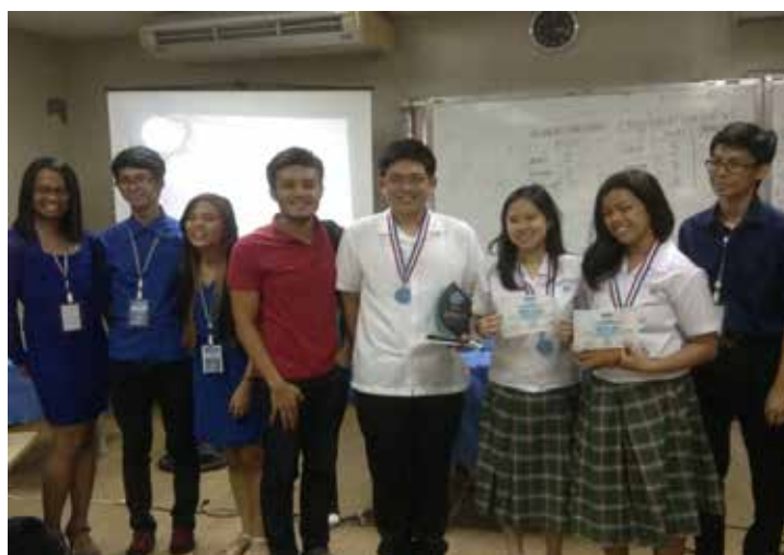
UP DILIMAN IMPACT 2015 – 1 ST PLACER (CHAMPION)