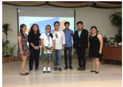
UPLB WEEZARDS ESSAY WRITING CONTEST – 2 ND PLACER