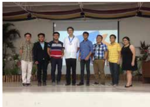
UPLB WEEZARDS INDIVIDUAL TOP SCORER