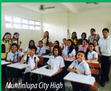
Muntinlupa City High