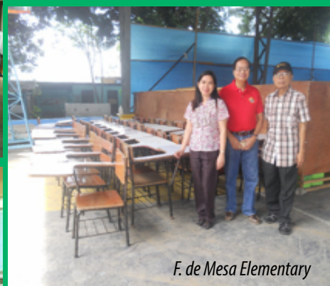
F. de Mesa Elementary