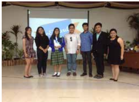
UPLB WEEZARDS ESSAY WRITING CONTEST – 1 ST PLACER (CHAMPION)