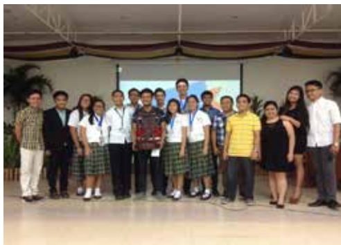
UPLB WEEZARDS OVER ALL CHAMPION – DE LA SALLE SANTIAGO ZOBEL SCHOOL