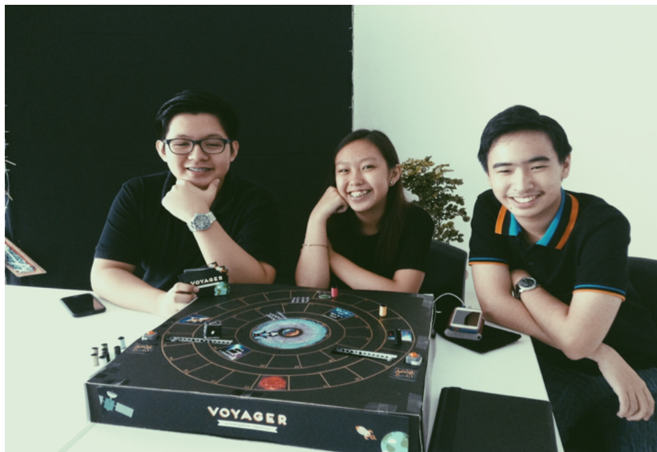
SCI MATH 2015 MAKERS AND TINKERS FAIR AND COMPETITION – 1 ST PLACER (CHAMPION)