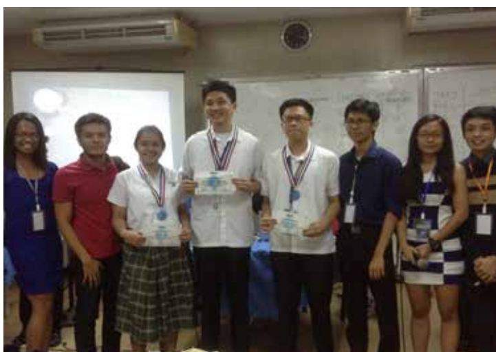
UP DILIMAN IMPACT 2015 – 2 ND PLACER