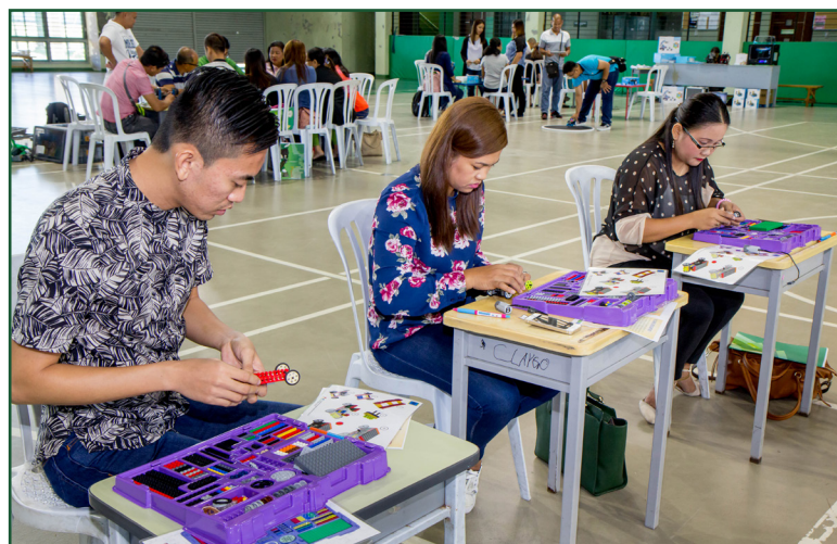
Participants of the Robotics session get hands-on training on assembling with a Robot kit.