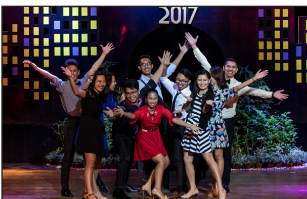
OPENING NUMBER BY SELECTED DLSZ FACULTY