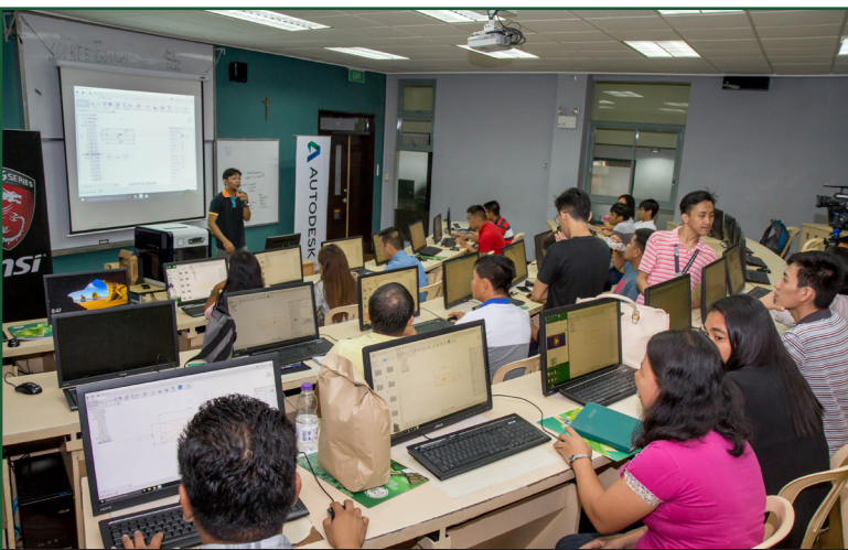
A trainer from MechaniWeb company gives the session on Autodesk Fusion 360 to SparkEd Summer 2017 participants.