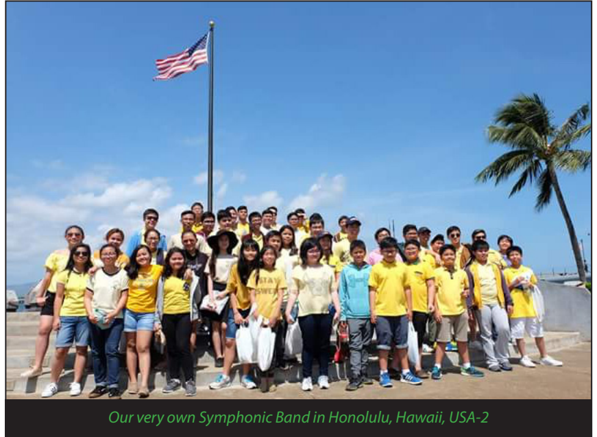
Our very own Symphonic Band in Honolulu, Hawaii, USA-2