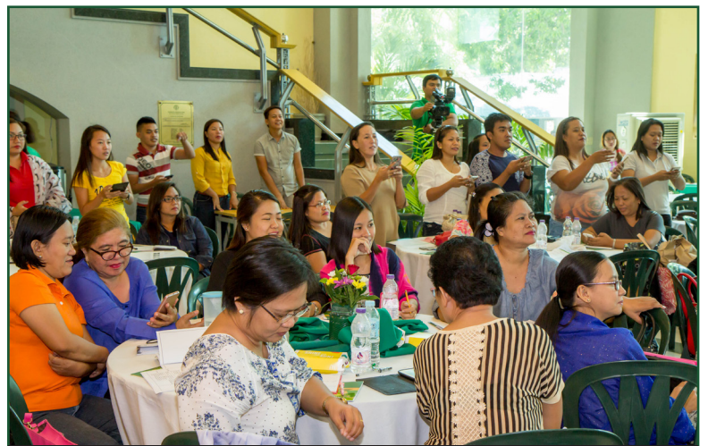
Participants were given hands-on training on using educational apps such as game-based learning app, Kahoot, which makes learning fun.