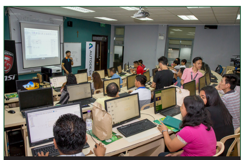
A trainor from MechaniWeb company gives the session on Autodesk Fusion 360 to SparkEd Summer 2017 participants.