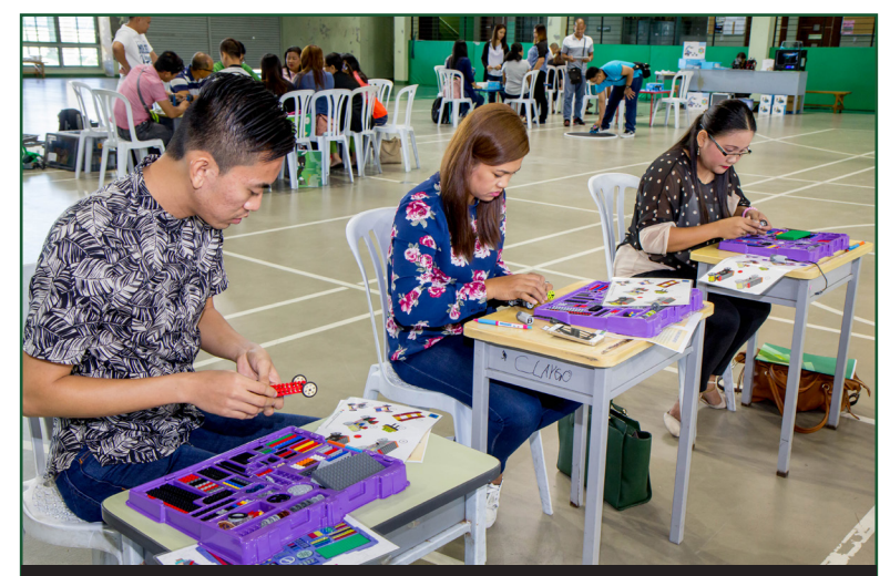
Participants of the Robotics session get hands-on training on assembling with a Robot kit.