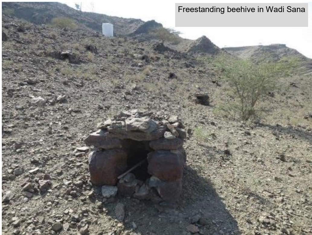
Freestanding beehive in Wadi Sana

New membership secretary required—see page 2