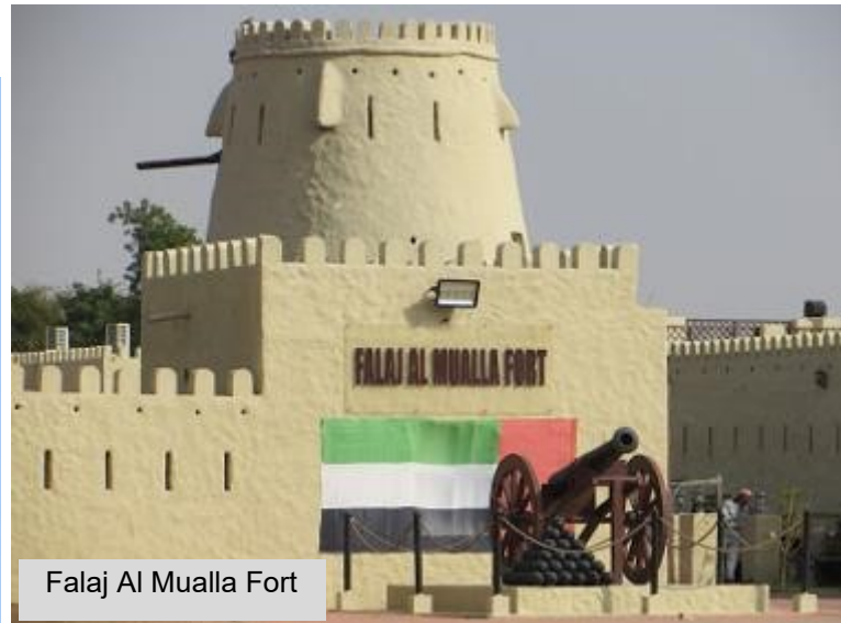
Falaj Al Mualla Fort