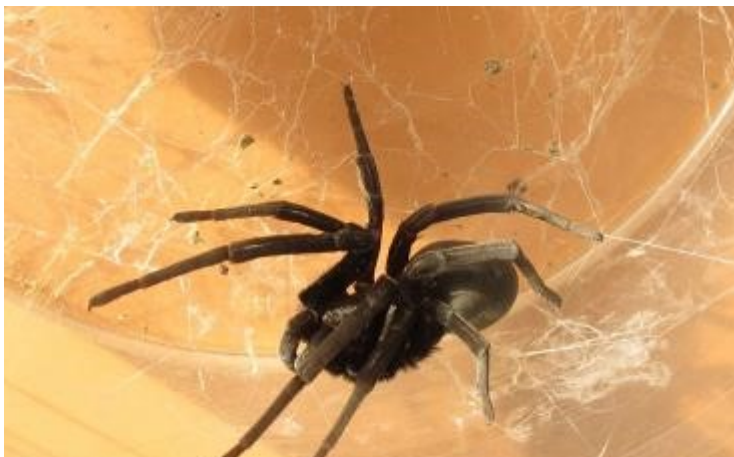
Sahastata nigra by day, in captivity, showing a resemblance to tarantulas.

Contribution by Gary Feulner and Binish Roobas