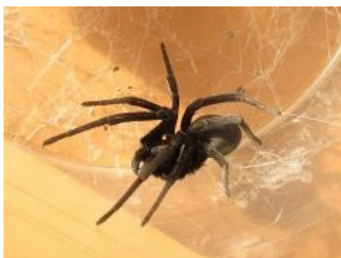
Spider lurks by night — see page 5