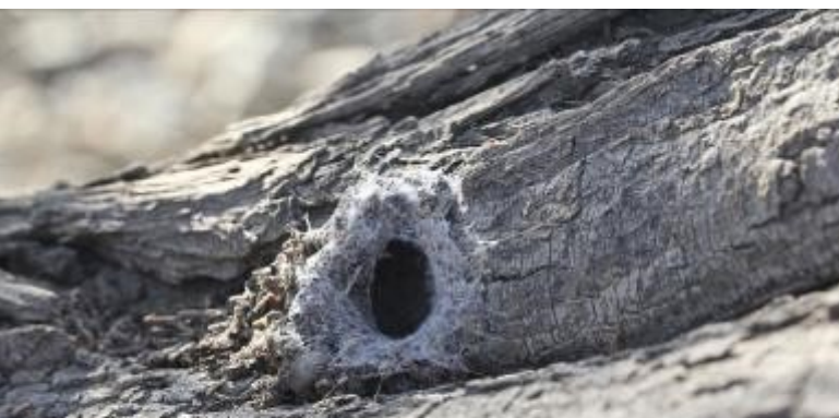
The characteristic flared burrow mouth of S. nigra , made of matted layers of fine, diffuse silk.