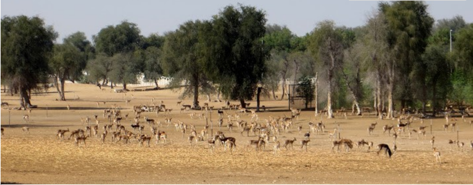
Gazelle herd on a private farm