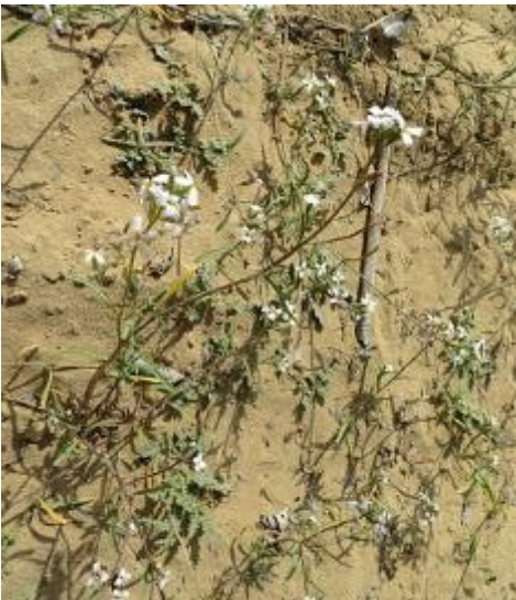
Eremobium aegyptiacum (meaning Desert Life) is much appreciated by butterflies