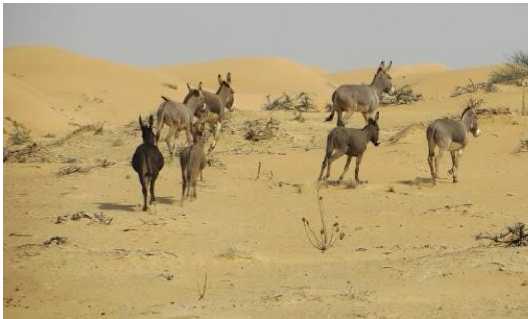
Feral donkeys on the move.