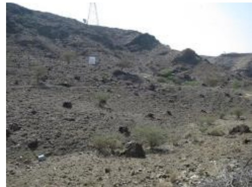
An overview of the beehive site