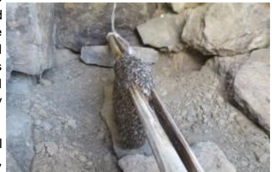
(above) A live hive