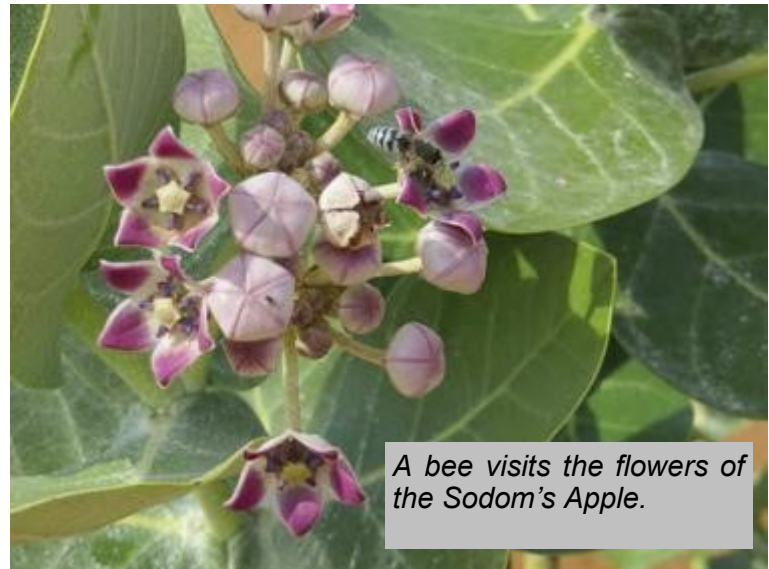
A bee visits the flowers of the Sodom's Apple.

There are many other plants in this area such as the Sodom's Apple ( Calotropis procera ) which is a flowering plant in the Milkweed family Asclepiadaceae. The Desert gourd ( Citrullus colocynthis ) is another example. Neither are very tasty, exuding