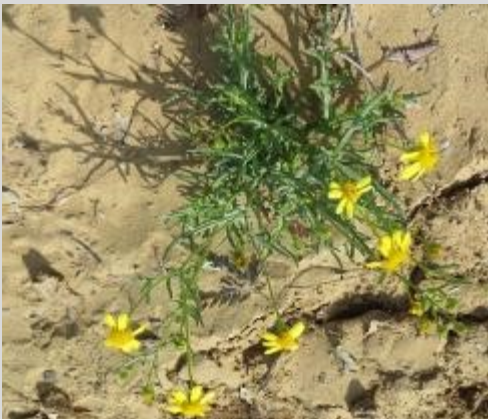
Senecio glaucus (L.)