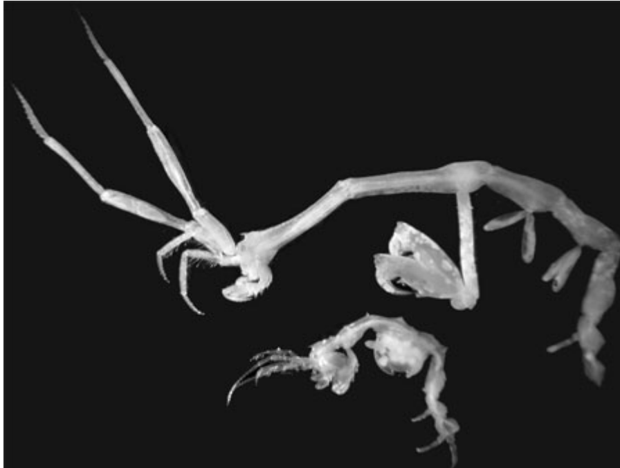
Figure 2. Caprella scaura . Adult male (18 mm) and ovigerous female (8 mm) from floating dock near entrance of Charleston Harbor, South Carolina, February 2002. Digital photograph, lateral views.