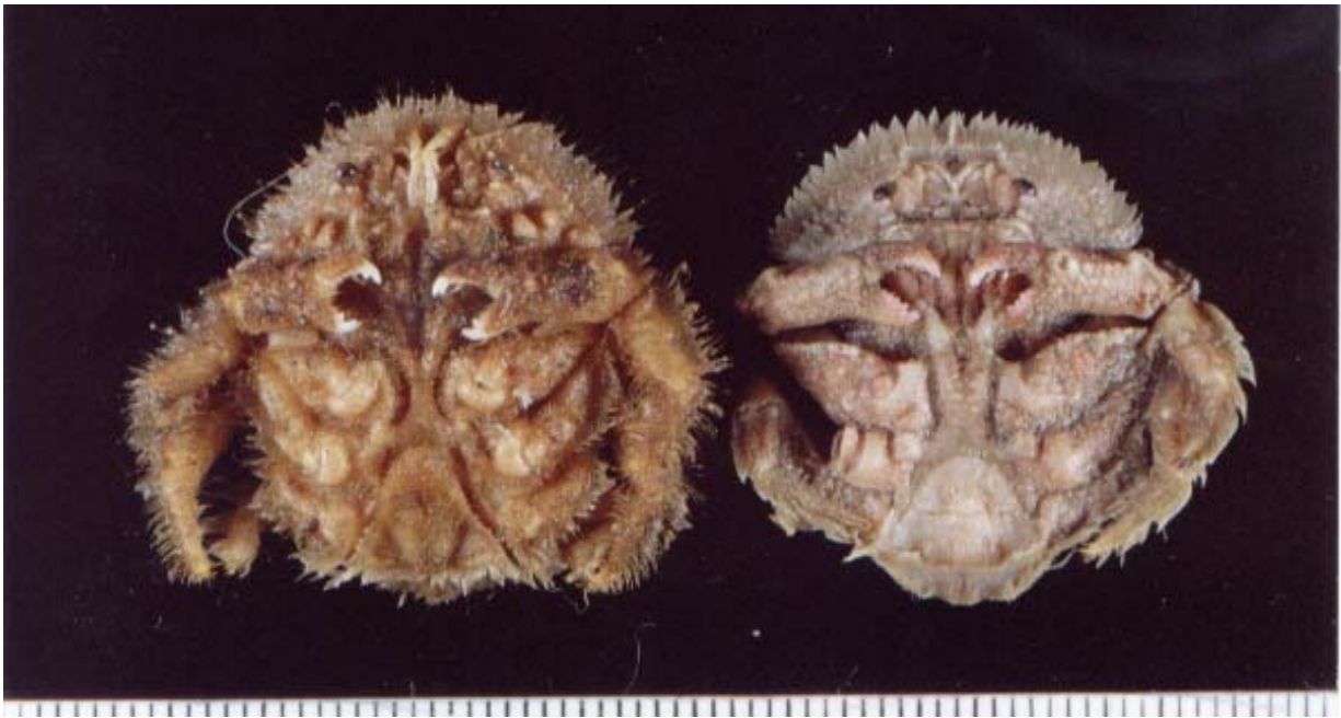
Figure 1. Hypoconcha parasitica (left), and Hypoconcha arcuata (right) without their attached shells.

Hypoconcha sp. (shellback crabs) are among some of the most interesting decapod crustaceans. As members of the Dromiidae family, these crabs have fourth and fifth walking legs that are modified to secure a bivalve shell on their back for protection. They can bear a fragment or a whole shell that is larger than their body size. Perhaps aided by pressure of its body against the shell, Hypoconcha sp. cling so tightly that removal from the shell without crushing it is almost impossible (Williams, 1984).