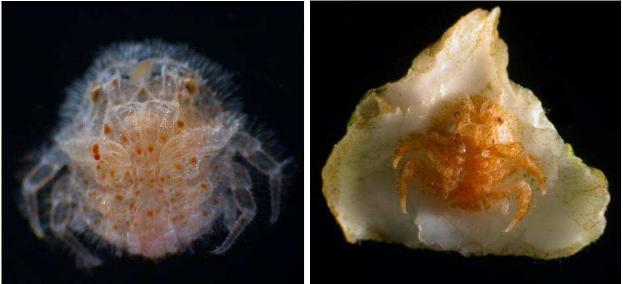
Figure 6. Juvenile stages of Hypoconcha spinosissima . The juvenile crab (right) is using a small fragment of a shell for protection.

Among the three mentioned species, Hypoconcha spinosissima is very interesting as it has several spines distributed on the body that may be seen in ventral view. Thus, one can easily recognize H. spinosissima by searching for the spines on the chelipeds (first claw) or covering the ventral portion of the carapace. These features can be seen even in a very small juvenile.