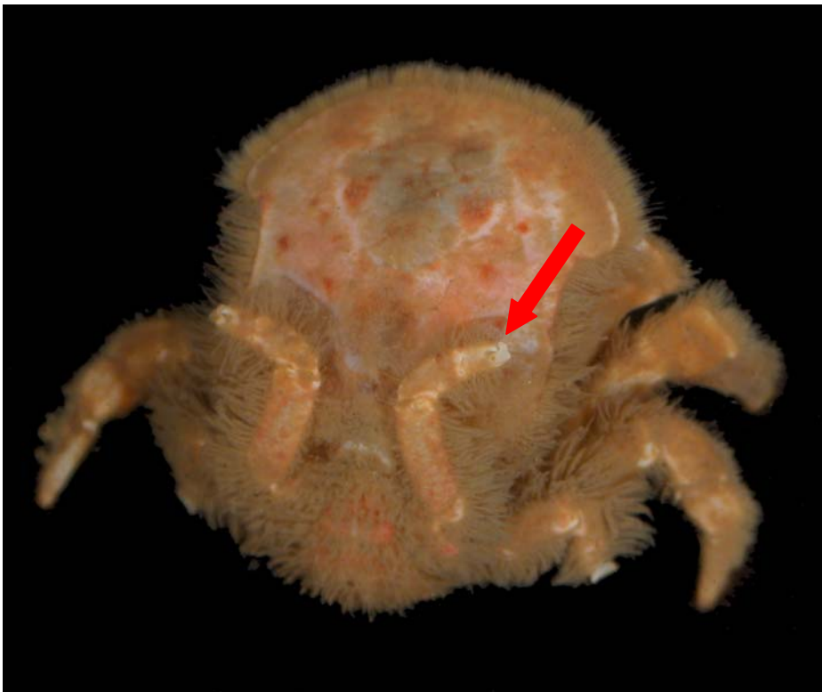
Figure 3. Dorsal view of Hypoconcha arcuata , showing the modified fourth and fifth walking legs. Note the hooked dactyl for grasping bivalve shells.