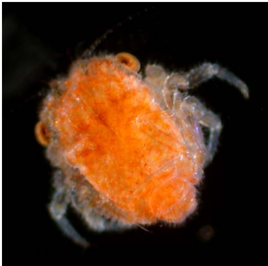
Figure 4. Megalopa of Hypoconcha spinosissima .

Larval crabs of Hypoconcha species (and most brachyurans) look very different from the adults. They pass through four larval stages: three stages of zoea and one transitional stage named “megalopa” or “glaucothoe”. During the larval period they live in the plankton and are prey of fishes and larger planktonic invertebrates. After the megalopa stage they molt to a small juvenile crab. During the juvenile and adult period they inhabit the sand and coral bottoms from coastal areas, eating small invertebrates. Females carry eggs in the abdomen during the warmer months of the year.