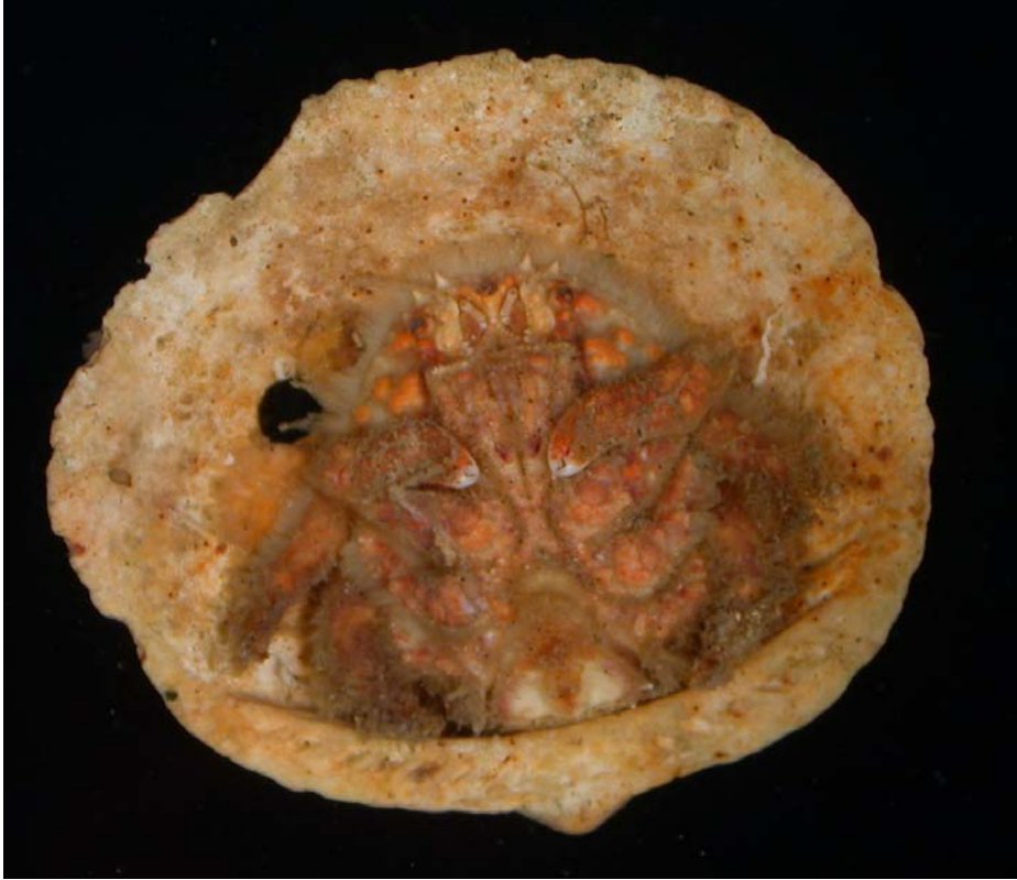
Figure 2. A female rough shellback crab, Hypoconcha parasitica in her shell.