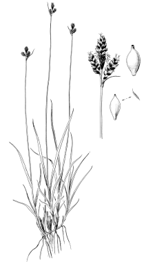
Illustration by Jeanne R. Janish, ©1969 University of Washington Press

Floral Characteristics: Lower bracts shorter than or exceeding the inflorescences. Lateral 1-2 (4) spikes female, the lower ones erect, on short peduncles. Terminal spike gynaeandrous. Upper spikes sessile, overlapping, forming a dense terminal cluster, spherical or oblong, 5-12 x 3-6 mm. Female scales dark brown or black, sometimes translucent near top, shorter than the perigynia, midvein inconspicuous. Perigynia erect, spreading or sometimes reflexed, pale green, becoming golden brown, veinless or few-veined, ovate, 2.5-3.5 mm, smooth or papillose, sometimes finely serrate toward the tip. Beak 0.3-0.4 mm long, with 2 shallow teeth. Stigmas 2-3.