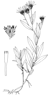
Illustration by John H. Rumely, ©1955 University of Washington Press

General Description: Rhizomatous perennial commonly 10 cm tall or less, but robust forms can be up to 50 cm tall. Plants glandless. Stems decumbent to ascending; stem and lower leaf surfaces sparsely to copiously short-haired. Leaves alternate, firm, sessile or the lower leaves subpetiolate, 2.5-8 cm x 4-25 mm, the very lowermost usually reduced; margins with a few small teeth or smooth. floral characteristics Radiate heads solitary to few, rarely up to 20 in a compact inflorescence. Involucre 6-9 mm high. Involucral bracts overlapping in several series, loose and sometimes squarrose, papery in texture and not green below, evidently to obscurely green-tipped above, and strongly purple-margined or suffused with purple. Rays usually 12-23, purple, 8-12 mm long. Flowers July to mid-September.