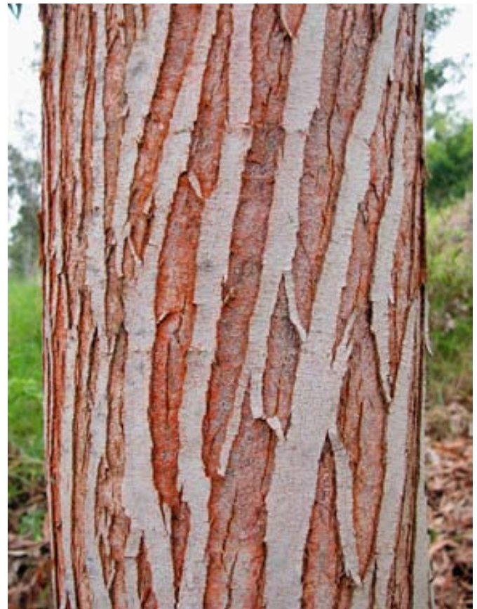
Transformation of bark from smooth to rough.

In many areas, koa flushes with new growth nearly year-round, slowing during dry or cool periods. Flowering takes places throughout the year in some areas and is strongly seasonal in others.