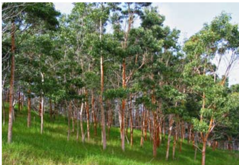
Honokōhau koa with understory maintained for brief periods by cattle and horses.

The initial density of regrown koa seedlings was 1200–5000 trees/ha (500–2000 trees/acre), which will be reduced to a final density of less than 125 trees/ha (50 trees/acre).