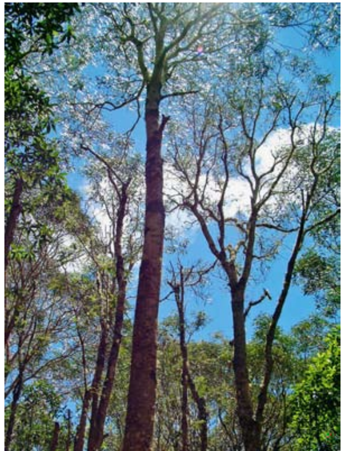
Koa casts a light shade (23-year-old koa trees at Keauhou Ranch, Ka‘ū, Hawai‘i).

Many native Hawaiian birds depend on koa forests directly or indirectly for habitat. Large old trees provide important nest sites. Commonly seen birds include the red ‘apapane ( Himatione sanguinea ) and ‘iwi ( Vestiaria coccinea ), the yellow ‘amakihi ( Loxops virens ), and the inquisitive ‘elepaio