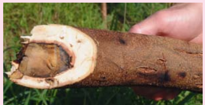
Left: Crown of a tree infected with koa wilt, showing leaf yellowing and loss. Right: Koa wilt attacking an experimental plantation and cut stem of an infected tree showing staining of the sapwood and cankers on the bark.