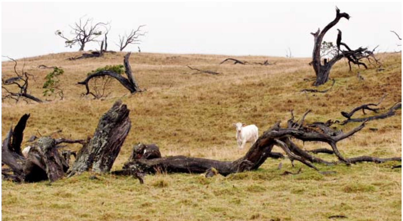
Dying and dead koa trees in pasture.