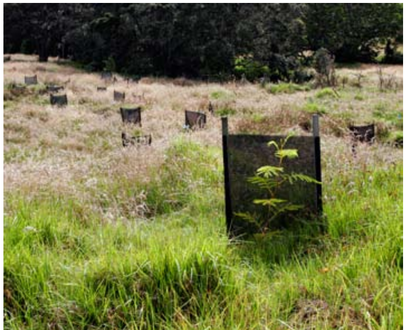
After an overnight frost, young seedlings may be killed by overly rapid thawing caused by direct sunlight. Here sun screens are placed to shield seedlings from early morning sunlight, giving seedlings time to slowly warm up. Hakalau National Wildlife Refuge, Hawai'i.

Koa can tolerate drought for 3–5 months, depending on