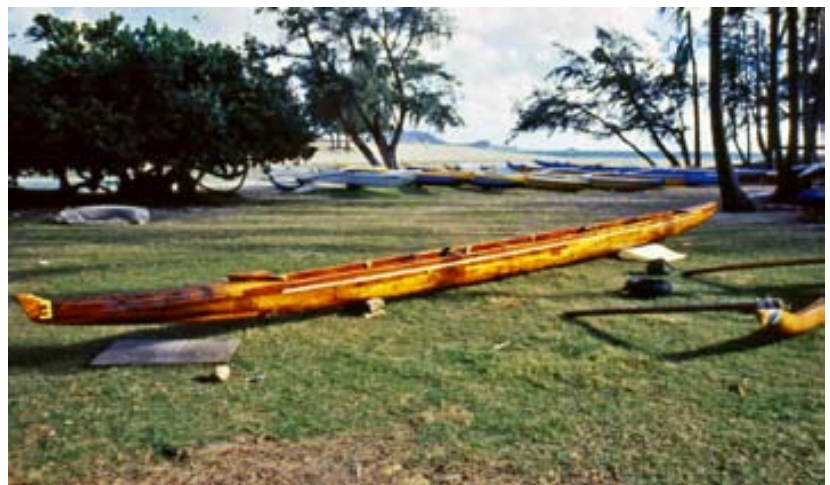
Modern day koa racing canoe (outrigger detached on right) named Lanakila Mau O Ka Lōkahi.

Koa was traditionally used for canoes (wa‘a), from one-person fishing canoes to the huge voyaging canoes that could sail between islands and across vast expanses of ocean. In