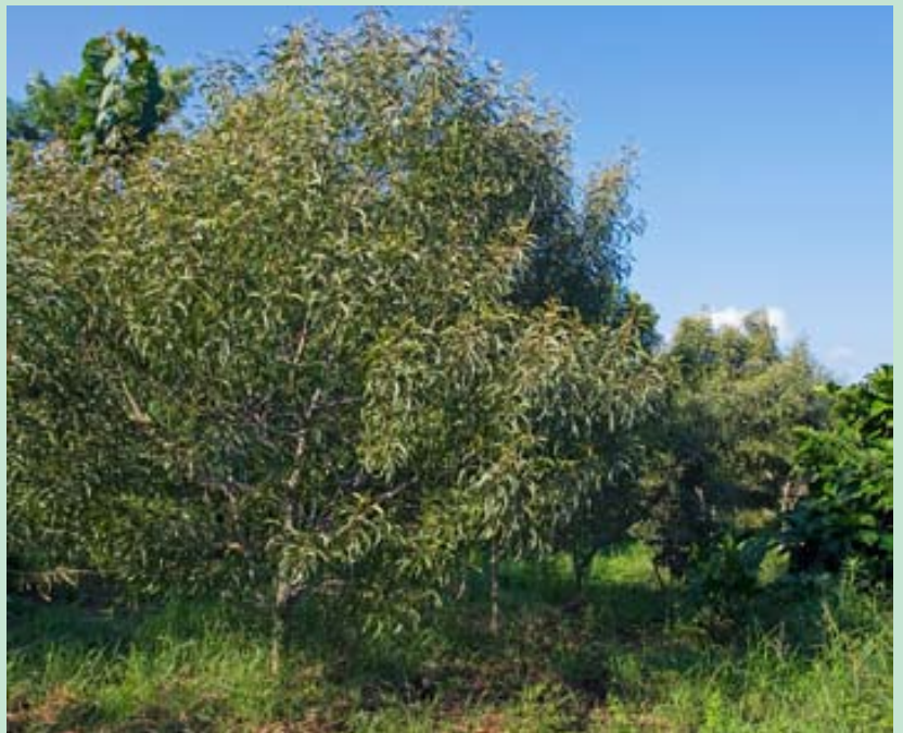
Top: Gnarled framework of old koai'a tree, Pu'u o kali, Maui. Bottom: Hedge of koai'a along property boundary, Kailua-Kona, Hawai'i.

eases, including koa wilt, which may shorten its life considerably. Even so, it is well worth planting this rare tree in Hawaiian landscapes.