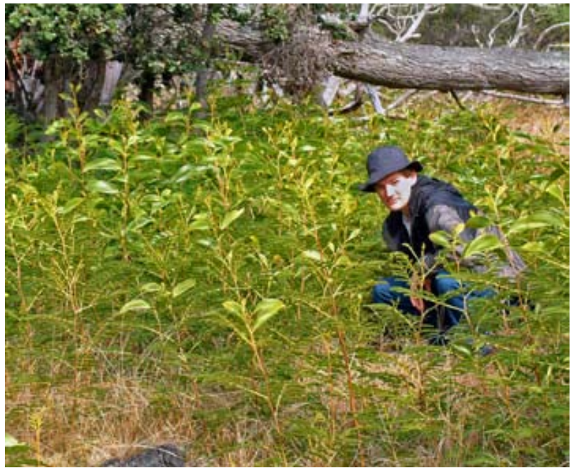
Travis Idol observes koa root sprouts springing up after removal of cattle, Mauna Loa.

Mature native forests contain diverse tree species and may have only a few koa trees per hectare. Koa will not regenerate in forest shade or even under its own sparse canopy, nor is it able to grow up through the canopy of other trees. Once a koa tree is overtopped by another tree, its growth ceases. In natural forests with only a few very large koa per hectare, koa probably depends on large tree-fall gaps to regenerate. Stands of young koa can be seen growing up adjacent to large ancient stumps left over from logging or huge stems that were toppled by storms. Silvicultural systems for koa forest regeneration can rely on natural regeneration through the seed bank, but enough light must reach the forest floor for young koa trees to grow. Harvesting systems in dense mixed-species forests where single trees are selected and cut are likely to result in “high-grading” or the removal of the koa from the forest rather than the regeneration of a healthy koa forest. “Group selection” sys-