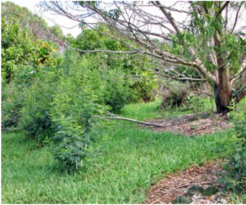
Root suckering (on left) occurs frequently when a tree is severely stressed (on right) or when surface roots are damaged.

tive koai'a ( Acacia koaia ). The rare koai'a is a shorter tree with a bushy, often gnarled habit, primarily of drier areas of Kaua'i, Moloka'i, Lāna'i, Maui, and Hawai'i (see koai'a section below).