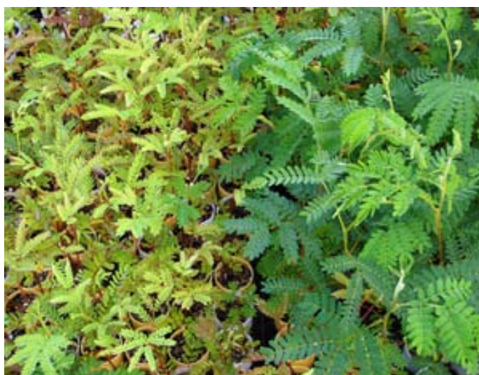
Left: Breaking seed coat dormancy through scarification is important to ensure fast and uniform germination; the nicking method is shown here. Right: Seedlings that were not inoculated with rhizobia (on left) were pale and less vigorous than their same-age, inoculated counterparts (on right).