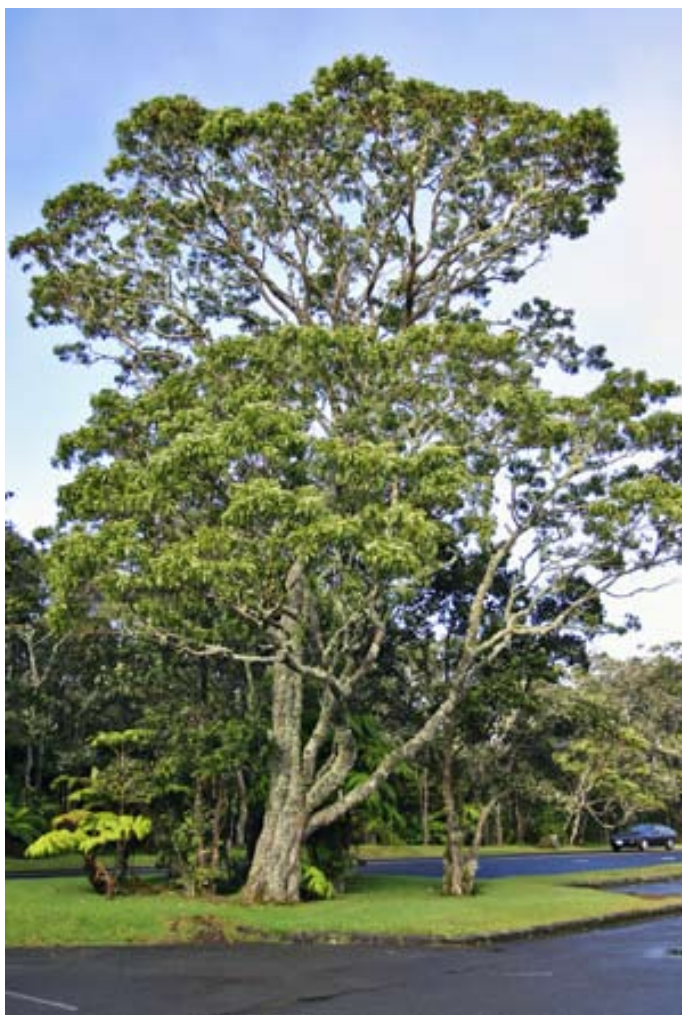
Left: Damage to surface roots and trunk causes undue stress. Right: In the right conditions, and with proper care, koa trees can live many years in a landscape, Volcanoes National Park, Hawai'i island.