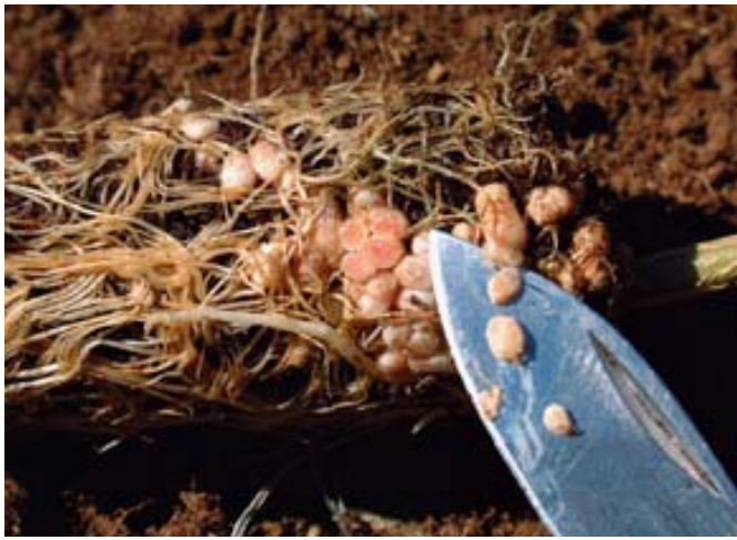
Pink nodules on the root system of a koa seedling, indicating active nitrogen fixation.

soil, competition from weeds, relative humidity, winds, and other factors.