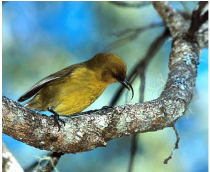
‘Akiapōlā‘au on koa branch.

Koa makes a spectacular ornamental, although there are pest and disease concerns below 610 m (2000 ft).