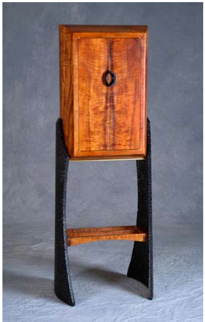
Cabinet of curly koa by Marian Yasuda.

Common pests include pathogenic fungi and twig borers. Avoiding overwatering and damage to roots, trunk, and branches may reduce the risk of attack by pathogenic fungi. Twig borers tend to attack seasonally, usually during dry periods, and healthy trees recover. Trees also can recover from light seasonal damage by whitefly, beetles, thrips, scale insects, Chinese rose beetle, and mites. Leafhoppers that cause defoliation and stippling of the leaves can be treated with soapy water.