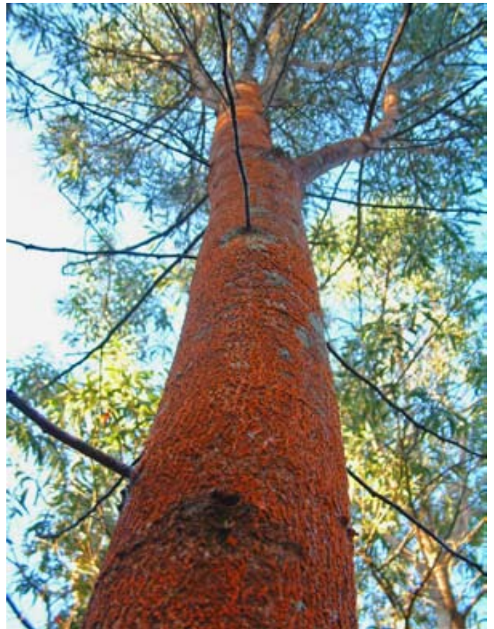
Left: Muriel and Kent Lighter show trees that were planted in circles of six to eight seedlings. After 5 years there are about 400 trees/acre, and the best trees will be released by thinning out the poorer trees. Right: Koa trees self-prune when grown in dense stands.

native plants such as palapalai ( Microlepia strigosa , an ornamental fern used in the hula), maile ( Alyxia oliviformis , a scented vine), māmaki ( Pipturus albidus , a native nettle used to make a medicinal tea), and pepeiao ( Auricularia , an edible fungus) show promise. Koa plantations allow light to penetrate the canopy and usually support a grass understory, which may be grazed occasionally by livestock if care is taken to avoid damage to the trees (see section on silvopasture, below).