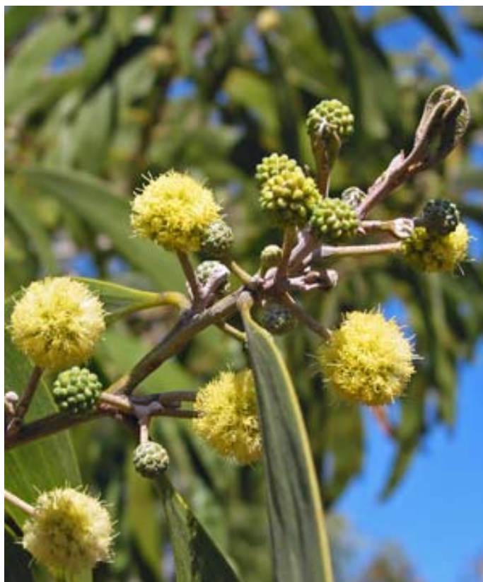
Left [scale: 1/3 size]: Young koa trees have true leaves (on left). At about 6–9 months of age, trees begin producing flattened, elongated leaf stems called phyllodes (on right) instead of true leaves. Right: Flowering branch tip.