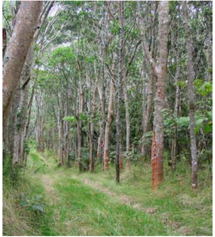
Left: Koa boundary for coffee orchard. Right: 23-year-old koa regeneration at Keauhou Ranch, Hawai'i.