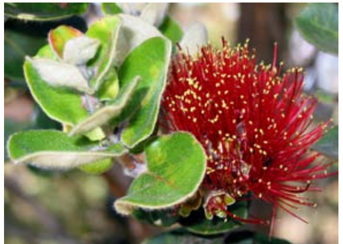
'Ōhi'a lehua, the most common native Hawaiian tree, is almost always found growing with koa.

Koa is the second most important and widespread tree in Hawaiian forests after 'ōhi'a lehua ( Metrosideros polymorpha ). While koa may occasionally occur in pure stands, usually the species is found in mixed forests where 'ōhi'a lehua predominates. On mesic sites, the koa canopy may also be shared with a'e ( Sapindus saponaria ) and naio ( Myoporum sandwicense ). A wide variety of native understory trees are found in koa forests, including naio, 'ōlapa ( Cheirodendron trigynum ), kāwa'u ( Ilex anomala ), kōlea ( Myrsine lessertiana ), kōpiko ( Psychotria spp.), 'iliahi ( Santalum spp., sandalwood), olopua ( Nestegis sandwicensis ), and pilo ( Coprosma spp.). In wetter sites, tree ferns ( Cibotium spp.) may be prominent in the understory, while other species of ferns such as palapalai ( Microlepia strigosa ) and Dryopteris wallichiana cover the ground. The native Hawaiian raspberry or 'ākala ( Rubus hawaiiensis ) and the shrub māmaki ( Pipturus albidus ) are also common in the understory of koa forests. At higher elevations the forest gradually becomes dominated by māmāne ( Sophora chrysophylla ) (Mueller-Dombois and Fosberg 1998). Today, many koa forests consist of scattered old trees in rangelands dominated by kikuyu grass ( Pennisetum clandestinum ).