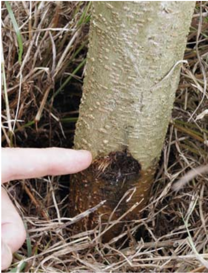
Damage with a power weed cutter happens in an instant and seedlings usually never recover.

bacteria selected for this species (available from commercial suppliers or from nodules collected from the roots of healthy forest trees). Strains of rhizobia selected by researchers are best for optimum nodulation and nitrogen fixation.