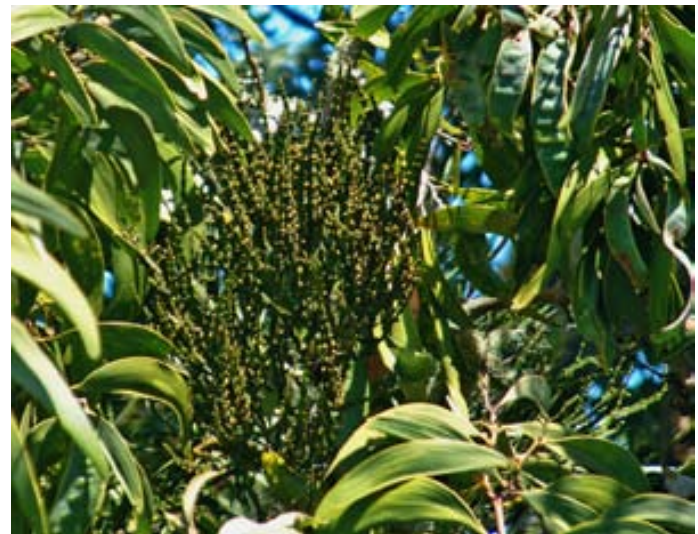
Top left and right: Damage caused by twig borer. Bottom left: Rust on phyllodes. Bottom right: Mistletoe ( Korthalsella spp.).