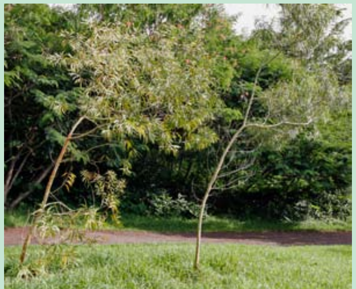
Left: Twelve-year-old koai'a tree growing along path at Amy Greenwell Ethnobotanical Garden, Kealakekua, Hawai'i. Right: When grown in a lawn, koai'a and koa become spindly and stressed.