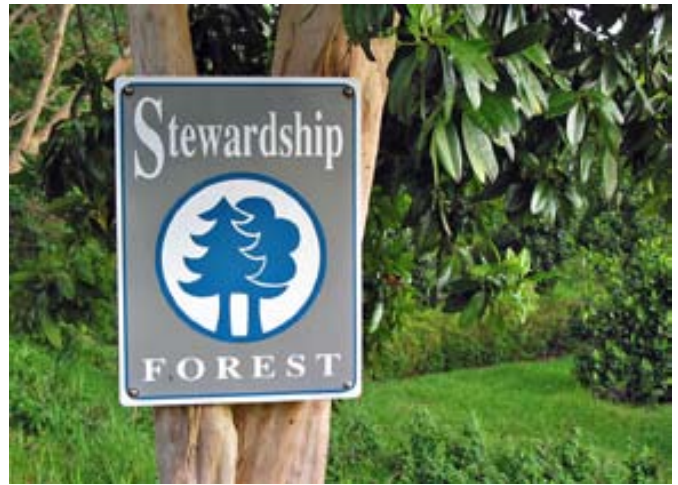
The Forest Stewardship Program is one of many programs offering financial assistance for landowners who are investing in forests.

Hawai'i Forest Industry Association (HFIA) P. O. Box 10216 Hilo Hawai'i 96721 Street address: 162 Kino'ole Street, #101 Hilo, Hawai'i 96720-2816 Tel: 808-933-9411; Fax: 808-933-9140 E-mail: info@hawaii-forest.org Web: http://www.hawaii-forest.org/