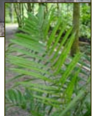
AF004P Elaeis guineensis , Africa