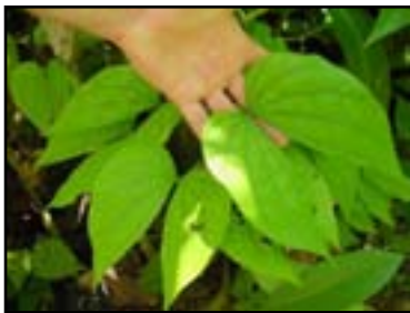
Bauhinea guianensis, Liana