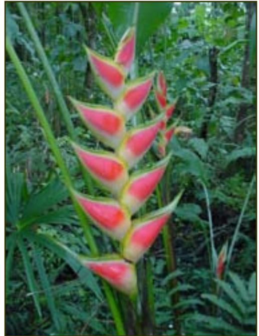
AM100U Heliconia wagneriana , America