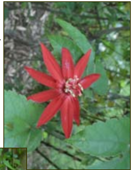
AM078C Passiflora vittifolia , America

Lianas and climbers are gathered in this group. Lianas are in fact a very slender tree that are unable to sustain itself and therefore uses another tree to rapidly grow all the way up to the crown of the "helper" – and there develop a crown that will compete for the light. Climbers are also using trees to escalate using their roots to cling to the trunk. Climbers rarely emerge in crown foliage of the "helper" but stays below in the shade.