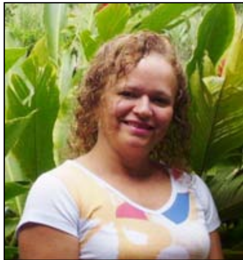
Secretary in San Jose.