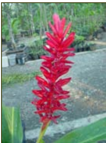
AS030U Zingiber officinale , Asia