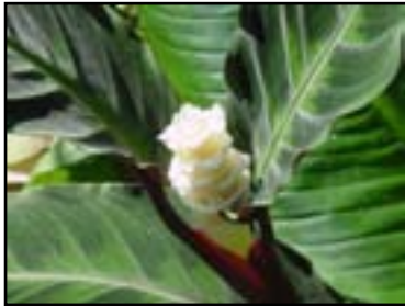
Beautiful Calathea warscewiczii always on stock

Besides being a professional supplier of tropical plants – our business is to be consultants from the beginning of your project. We work both at our homeoffice in Denmark and at our nursery in Costa Rica. We produce a wide range of true rainforest species.