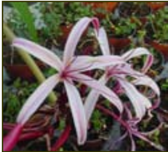
AM107U Crinum rubescens , America