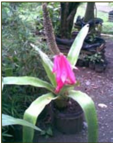
AM287E Aechmea mariae-reginae , America