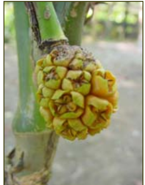
AM324E Evodianthus funifer , America