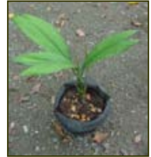
AM142P Chamaedorea robertii , America

Some palms are emergents that thrive in the warm and sunny exhibit. Some palms prefers the shade and coolness in the understorey.