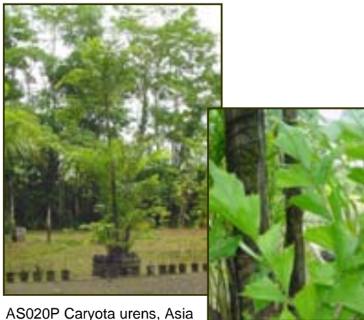
AS020P Caryota urens , Asia