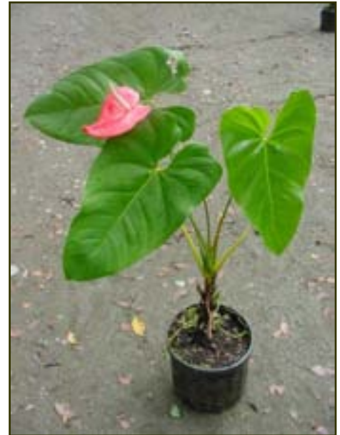
AM042E Anthurium andreanum , America