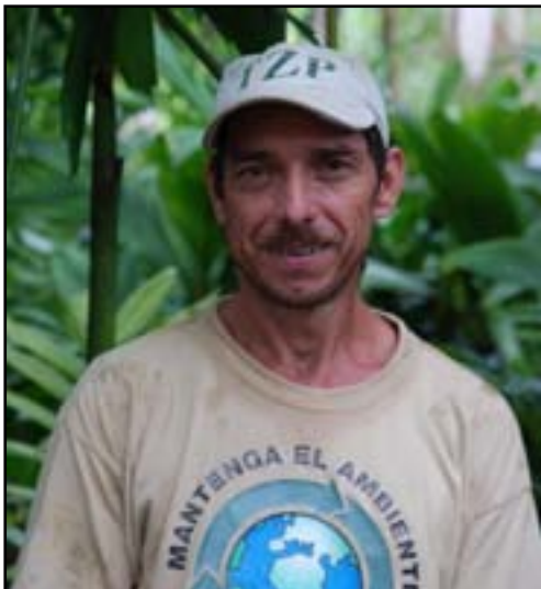
Leader of the nursery.

The employees in Costa Rica are local people from the the village.