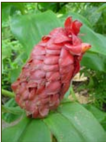
AM315U Costus barbatus , America