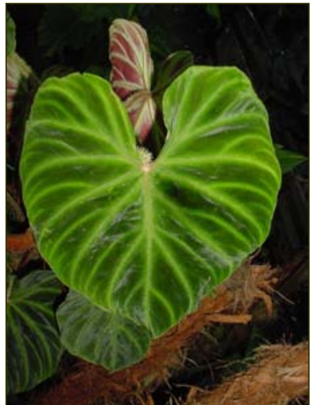
AM234C Philodendron verrucosum , America