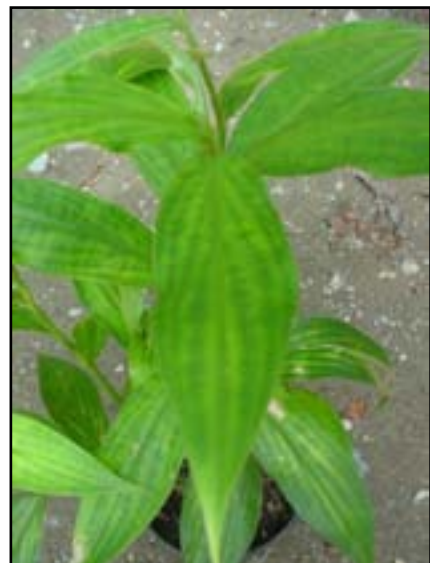
Costus villosissimus AM031U