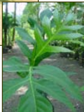
AS018T Artocarpus altillis , Asia