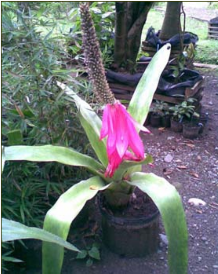
AM287E Aechmea mariae-reginae , America

Their roots cling to the tree, but they are not parasitic and not any hazard to the tree in general.