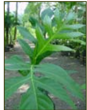
AS018T Artocarpus altillis , Asia