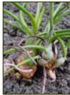
AM283E Tillandsia bulbosa , America