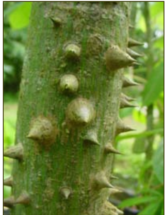
AM017T Ceiba pentandra , America

Some species are fast growing pioneer trees, others are slow growing hard wood – and some are bearing fruit for consumption by animals or humans.