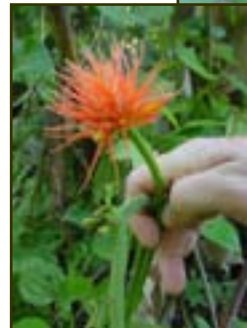
AM077C Gurania makoyana , America