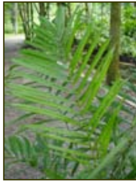
AF004P Elaeis guineensis , Africa