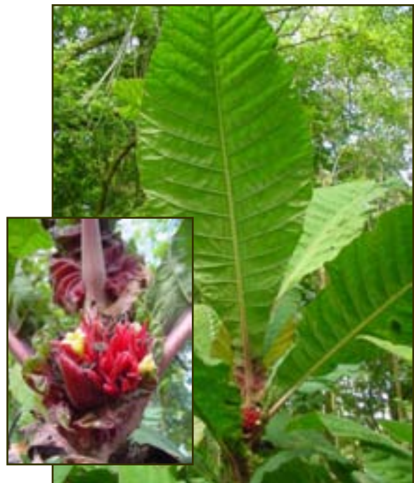
AM081U Pentagonia wendlandii , America