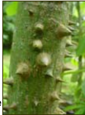
AM017T Ceiba pentandra , America

Please be aware that we hold many more species in stock than the list shows. We are working on the registration of all our species.