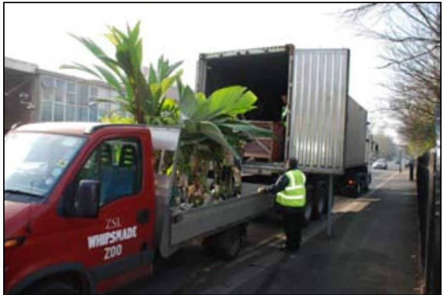
Plants from the nursery arrive at London ZOO, 2008.

We receive your order with the requested plantnames and sizes. Following we help you adjust the order to suit the special wishes for your ZOO exhibition. On our web-site, you can find our plantlist in the feature Plant Search .