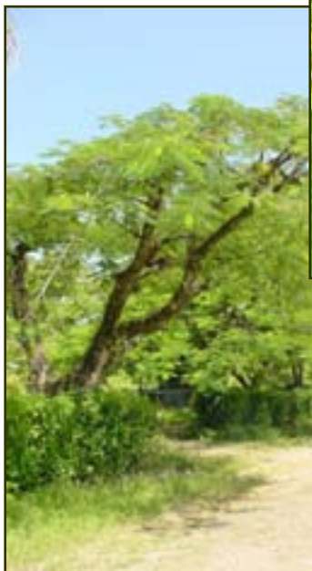
AF002T Delonix regia , Africa