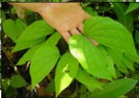
AM202C Bauhinia guianensis , America