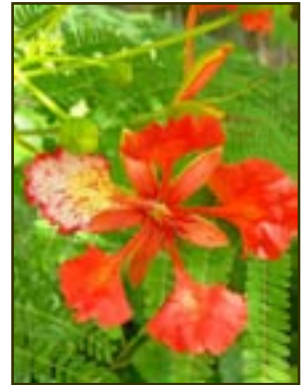
AF002T Delonix regia , Africa