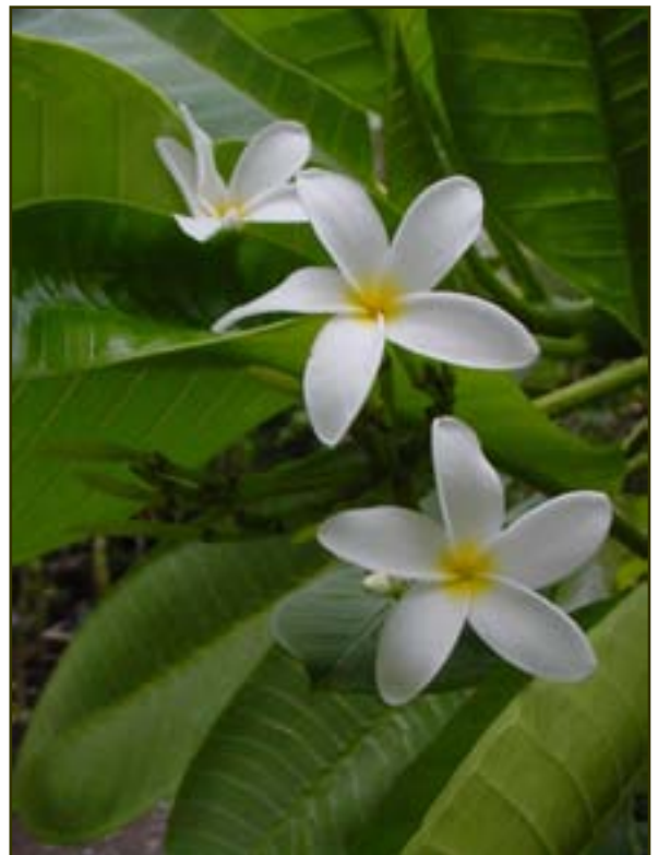
AM012T Plumeria rubra , America