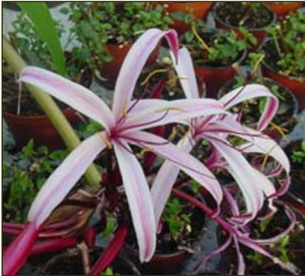
AM107U Crinum rubescens , America

These plants we find in the shade of the emergent trees or developing in the light gaps of fallen giants or landslide areas.