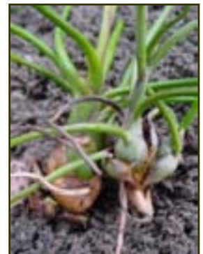
AM283E Tillandsia bulbosa , America