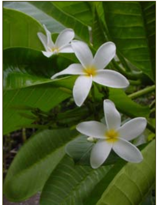
AM012T Plumeria rubra , America

Click PLANTSEARCH to see our plantlist on www.tropicalzooplants.dk