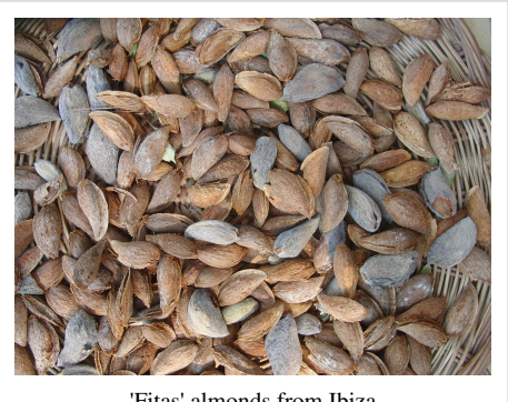
'Fitas' almonds from Ibiza