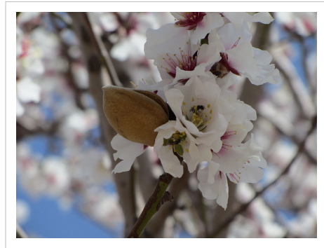
Almond blossoms with its fruit in Tudeshg, Isfahan, Iran

Almonds begin bearing an economic crop in the third year after planting. Trees reach full bearing five to six years after planting. The fruit matures in the autumn, 7–8 months after flowering.