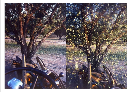
An almond shaker before and during a harvest of a tree

The world produced 2.00 million tonnes of almonds in 2011 according to Food and Agriculture Organization, with United States the largest producer at 0.73 million tonnes. The apparent 50% decrease in production by the United States led to a calculated percentage of world production decrease from 56% to 36%; however, a 2013 news article indicated the United States produced at least 80% of the world's supply.