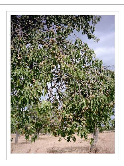
Almond tree with ripening fruit. Majorca, Spain.