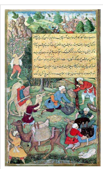
Harvesting of the almond crop at Qand-i Badam, Fergana Valley (16th century)

The almond is native to the Mediterranean climate region of the Middle East, eastward as far as the Indus.<sup>[2]</sup> In India, it is known as badam. It was spread by humans in ancient times along the shores of the Mediterranean into northern Africa and southern Europe and more recently transported to other parts of the world, notably California, United States.