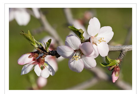
Flowering (sweet) almond tree

The bitter almond is slightly broader and shorter than the sweet almond, and contains about 50% of the fixed oil that occurs in sweet almonds. It also contains the enzyme emulsin which, in the presence of