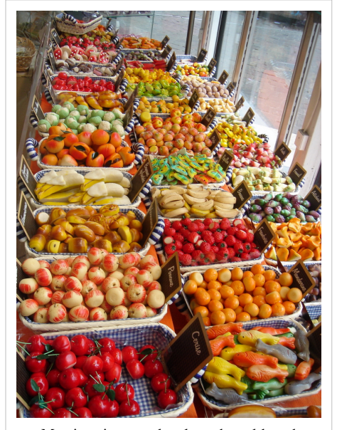
Marzipan is a popular almond meal-based confection. It is artistically shaped into festive motifs, figures, and fruit shapes such as those shown above in a Paris shop.

Almonds can be processed into a milk substitute called almond milk; the nut's soft texture, mild flavour, and light colouring (when skinned) make for an efficient analog to dairy, and a soy-free choice for lactose intolerant people and vegans. Raw, blanched, and lightly toasted almonds work well for different production techniques, some of which are similar to that of soymilk and some of which use no heat, resulting in "raw milk" (see raw foodism).