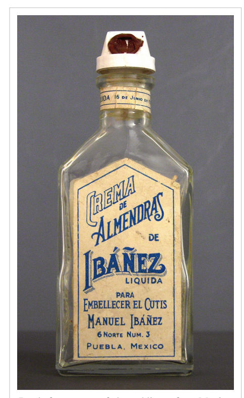
Bottle for a cream of almond liquor from Mexico (beginning of 20th century) from the permanent collection of the Museo del Objeto del Objeto