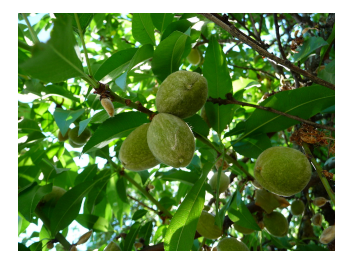
Young almond fruit